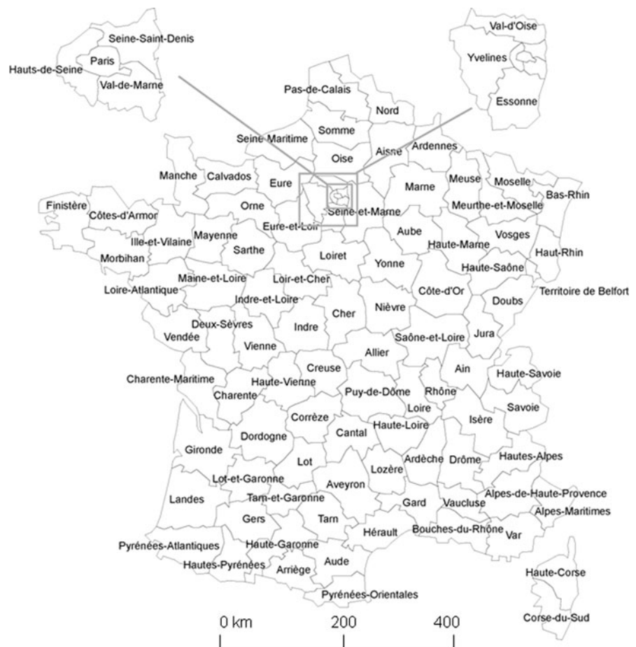
Fig. 1 Map of the French départements

recent survey produced by the Limoges laboratory in 2006 (Billet 2006; Bouin 2006; Delivre-Gilg 2006; Drousseau 2006; Drobenko 2006; Fevrier 2006; Prieur 2006) completes this work. Our contribution focuses on the great spatial heterogeneity between the different départements , thanks not only to this earlier work but also to information from two additional sources. The first, from the French environment institute (IFEN 2002) contains data concerning all the French departmental councils. The second comes from a survey we sent out to all 96 départements , 71 of which, i.e. 74%, answered (Table 1), which shows that the different départements are interested in this kind of analysis. This survey asked whether or not a Departmental Tax on Sensitive Natural Spaces (DTSNS) was levied; if so, at what rate; the rate, the kinds of environment considered as SNS (Table 1); and the kinds of policies implemented (Table 2) using the revenue raised by this tax. Our statistical analysis is supported by data concerning the 96 départements .