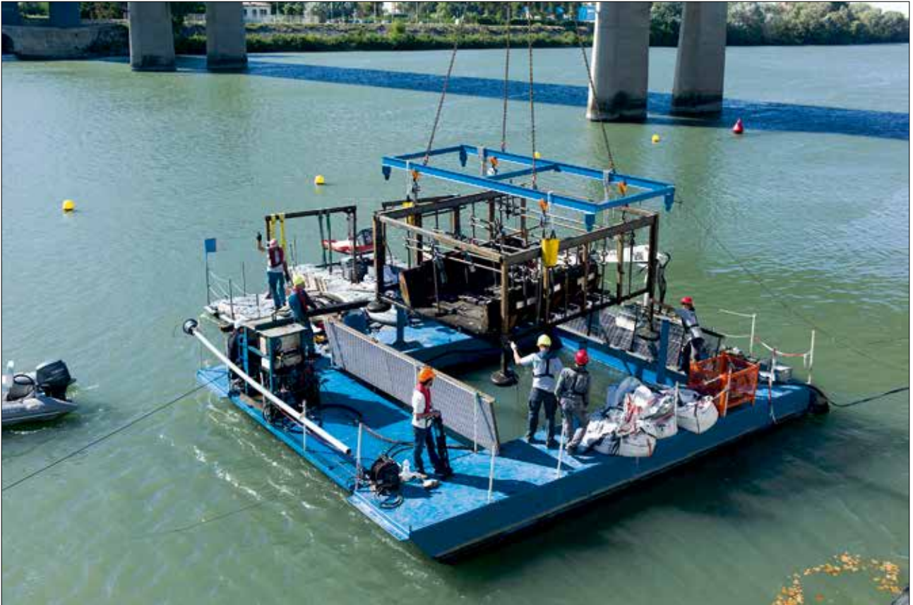
Fig.1. Raising of one of the ten sections of the Arles-Rhône 3 barge with, in the background, on the left bank of the Rhone, the blue archaeological museum.