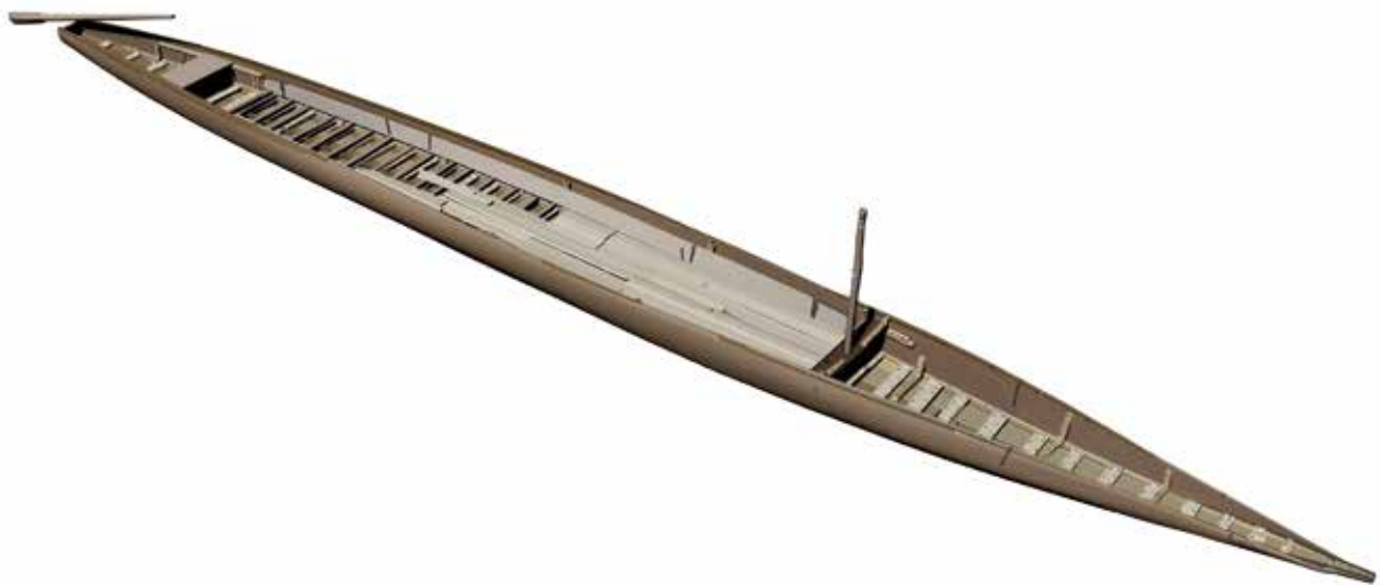
Fig. 3. The 3D restoration (Model: © Pierre Poveda, Ipso Facto).

Two more problematic issues particularly caught our attention during this restoration task: on the one hand we needed to recover the aperture angle at which the side planks opened up after being seriously deformed over time in the water 3 , and on the other hand we wanted to figure out how to fill in the missing elements from the barge's stern. Relating to the side planks' aperture angle, the only unquestionable point of reference was located at the mast-thwart, the length of which allowed us to define the aperture angle at which the side planks opened up at that exact point. From there, and based on a symmetrical opening on both sides, it appeared that the initial opening angle of the flanks was 92°. Regarding the restoration of missing parts at the stern, the first step consisted of symmetrically restoring the port side assemblage based on the preserved starboard side. At the stern, considering the replacement of the steering oar and the positioning of the helmsman that we could deduce, we favoured the hypothesis of a one-piece rear transom onto which the steering oar would rest, similar to that which has been done on