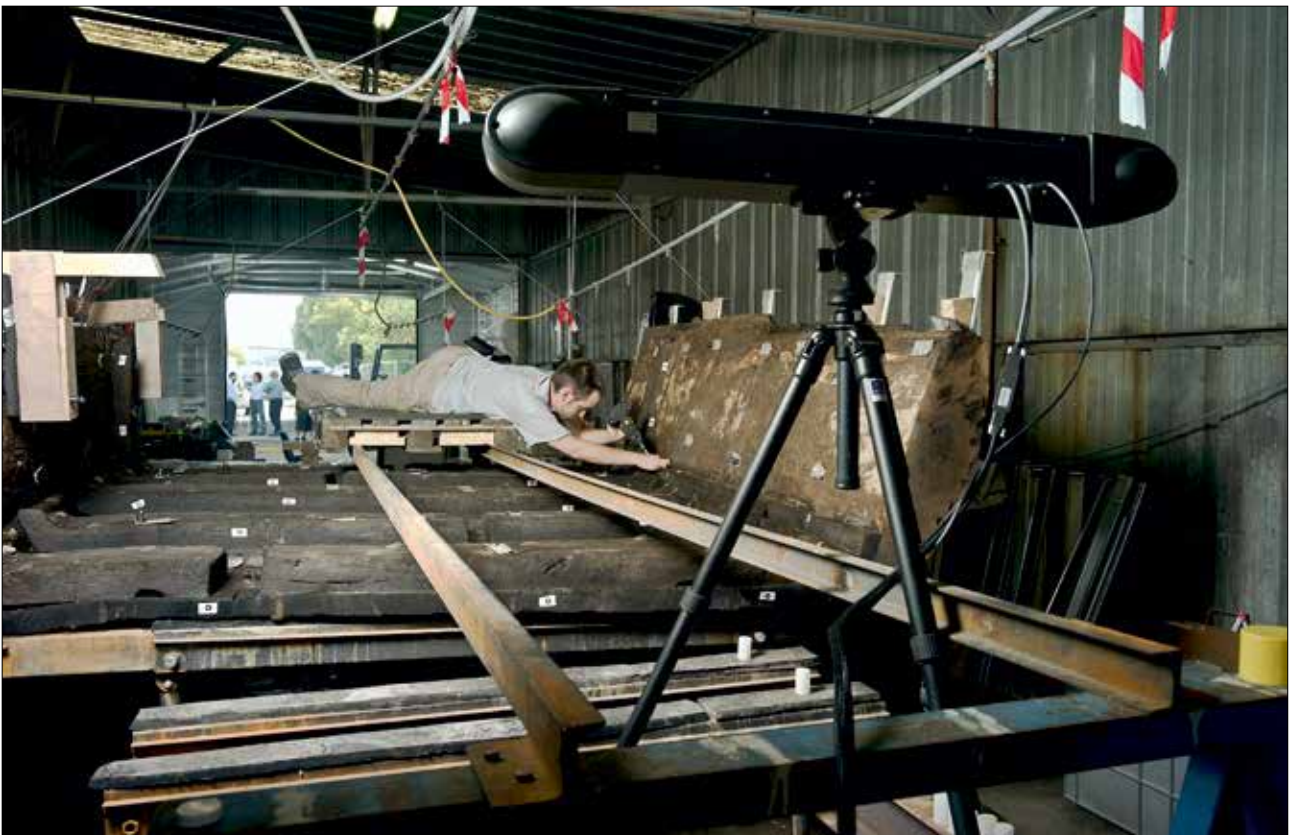
Fig. 2. 3D recording using a C-Track.