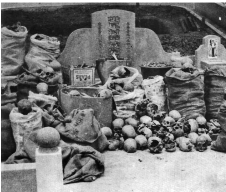
Figure 10.2 Excavated remains from the Parit Tinggi mass grave are placed at a temporary tomb awaiting burial at Kuala Pilah Chinese Cemetery.