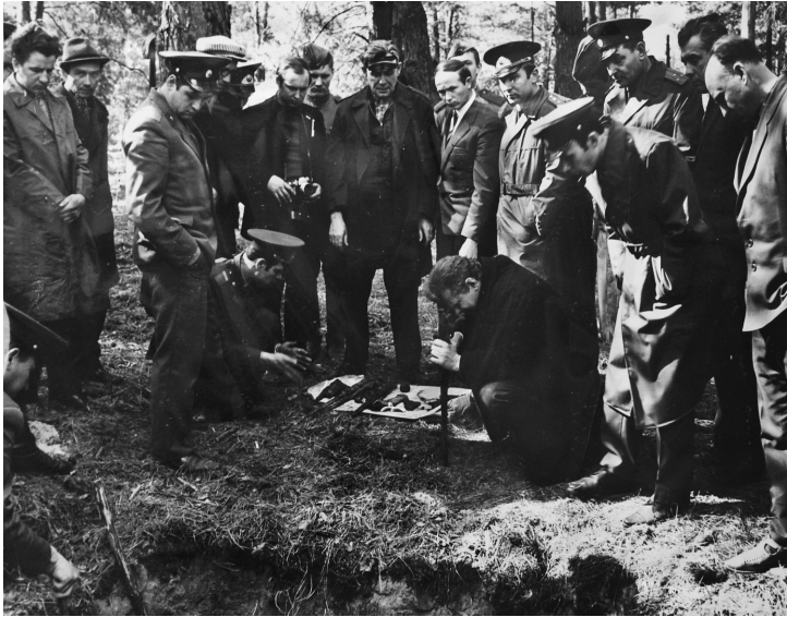
Figure 3.1 KGB officers look on as a forensic expert examines human bones extracted from the Bykivnia mass graves. April 1971.

of the Polish identity of many of the victims. A man called Feodosii Riaboshtan worked at a furnace at the Ninth Forest Factory on the Left Bank. One night two uniformed men visited him and ordered him to burn the contents of six or seven bags that had a stench of corpses. Riaboshtan saw they were old passports, birth certificates, and similar documents, and refused – until he was promised a bottle of liquor. He died in unusual circumstances shortly thereafter. 39