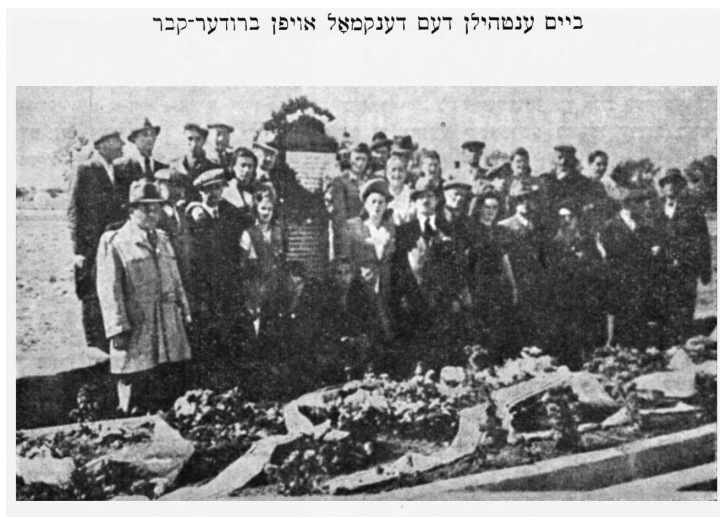
Figure 2.2 Survivors from Skierniewice surround the collective grave of the town's Jewish victims and the monument erected in their memory during its unveiling in August 1947.

liquidated the ghetto on 27 October 1942, deporting some 4,000 Jews to their death in Treblinka, murdering sixty to eighty Jews on the spot, and sending 1,600 Jews to three factory slave-labour camps in nearby Starachowice. At the end of July 1944, the Germans liquidated the Starachowice camps, deporting roughly 1,200 to 1,400 Starachowice Jews to Auschwitz-Birkenau. About sixty Jews were killed trying to escape; many were killed on the periphery of the main camp during a breakout attempt on the eve of the deportation. Others were killed when the Germans discovered them hiding in bunkers below the barracks. Some 600 to 700 Jews who were deported from Starachowice to Birkenau survived to see the end of the war. 17 No Jewish community was re-established in Wierzbnik after the war.