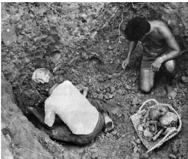
Figure 10.1 Workers using rudimentary tools to excavate the mass grave at Parit Tinggi.