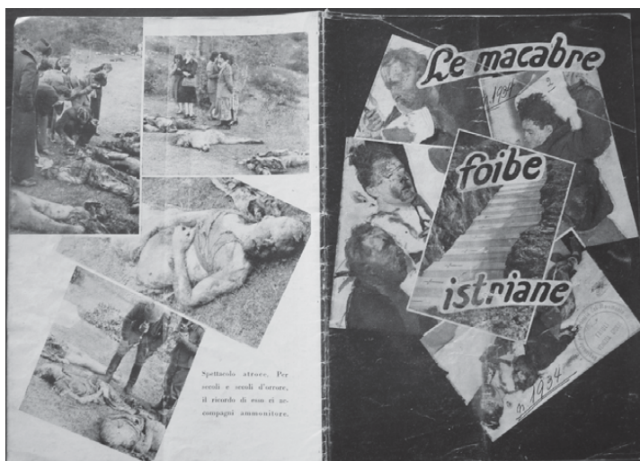
Figure 3.2 Cover of Le macabre foibe istriane , a Nazi–Fascist booklet printed in 1944

Between the end of January and March 1944, two publications were circulated among the locals by German and Salò authorities, one shortly after the other: Le macabre foibe istriane ('The Macabre Istrian Foibe') and Ecco il conto ('Here's the Bill'). These publications showed some of the corpses extracted from the Julian caves clearly and in detail. The authors of the two sixteen-page booklets cannot be identified, nor is it possible to ascertain their place of publication or their circulation. Considering similar publications of the same era, in the same area, the circulation could have been a few thousand copies. In any case, by analysing the content of the two booklets, we can formulate some hypotheses and we can argue that at least the first one was also addressed to the residents of the Italian Social Republic, as Istria was referred to as 'the other side' of the Adriatic Sea; in other words, it seems that the writer was not from the borderland, but from within the Italian peninsula, in relation to which Istria and the surrounding areas appear as the other side of the Adriatic Sea. 24