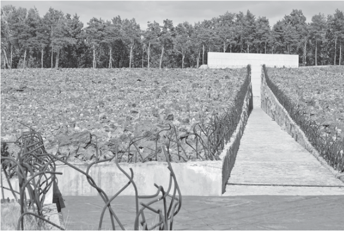
Figure 2.1 Museum-Memorial site at Belzec

in Poland and its – one can assume – problematic status vis-à-vis the ‘local populace’, began to draw attention and criticism from a number of sources. In 1994 an Israeli citizen, outraged by the state of the site and the anti-Semitic inscription on the monument, alerted international Jewish organisations and the Israeli state. Consequently, in 1995 a formal agreement was reached between the US Holocaust Memorial Museum in Washington and the Polish government, obliging the Polish side to redesign the memorial landscape at Belzec. Soon thereafter, a closed national competition was announced. The winning project, by Polish sculptors Andrzej Sołyga, Zdzisław Pidek and Marcin Roszczyk, was unveiled in the summer of 2004 in the presence of high-ranking officials from Poland, Israel and the United States, Jewish religious authorities from Poland and abroad, and the Holocaust survivors.