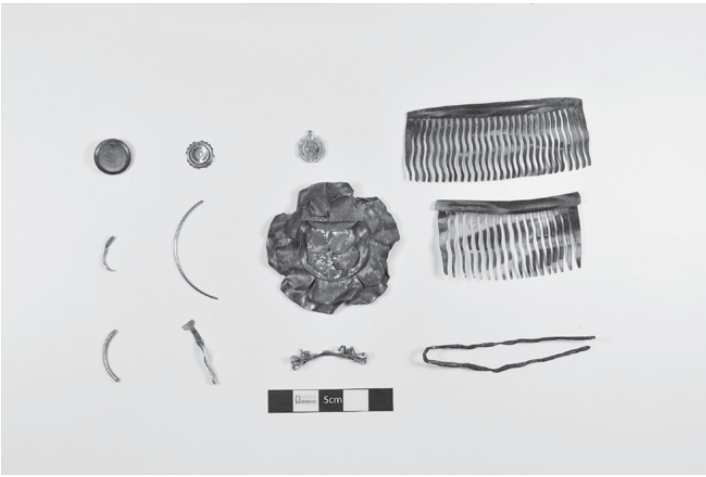
Figure 7.2 Some of the personal items unearthed during excavations in the area of the Old Gas Chambers at Treblinka that survive as a testament to the individuals who were sent there

important information about the ways in which people were disposed, 'offender behaviour' and attitudes towards these places in the past. For example, at both the extermination camp and execution site, non-invasive methods provided the dimensions of several mass graves and it was possible to plot their distribution and examine spatial relationships between the graves, structures and the movement of people.