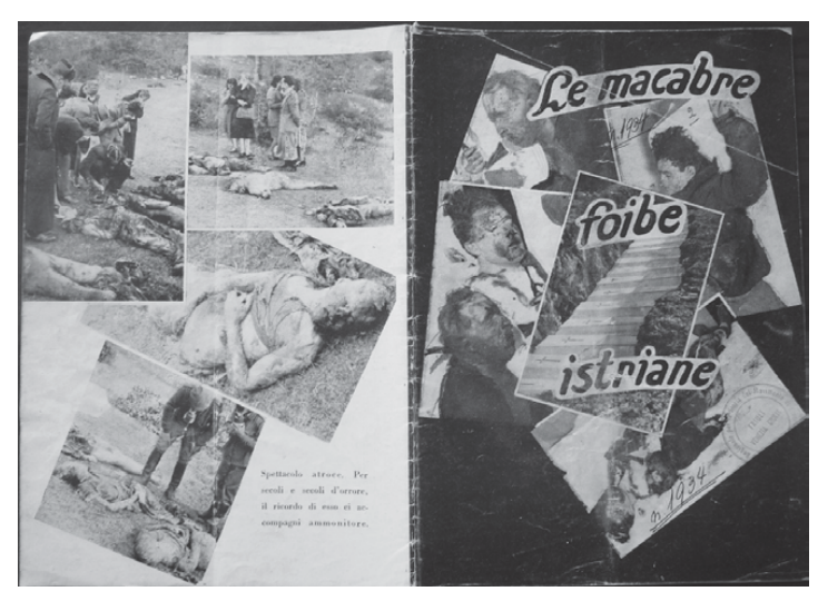
\textbf{Figure 3.2} \ \ \text{Cover of} \ \textit{Le macabre foibe istriane}, \text{a Nazi-Fascist booklet printed} \\ \text{in 1944}

Between the end of January and March 1944, two publications were circulated among the locals by German and Salò authorities, one shortly after the other: Le macabre foibe istriane ('The Macabre Istrian Foibe') and Ecco il conto ('Here's the Bill'). These publications showed some of the corpses extracted from the Julian caves clearly and in detail. The authors of the two sixteen-page booklets cannot be identified, nor is it possible to ascertain their place of publication or their circulation. Considering similar publications of the same era, in the same area, the circulation could have been a few thousand copies. In any case, by analysing the content of the two booklets, we can formulate some hypotheses and we can argue that at least the first one was also addressed to the residents of the Italian Social Republic, as Istria was referred to as 'the other side' of the Adriatic Sea: in other words, it seems that the writer was not from the borderland, but from within the Italian peninsula, in relation to which Istria and the surrounding areas appear as the other side of the Adriatic Sea.24