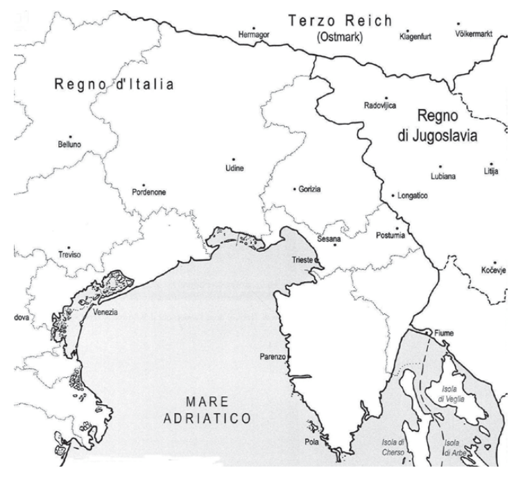
Figure 3.1 Northern Adriatic region, 1939. Italy accessed the Balkan region after the First World War, occupying vast Slovenian areas during the Second World War, before losing most of its territories in the post-war settlement. Istria is the peninsula at the south east of Trieste, west of Fiume (Rijeka in Croatian) (from Cecotti, 2011, reproduced by permission of Franco Cecotti)

the world wars revived the interest in myths in more developed societies. As a totalitarian regime, Fascism employed public myths and rites on a grand scale, producing its own symbolic apparatus with the aim of creating an increasingly broad and firm consensus. Among the myths represented at Redipuglia is the army of the dead, which emerges clearly from its very layout, with the soldiers' graves in front of the generals' tombs. It is a myth with extremely ancient roots, which had clearly emerged in the press and in the literature of the countries at war during the conflict. In the Fascist context, this myth was associated with the 'Harmonious Collective'. Fascist society had to move as one, each person with their specific role; through obedience and trust in the leader and in the regime, new goals and new victories would be reached. In turn, these would lead to achieving further Fascist myths, which were represented in the