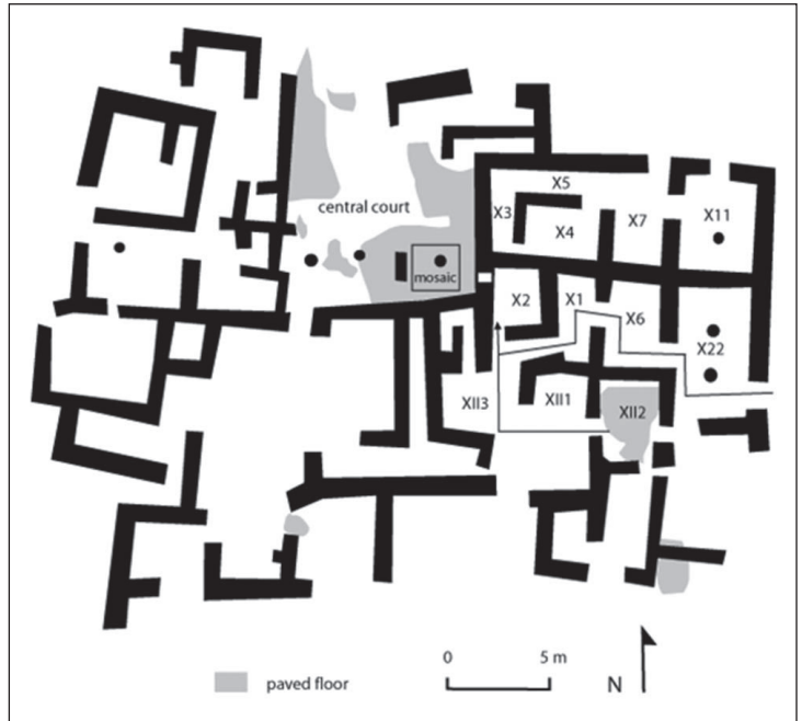
Fig. 4. Plan of Quartier Nu at Malia in LM IIIB (drawing by author).

Another example of such an incorporated communal shrine can be identified in Quartier Nu , a LM IIIA-B residential complex at Malia ( fig. 4 ) 4 . In the small, square Room X2, was found a snake tube next to a slab in the south-east corner, as fallen from it, with nearby a brazier and a stone vase ( fig. 5 ). More to the north were found a conical cup, a miniature vase, a pyxis and a kalathos whereas a second snake tube was standing against the east wall. The main entrance to the complex was from the east where a small porch with pillars gives access to the Main Hall X22 which has a central hearth between two column bases. In this hall too, at least two dozen people could potentially gather. To reach the shrine X2, one had to pass two spaces with industrial functions. It is not clear if Room X2 had a window on the central court in the north part of its west wall. If so, the shrine in X2 may be brought into connection with the pebble mosaic on which a large house model was found. From Room X2, it was also possible to reach the open-air space XII2.