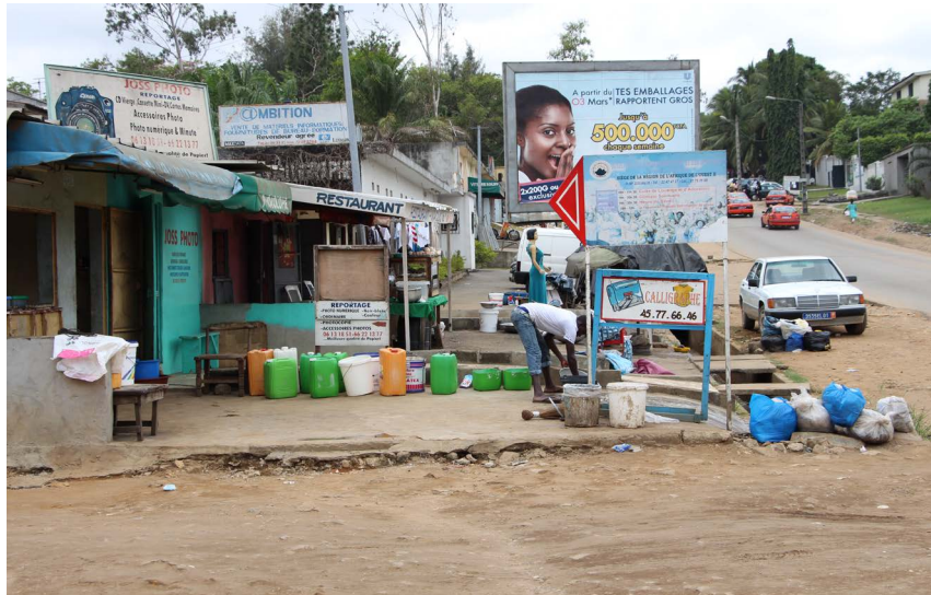
Photograph 6. Anarchy arrangement of posters and panels in the crossroads 9 kilos.