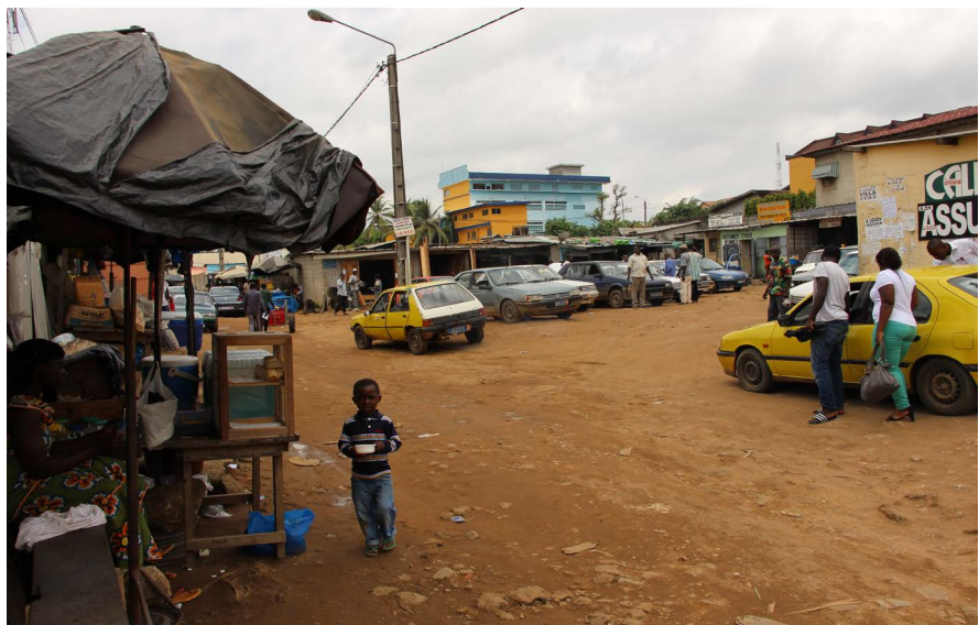
Photograph 1. Watch the entrance of the station of “wôrô-wôrô” of Bonoumin. A cohabitation with the small business of detail.

These housing environments ( Photograph 2(a) and Photograph 2(b) ) are built with salvaged materials (Boards, some plastic and old sheet steels). The