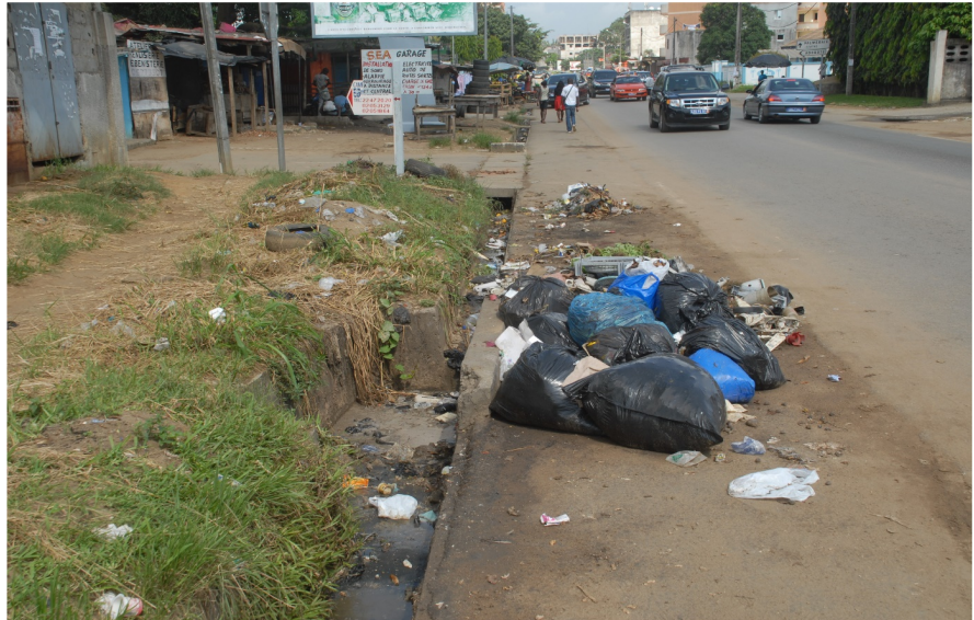
Photograph 4. A gutter blocked, narrow-minded and filled by waste to Bonoumin-Est. In the closeness, the heaps of garbage put down on public roads.

According to neighborhood 28.23% of the investigated, the created flood more