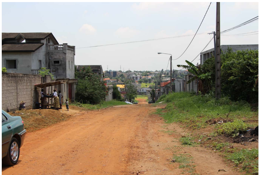
Photograph 3. An unfinished construction the shop window of which is transformed into space of retail trade by the occasional occupants.

As in most of the districts of Abidjan, Riviera-Bonoumin escapes the proliferation of wild deposits garbage. Streets, crossroads and gutters are blocked by plastic waste coming from the small shop and from the household waste ( Photograph 4 ).