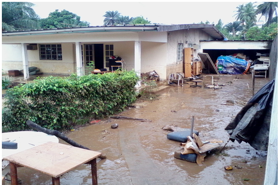
Photograph 5. Flood of a house after a rain in Bonoumin-Est.

These posters stuck confusedly, degrade the landscaped esthetics of the urban space and are source of insalubrity. When comes a bad weather, these posters are removed by the rain or the wind, leaving ungraceful tracks dirty.