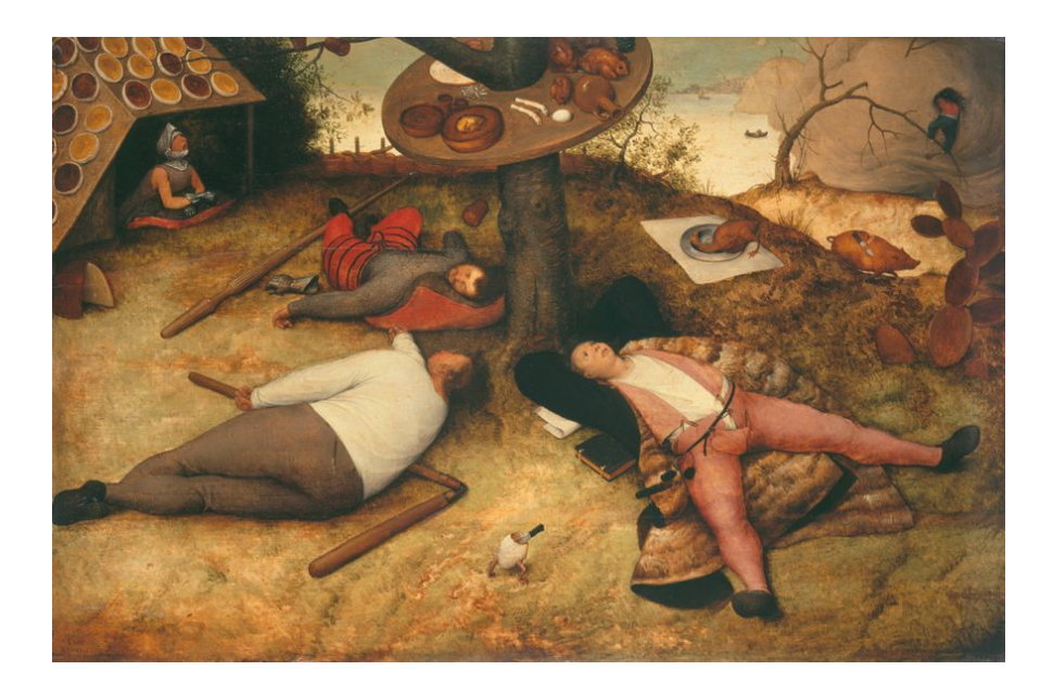
Figure 1: Pieter Bruegel the Elder. The Land of Cockaigne . 1567, oil painting, 52×78cm, Alte Pinakothek, Munich. <sup>13</sup>

[W]e cannot ignore the picture of Falstaff, drawn frequently in the play [1H4], as lying in a horizontal position. Whether being flattened in the Gadshill double-cross, or sleeping in the Boar's Head Tavern, or counterfeiting death at Shrewsbury, Sir John is a literal depiction of fallen man, weighed down by his cowardice and gluttony.<sup>12</sup>