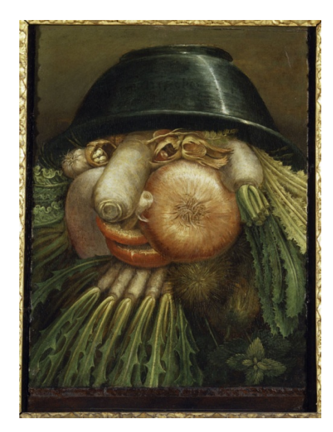
Figure 4: Giuseppe Arcimboldo, L'Ortolano ( The Vegetable Gardener ), 1590, oil on panel, 35.8 × 24.2 cm, Museo Civico "Ala Ponzone", Cremona, Italy.

What Brillat-Savarin and Arcimboldo indicate is that food does encapsulate one's identity: it is part of everyday life and it can reveal much about one's cultural, historical, and social background. Irene López-Rodríguez explains and illustrates this concept in detail: