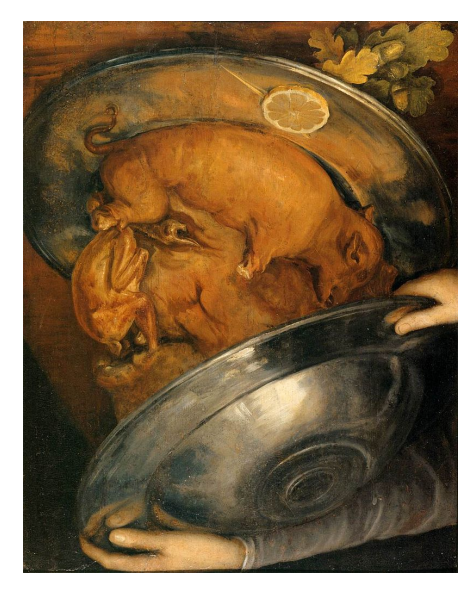
Figure 3: The Cook , 1570, oil on panel, 53 × 41 cm, Nationalmuseum, Stockholm.<sup>24</sup>

In the nineteenth century, Anthelme Brillat-Savarin wrote his now famous aphorism "tell me what you eat and I will tell you what you are," which seems to be what the characters addressing Falstaff also think. Looking at Giuseppe Arcimboldo's painting The Cook (1570), one may consider this piece of art a suitable depiction of Shakespeare's John Falstaff. The Italian artist painted portraits using foodstuffs, depicting for instance a gardener with vegetables and a cook with meat: