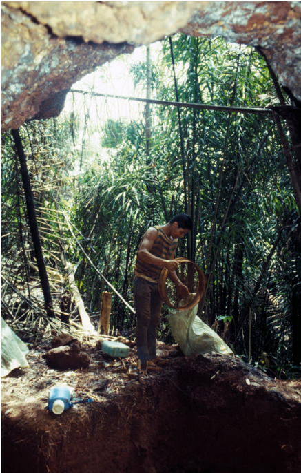
Figure 7 – Excavation in the Abri Marcel rock-shelter in the Bruyère Hill