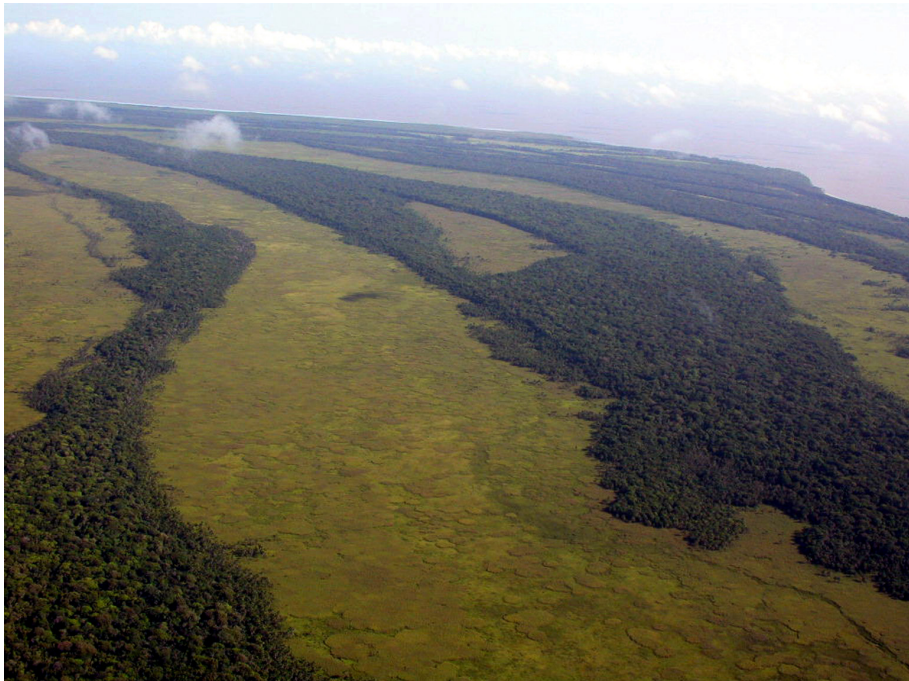
Figure 2 – Flooded coastal plain where elongated sandy ridges run parallel to the sea-shore, eastern Suriname

Groups linked to the Arauquinoid Tradition dominated the Guianas coast west of Cayenne Island during almost one millennium. Although often cited in the archaeological literature, the Arauquinoid Tradition is, in fact,