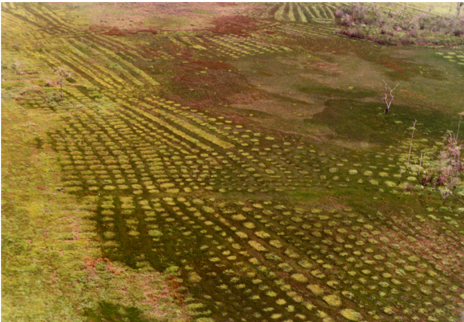
Figure 5—Raised fields in the Karouabo area, central coast of French Guiana