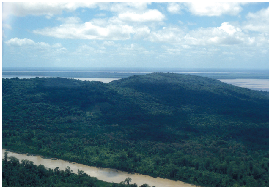
Figure 6 – Bruyère Hill was the center of Aristé confederation. Ouanary River is in the foreground, Oyapock River behind and Uaçá River background

Hill's sites suggests that villages were surrounded by various ceremonial sites. The settlements were located in the middle of the southern slope, in a central position, on the opposite side of the seashore. The rock shelters, slightly above the villages, probably provided covered areas for temporary periods of isolation. Disposal of the dead occurred in caves at the top of the hills facing north. Excavations in the Ouanary Hills shown that the Aristé culture is characterized by two types of habitation sites: villages and rock shelters. The first ones are located on hills or river banks. Small settlements where a few families could live together are distinguished from larger villages where more extensive communities lived together. Small rock shelters, with the average size of 28 m 2 , were temporarily inhabited at different times by different people, while