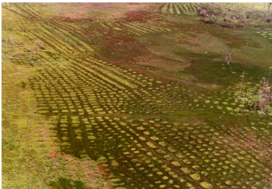
Figure 5—Raised fields in the Karouabo area, central coast of French Guiana