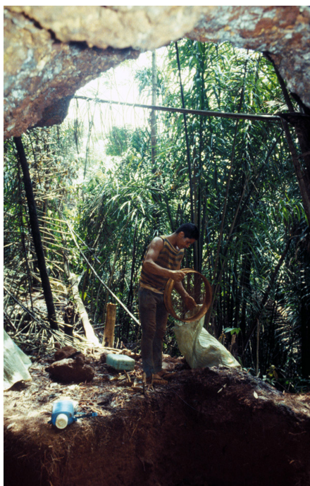
Figure 7 – Excavation in the Abri Marcel rock-shelter in the Bruyère Hill