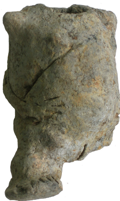
Figure 4 – Pregnant figurine from the Arauquinoid site of Prins Bernhard Polder, western coast of Suriname, collection of Stichting Surinaams Museum, Paramaribo