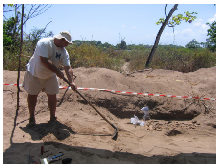
Figure 3 – Excavations at the Bois Diable site, on a sandy ridge west of Kourou, Arauquinoid Tradition (photo S. Rostain, 2008)

Arauquinoid peoples are mainly famous for another activity. They built thousands of raised fields that are an impressive and ingenious agricultural answer to the flooding coastal plain of the Guianas (Figure 5). In the Guianas,