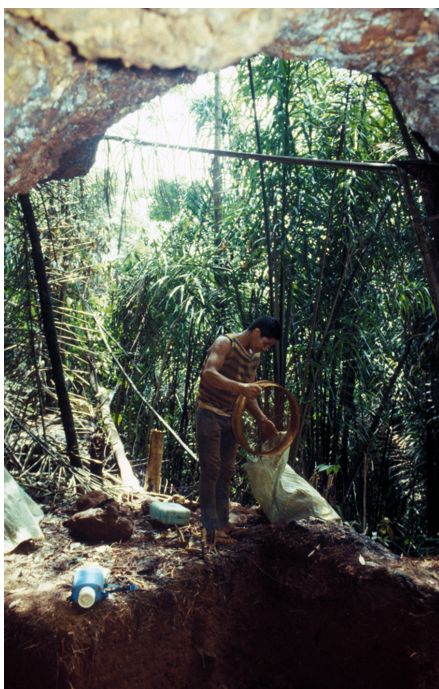
Figure 7 – Excavation in the Abri Marcel rock-shelter in the Bruyère Hill