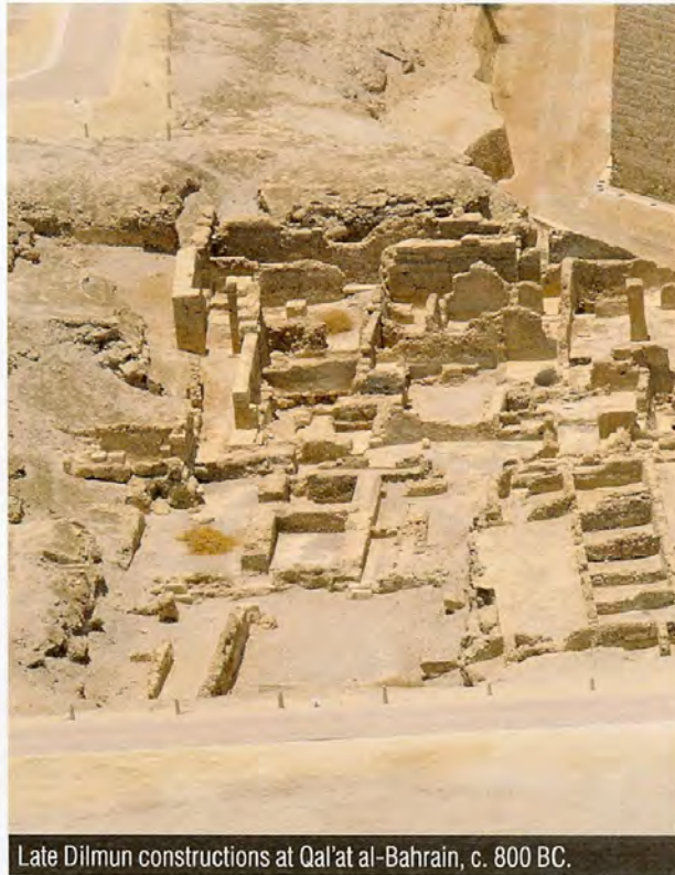
Late Dilmun constructions at Qal'at al-Bahrain, c. 800 BC.

Acting as the hub for economic and cultural exchanges, Qal'at al-Bahrain had a very active commercial and political presence throughout the entire region. The meeting of different cultures that resulted finds expression in the testimony of successive monumental and defensive architecture, including an excavated coastal fortress dating from around the 3rd century AD and the large fortress on the tell itself dating from the 15th-16th centuries, which gives the site its name as Qal'at al-Bahrain. Likewise, the wonderfully preserved urban fabric of the former capital and the outstandingly significant and diverse finds demonstrate a mélange of languages, cultures and beliefs. For example, a madbasa (an architectural device used to produce date syrup) within the tell is one of the oldest in the world and reflects a link to the surrounding