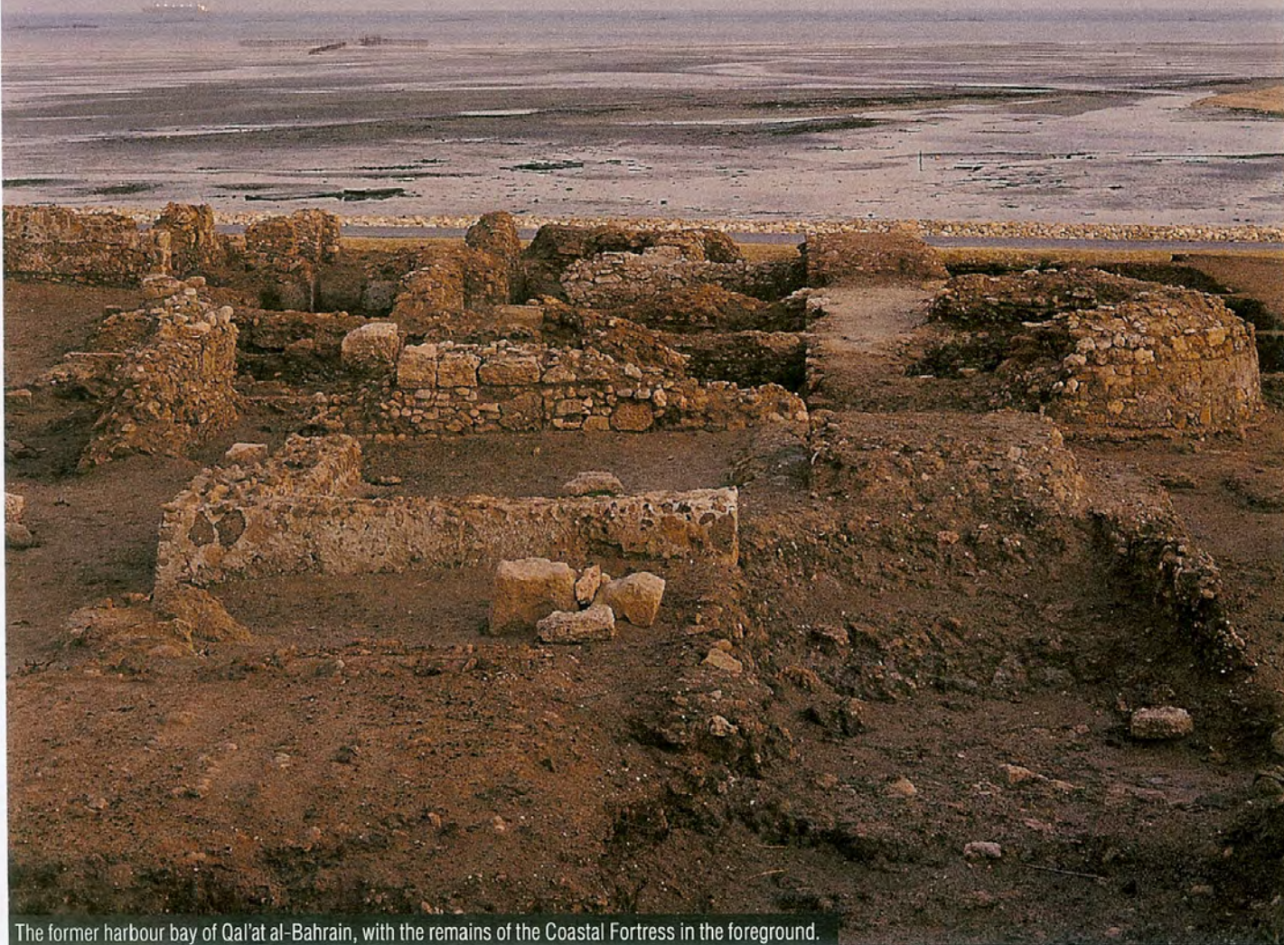
The former harbour bay of Qal'at al-Bahrain, with the remains of the Coastal Fortress in the foreground.