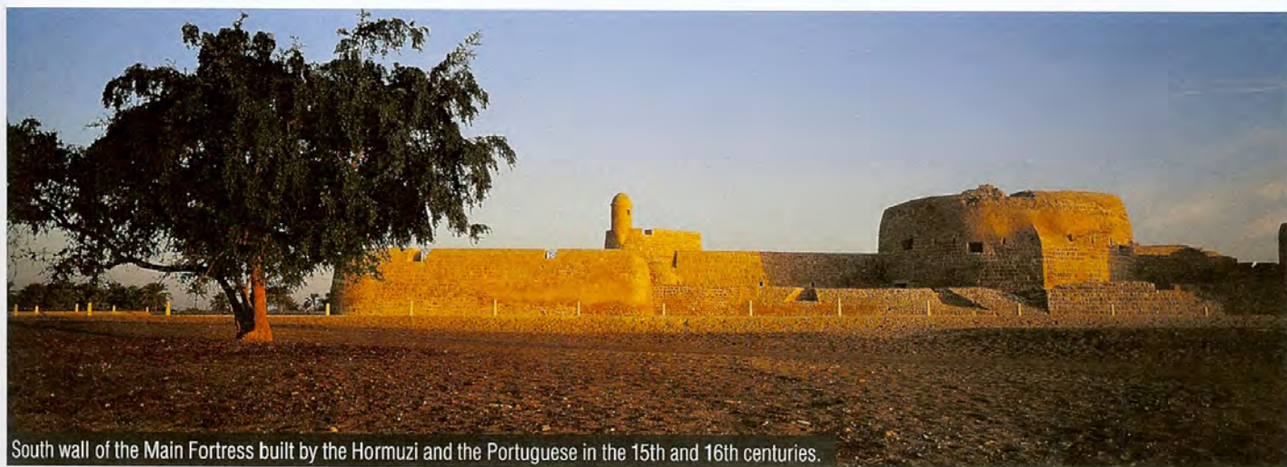
South wall of the Main Fortress built by the Hormuzi and the Portuguese in the 15th and 16th centuries.