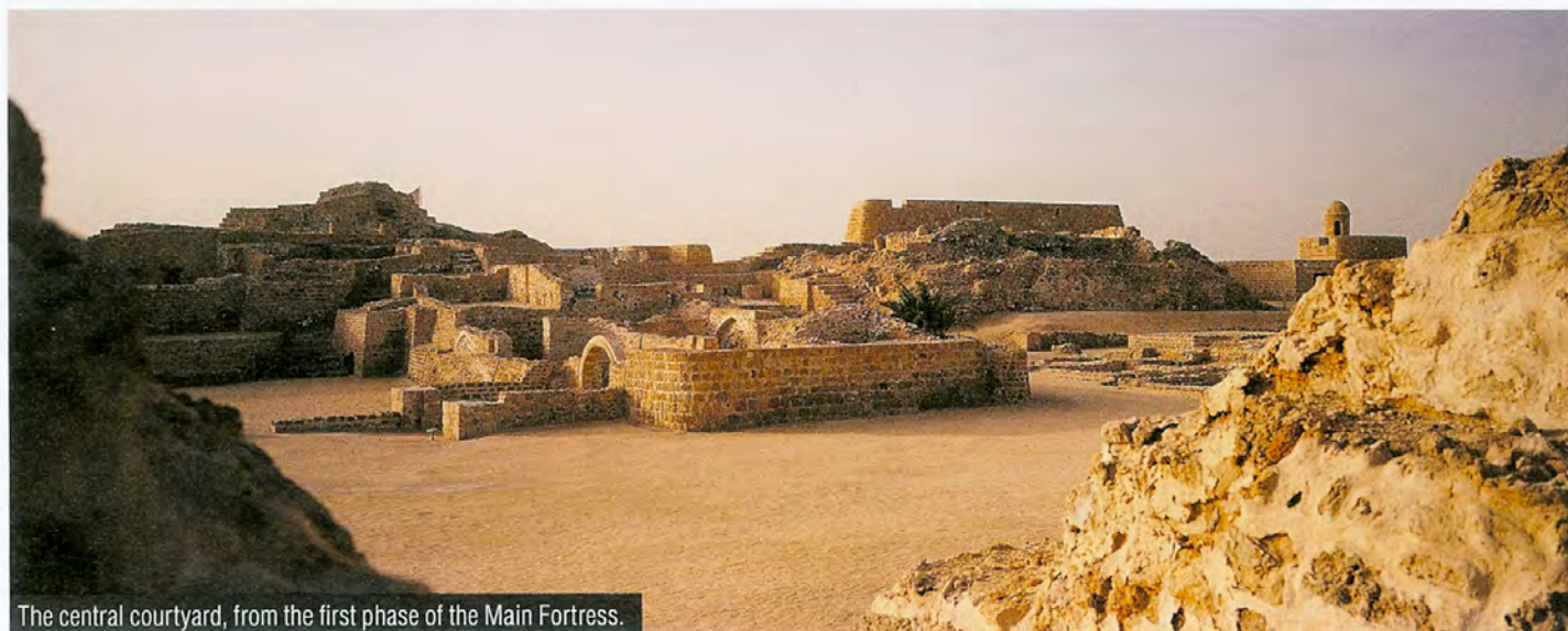
The central courtyard, from the first phase of the Main Fortress.