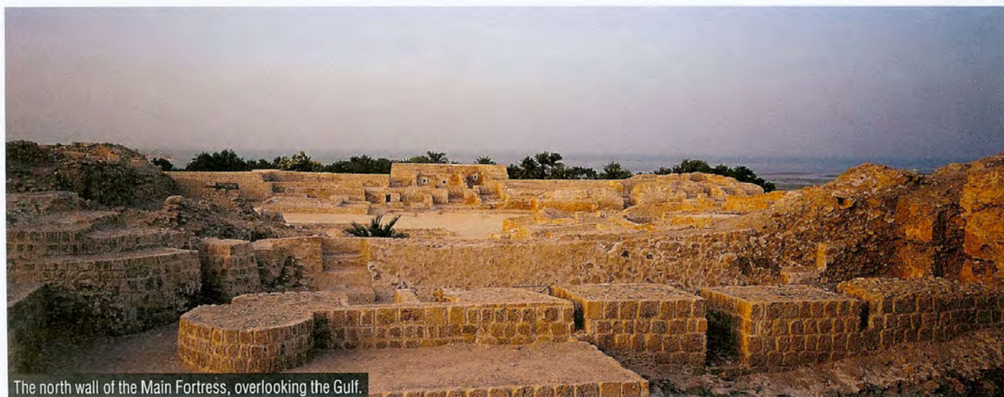
The north wall of the Main Fortress, overlooking the Gulf.

civilization, was the centre of commercial activities linking the traditional agriculture of the land, represented by the traditional palm groves and gardens that date back to antiquity and still exist around the site, with maritime trade between such diverse areas as the Indus Valley and Mesopotamia in the early period (from the 3rd millennium to the 1st millennium BC) and China and the Mediterranean in the later period (from the 3rd to the 16th century AD).