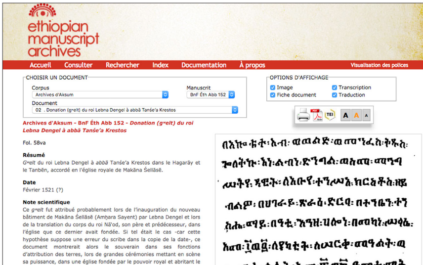
Fig. 3. View of the reproduction, the summary, and the scientific note accompanying a land charter (as appearing on the EMA portal).