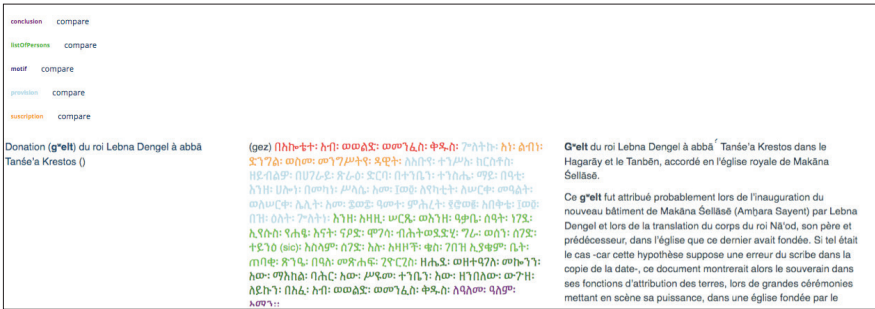
Fig. 2. View of a charter with transcription, translation, and commentary, the formulaic elements are highlighted (as appearing on <http://betamasasheft.eu> portal).

architecture chosen for the XML files in the EMA project respects the materiality of the documentation and allows the authors to create their own scientific collections. TEI deals with each level of the project, which are: text, manuscript, and corpus.