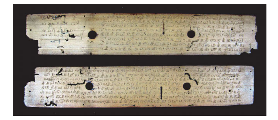
Fig. 8: Folios 1v and 2r of a manuscript copy of a mid-nineteenth-century printed edition of the Tirumurukā<u>rr</u>uppaţai , Tamil Nadu, nineteenth or twentieth century. Annamalai University Library (cat. no. 97; Acc. no. 340049 [old] and 860 [new]). Approximately 19 × 3,5 cm.