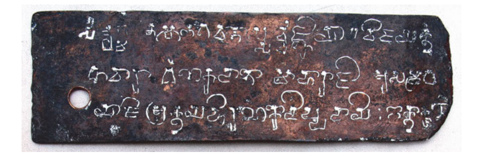
Fig. 1: Pātagaņdigūdem plates, verso of plate 1, undivided Andhra Pradesh, South India, third century. Telangana State Museum, Hyderabad. Approximately 22,5 × 7 cm.

very common practice in ancient India: the engraving of royal grant orders on copper plates, which are given to the recipients as title-deeds. Such copper-plate grants have been produced in India by the hundreds, as evinced by the extant specimens, and probably by the thousands, from the third century CE onwards.<sup>4</sup> The two volumes of Dynastic List of Copper Plate Inscriptions Noticed in Annual Reports on In dian Epigraphy published by the Archaeological Survey of India comprise respectively 1637 and 413 items, i.e. a little more than 2,000, a total which however includes records, other than grants, also inscribed on copper plates.<sup>5</sup>