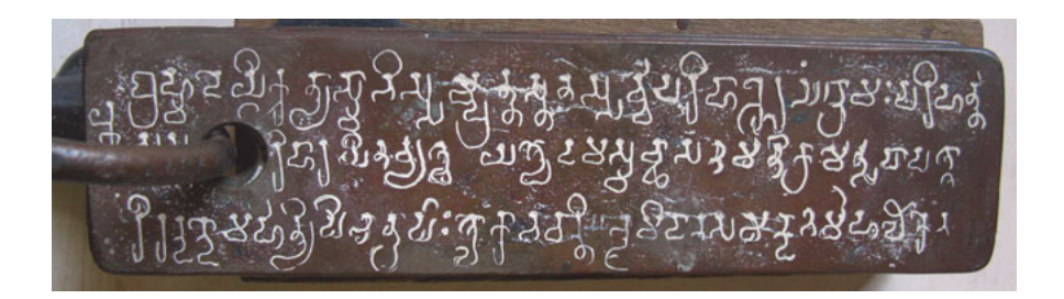
Fig. 4: Pīkira grant (IR 16), verso of plate 4, undivided Andhra Pradesh, South India, middle of fifth century. Chennai Government Museum. Approximately 18 × 4,5 cm. Photo: Emmanuel Francis.

Fig. 3: Hīrahaḍagaḷḷi plates (IR 3), verso of plate 2, found in Karnataka, South India, middle of fourth century. Chennai Government Museum. Approximately 20,5 × 9,5 cm. Photo: Emmanuel Francis.