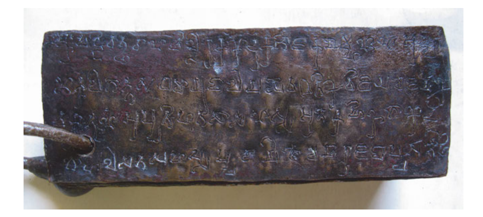
Fig. 3: Hīrahaḍagaḷḷi plates (IR 3), verso of plate 2, found in Karnataka, South India, middle of fourth century. Chennai Government Museum. Approximately 20,5 × 9,5 cm.