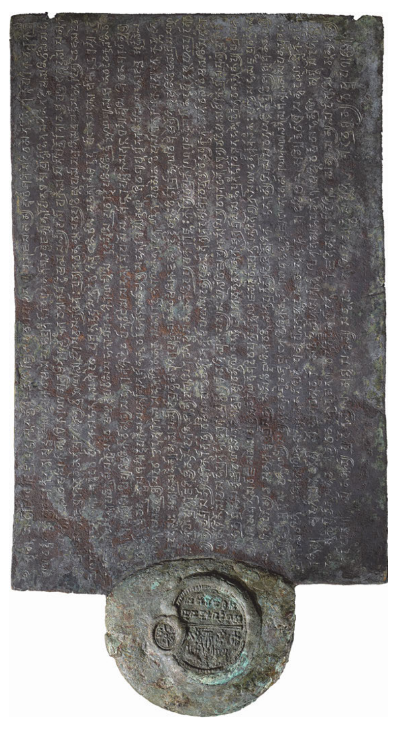
Fig. 5: Pradyumnabandhu plate, recto, probably from Bangladesh, c.550–650. Private collection. Approximately 37 × 24 cm.