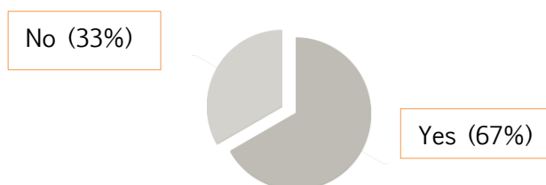
Figure 3. Students’ assessment of teachers’ point of view (N = 18).

The impact of a few teachers’ negative views is thus clearly perceptible in students’ assessments, and the above proportions show that 33% of students had heard their teacher(s) utter negative remarks. These views need to be taken into account, especially since they are by and large based on genuine concern for the quality of the training students receive. Some teachers were indeed concerned that use of MT might affect terminological or document research competence. Further investigations are indeed needed to make sure that MT does not interfere with any other fundamental competences in translator training.