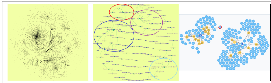
Fig. 2. Whole graph, organizational accounts graph and two communities