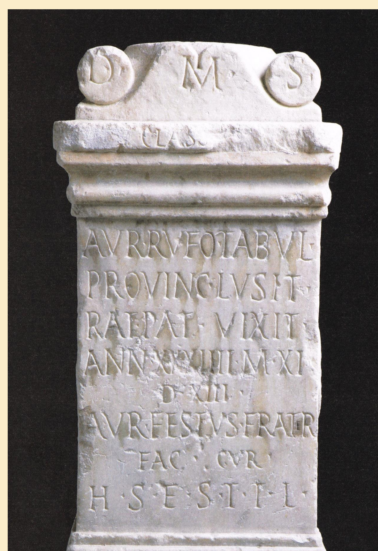
Ara of Aurelius Rufus, tabularius provinciae Lusitaniae rationis patrimonii (ERAEmerita, 116)