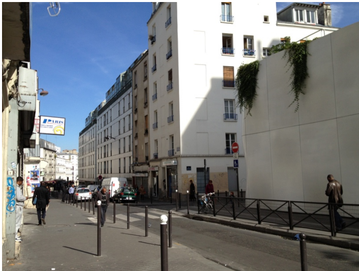
Social housing in the African neighbourhood, la Goutte d'Or, Paris.

There is another point of tension in the two metropolitan areas: the State remains a central actor in housing. It produces laws and allocates funding to local authorities (notably housing benefits) and we can also assume that the austerity measures contribute greatly to the rise of urban inequalities. Moreover, the State intervenes directly on planning, through urban renewal programmes for example, which can create tensions and conflicts between institutional levels.