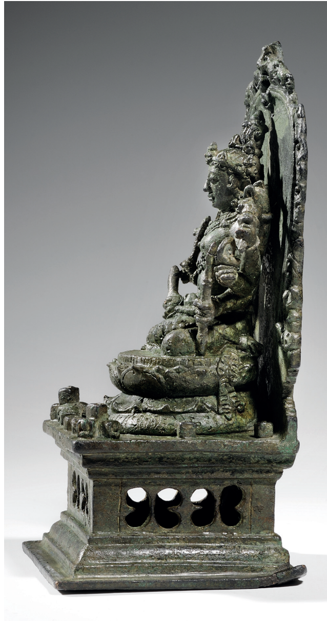
Figure 4. Lateral view of the preceding. Photo: Jürgen Liepe, 2011.