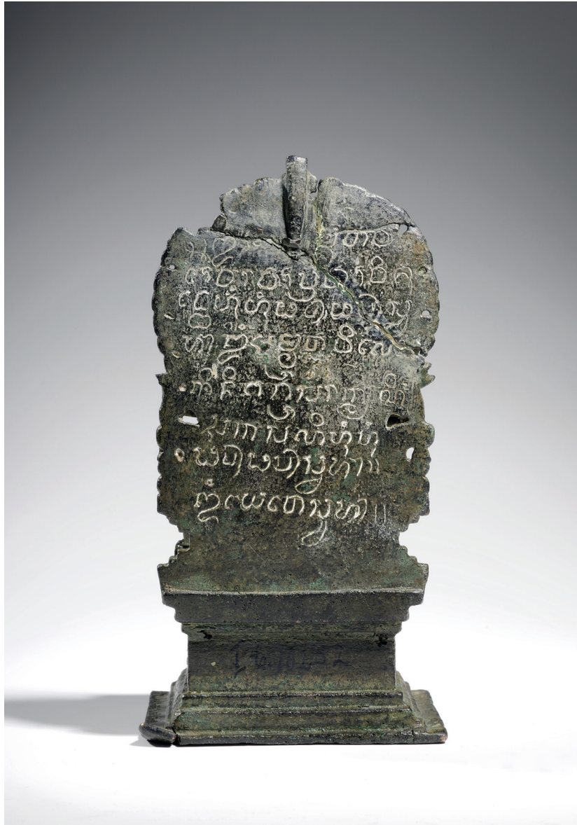
Figure 2. Inscription on the back of the preceding.