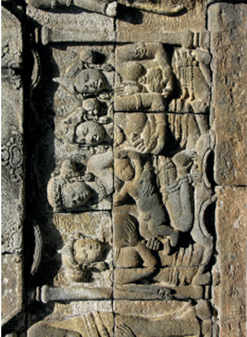
Figure 8. Borobudur, relief (II B 21) showing a woman who has just delivered. Photo: Marijke J. Klokke, 2009.