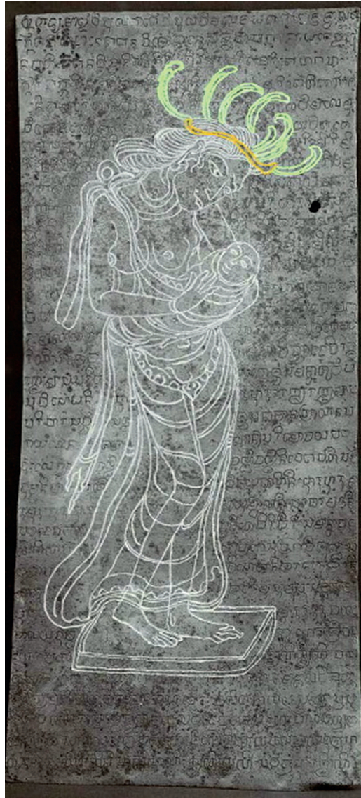
Figure 6. The Leiden copperplate, with a line drawing of the female figure. Photo: OD 2195 (see OV 1915: 73). Courtesy Kern Institute and University Library, Leiden. Extra coloring of the headdress by Sjoerd Didden.