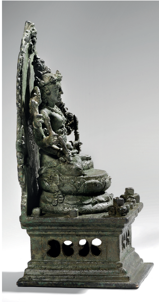
Figure 3. Lateral view of the preceding.