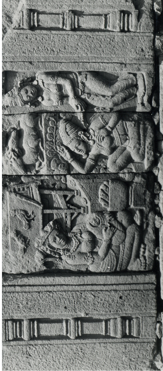
Figure 7. Relief showing Sītā with Lava, Brahmā temple, Loro Jonggrang complex, Prambanan.