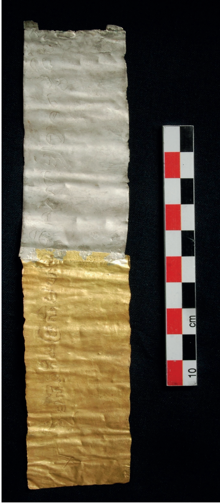
Figure 9. Gold plaque from Candi Gedong I (Muara Jambi), Sumatra, ca. 12 th –13 th century.