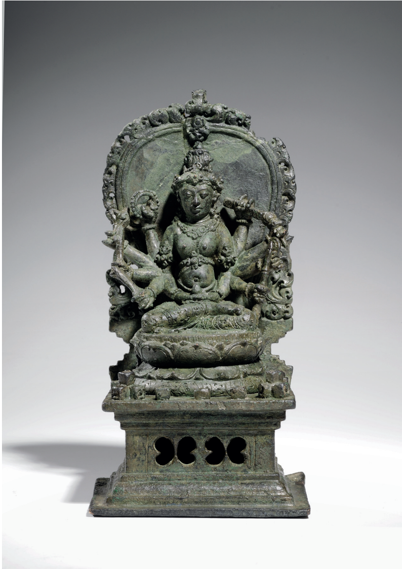
Figure 1. Ten-armed Mahāpratisarā, Java ca. 9th–10th century. Berlin, Museum für Asiatische Kunst II 196.