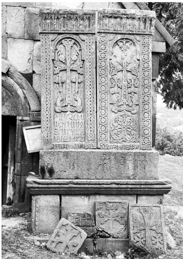
Fig 1. Mak'ravank' Monastery (Armenia, 13 th c.). Two khachkars of 1259.

The type of relatively large stone plates with a cross – tree of life sculpted on them, called in Armenian "khachkar" (from "khach" = cross, and "k'ar" = stone), is a well-known form of Armenian art, emblematic for this country 1 . These monumental rectangular stelas stand isolated or in groups, often, but not always, in cemeteries. They are oriented like churches, so that one looks eastward when standing in front of their western, sculpted face (fig. 1).