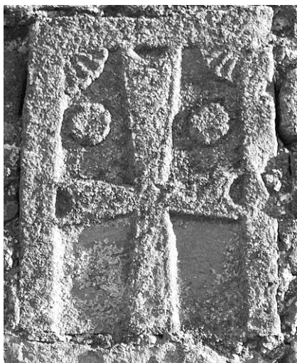
Fig. 9. Sudak. Khachkar on Battista Zoagli gates.

A) One of them, very close to those previously described, is on the Battista Zoagli gates of 1389 (fig. 9). Its cross is of the type with barely flared arms, whose tips are concave, and the outline is underlined by an incision. In the upper corners are housed two "portions of fan" with four furrows. Two rosette macaroons are placed on either side of the upper arm. Framed on three sides by a flat strip, this plate has lost its lower edge, probably cut when reinserted.