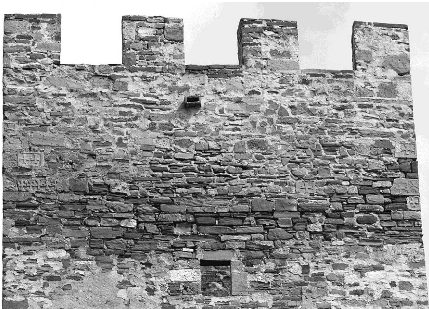
Fig. 5. Sudak (Crimea). Federico Astaguera tower. South facade.