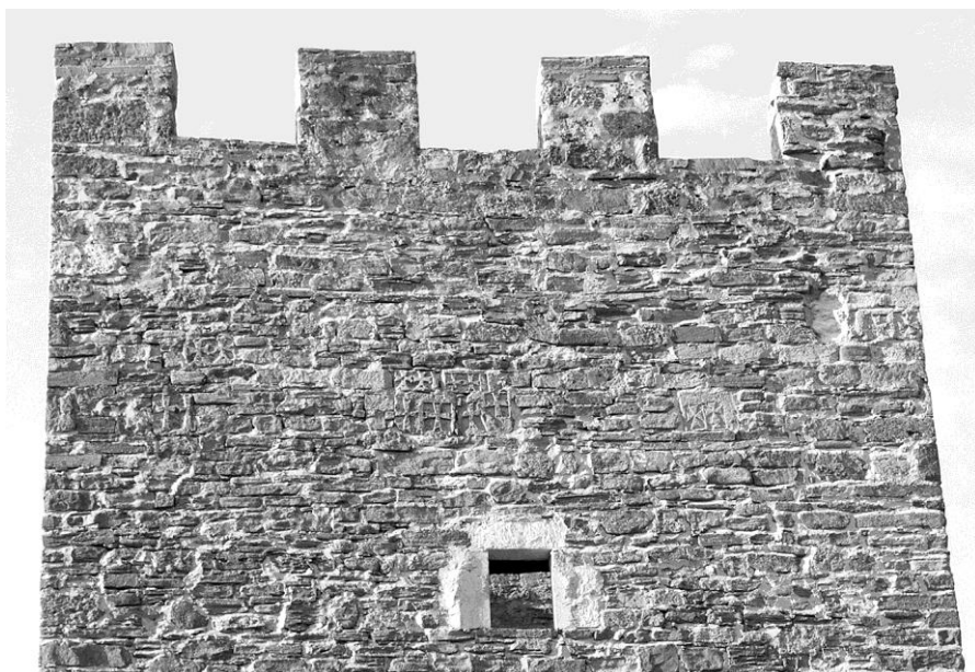
Fig. 6. Sudak. Federico Astaguera tower. North facade.

The crosses are of the "Latin" shape, i. e. slightly higher than wide. Most of them have slightly flared arms. They are almost deprived of ornaments (fig. 7-8). There are four types of crosses: