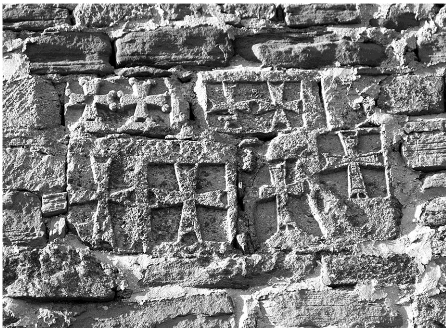
Fig. 8. Sudak. Federico Astaguera tower. North facade. Detail.

These modest, rough blocks have been reused: they are obviously not in their original location. Vadim Maïko and Aleksandr Dzhanov believe that they come from a former Armenian church 13 . They were inserted into the apparatus of the tower walls in an erratic, disorderly manner, and several seem to be reversed (top to bottom). On the same plate, inside one frame (often eroded), there is either a single cross, or two, three, four or five crosses aligned, side by side. On certain blocks with two crosses, these are shifted with respect to each other, as if the artisan had wanted to “merge” two different plates on a single block (fig. 8). There are also corner blocks which have a cross sculpted on each of the two visible faces 14 , which further complicates their interpretation and increases the mystery of their function. Others have been partly covered with cement. On a stone of the south façade with