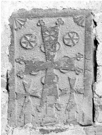
Fig. 11. Sudak. Khachkar on Barnaba di Franchi di Pagano tower. Photo A. Emanov (1998).

wall of Barnaba di Franchi di Pagano's tower (tower № 14), built in 1414. Placed on the upper edge of the stone, the inscription remained unnoticed until now, and unfortunately has almost totally disappeared during the last twenty years (fig. 11). Photographs taken at the end of last century reveal the presence of an Armenian inscription on the entire upper band of the stone, but they are not clear enough to enable a complete reading (fig. 12). They just let us guess, on the right half of the strip, the words ՀԱՅ[ՈՅ (?)] ԹՎԱԿԱՆԻ[Ն (?)] (= in the year [...] of the Armenian era). More recent photos (from the beginning of our century) show that the inscribed row is almost entirely erased (fig. 13). They allow us to read only some Armenian letters on the right end of the strip, belonging probably to the word ԹՎԱԿԱՆ.