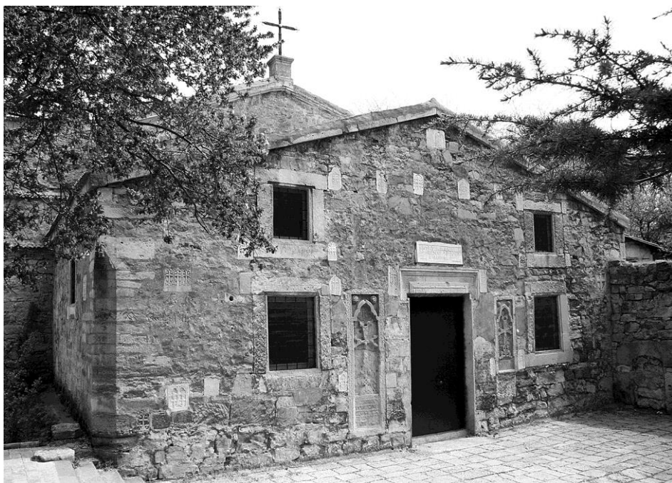
Fig. 4. Caffa (Crimea). Sb. Sargis / St. Sergius church. Western facade of the narthex.

The important colony which the Armenians established from the end of the 13 th c. onwards on the south shore of Crimea has left a rich artistic heritage which includes, as mentioned above, a relatively high number of cross plates, or cross-stones 6 . Only in Caffa / Theodosia, the Genoese administrative center of the peninsula in the 14 th -15 th c. , there were more than a hundred of them (fig. 4) 7 . But they are also found in other localities of the peninsula.