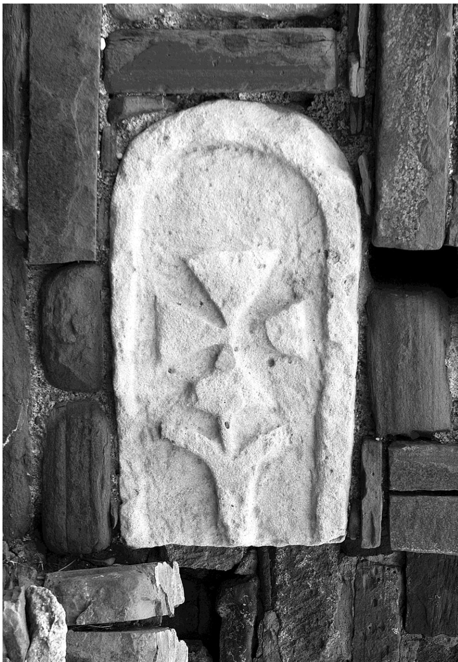
Fig. 16. Sudak. Ruins of "Virgin Mary" church. Detail with a fragment of stela.

Moreover, the still visible pieces and fragments of the Caffa tall khachkars date back to the modern period: such stelae were still created in Crimea in the 18 th c. Their clumsy echo could be born from the hands of a very modest craftsman living in what remained of Soldaïa.