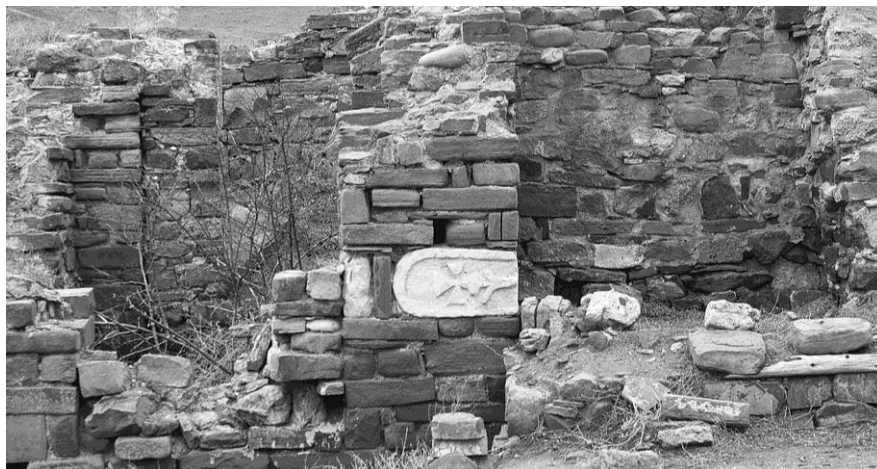
Fig. 15. Sudak. Ruins of "Virgin Mary" church. Fragment of stela.

Despite its almost primitive simplicity, the morphology (its rounded top) and proportions of the present stela, and its decoration with a vegetable cross suggest that it could be a very modest khachkar, initially erected. The dating is very difficult, but the rudeness of the treatment might suggest a late period, its "rustic" carving being not very far from that of the plates on the Federico Astaguera tower.