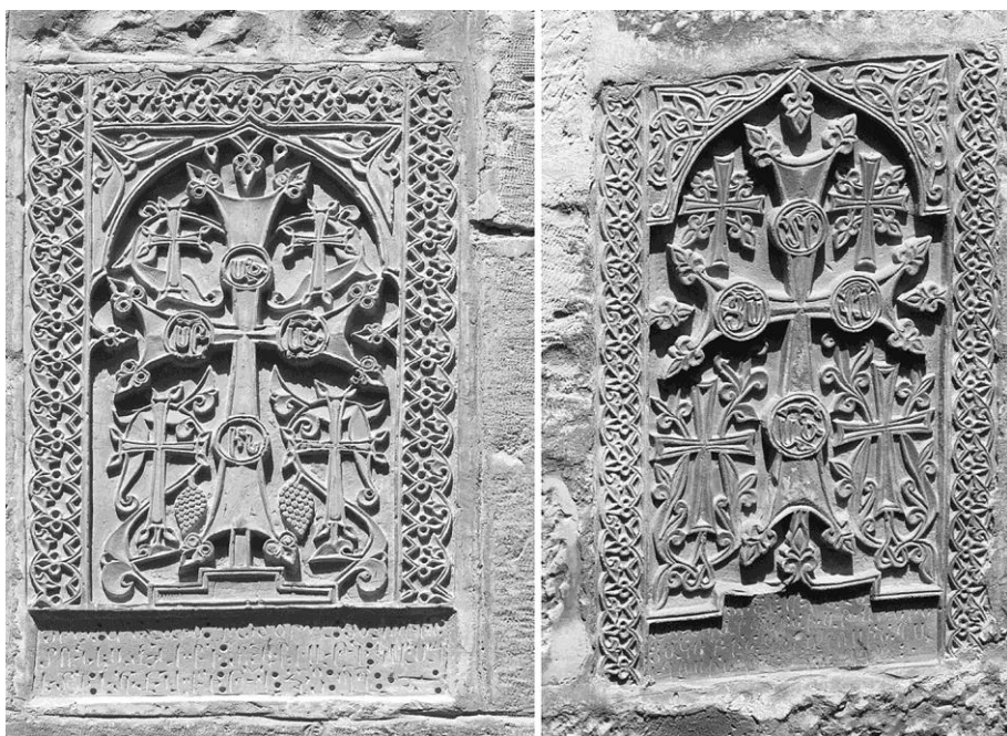
Fig. 3. Jerusalem, Armenian Patriarchate. Courtyard of St. James cathedral. Two small khachkars of 1441 and 1442.

"minor" one already identified in Armenia, but with some peculiarities: these are again small plates, which do not stand isolated, oriented towards the east, as they are mounted in the surface of walls and thus are deprived of proper orientation. But they are no longer in tufa, but often in marble, and sometimes in other, local, stones; they are usually thin, and their decoration, which presents mainly the same kind of cross – tree of life, often surrounded with vegetal and geometric ornament, is treated in a markedly simplified way.