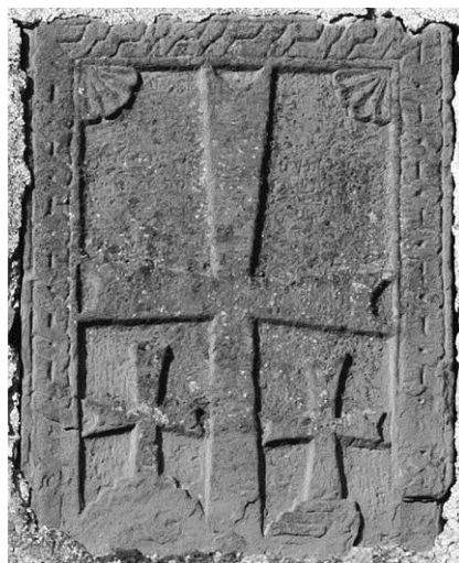
Fig. 10. Sudak. Khachkar on Pasquale Giudice tower.