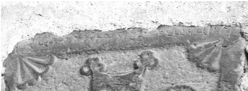
Fig. 12. Sudak. Khachkar on Barnaba di Franchi di Pagano tower. Detail.

The cross has moderately flared arms with concave ends, the tips of which bear three balls. These are the "buds" in the form of a triple