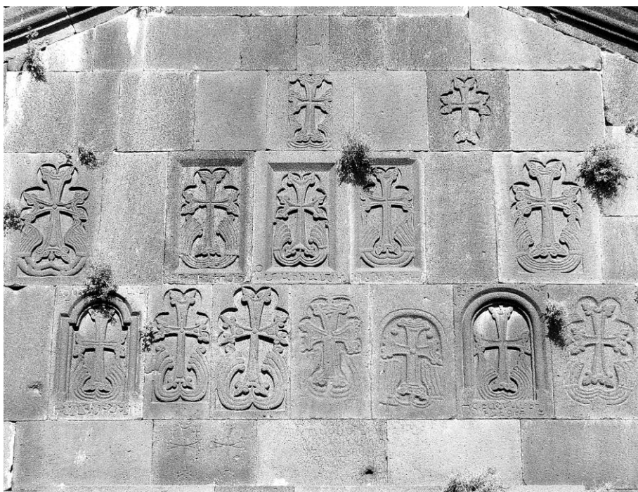
Fig. 2. Tegher Monastery (Armenia, 13th c.). Western facade of the narthex.