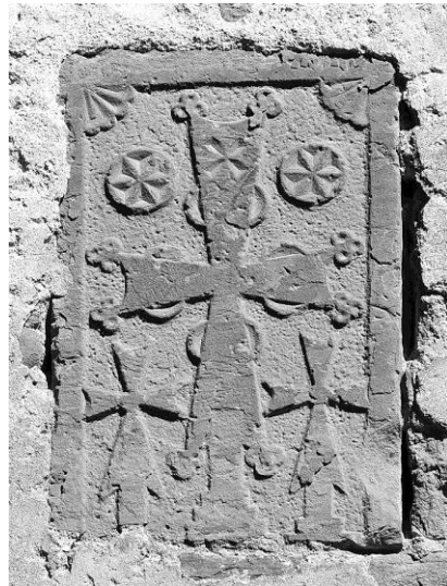
Fig. 13. Sudak. Khachkar on Barnaba di Franchi di Pagano tower. Photo A. Dzhanov (2010).