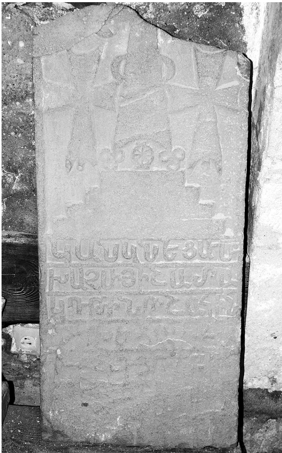
Fig. 14. Sudak. Khachkar previously on tower n° 16, now in the Fortress Museum.