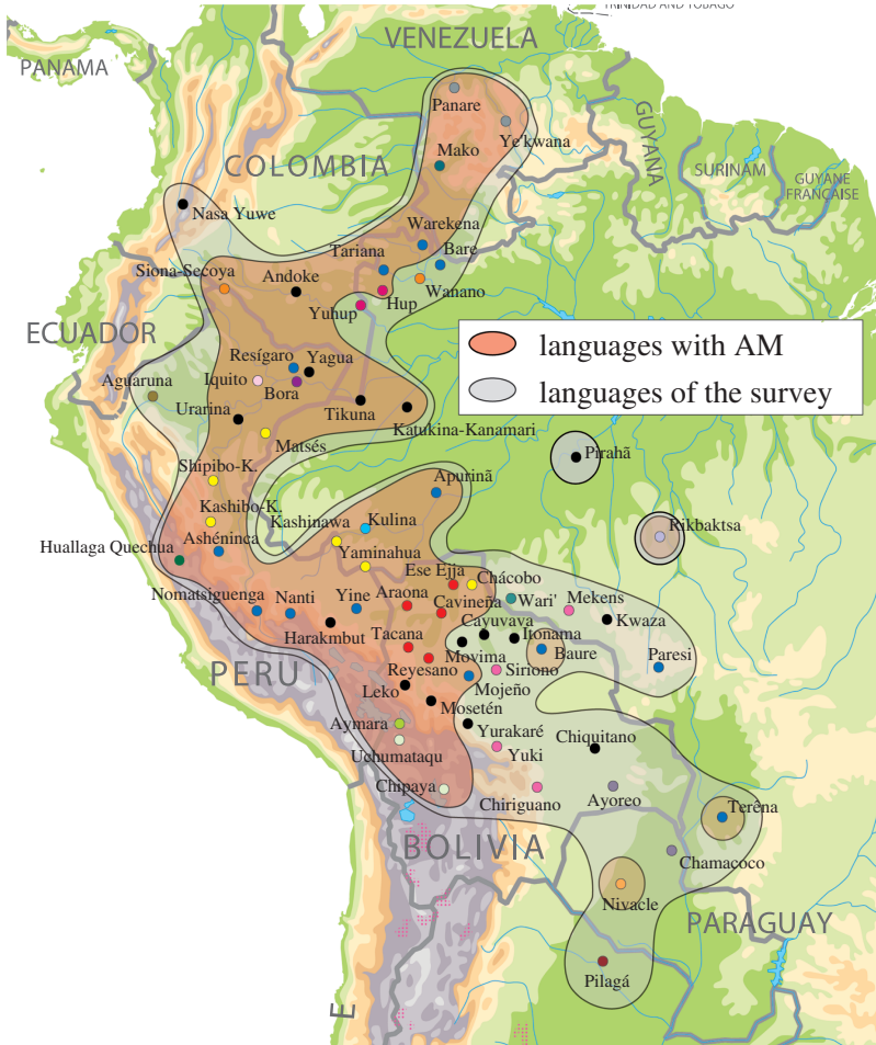
Map 2: Geographical distribution of the languages with AM markers.

according to the two parameters of moving entity and temporal relation. The results are provided in Table 6. In each column, the number of attested forms is provided for each language. The last column provides the total number of AM forms. Under each column, I provide the total number of languages which have at least one form per parameter. The results are summarized and commented on in the next subsections.