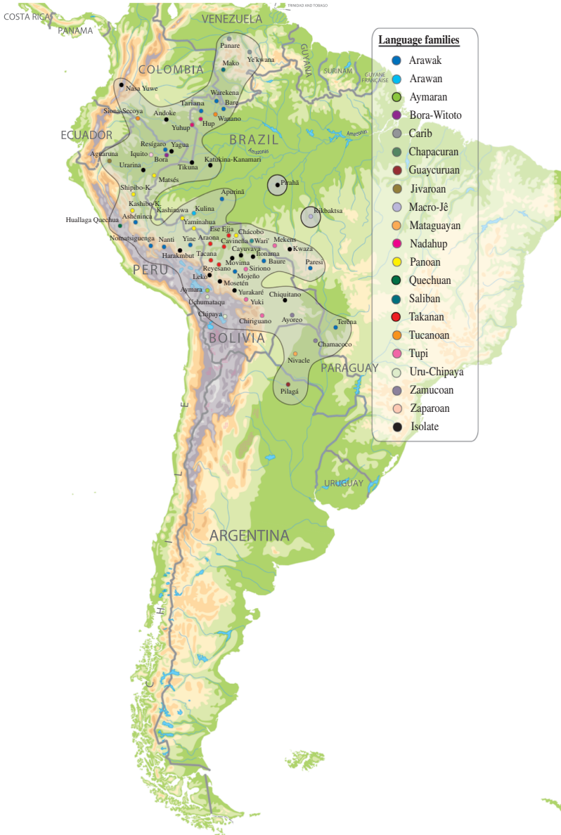
Map 1: Geographical distribution of the languages of the survey.