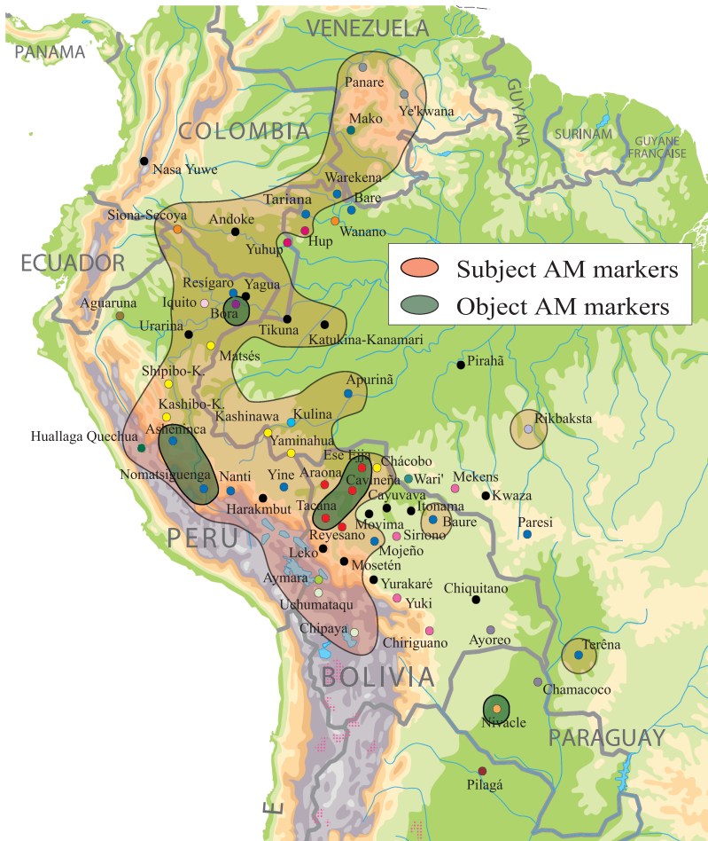
Map 4: Geographical distribution of languages with subject and object AM markers.

The geographical distribution of languages with subject and object AM forms is represented in Map 4. The location of languages with subject AM simply matches that of the languages with AM systems, with the exception of one