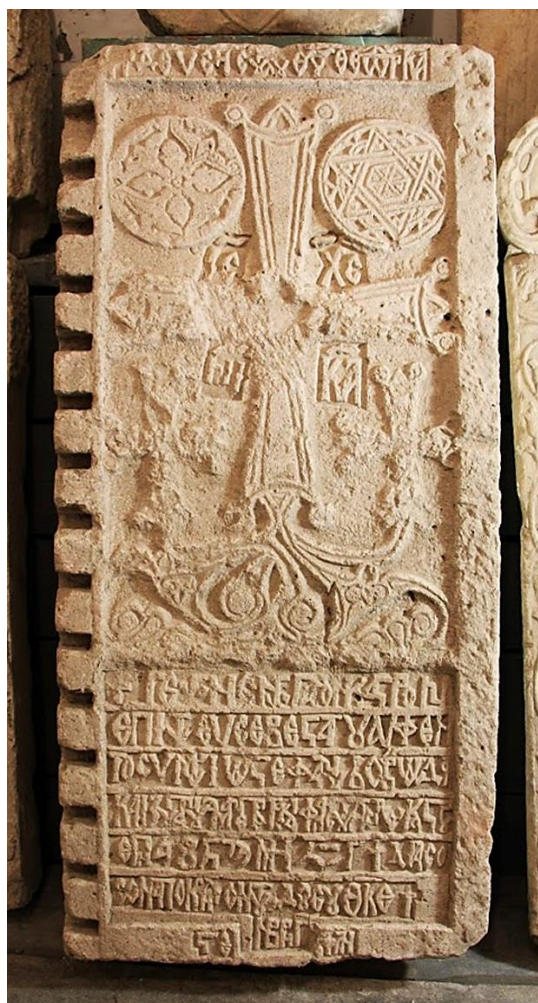
Fig. 38. Kherson Regional Museum. Stela from Akkerman (Belgorod-Dnestrovkii), erected in, or before 1440 (110 x 51 x 20 cm).