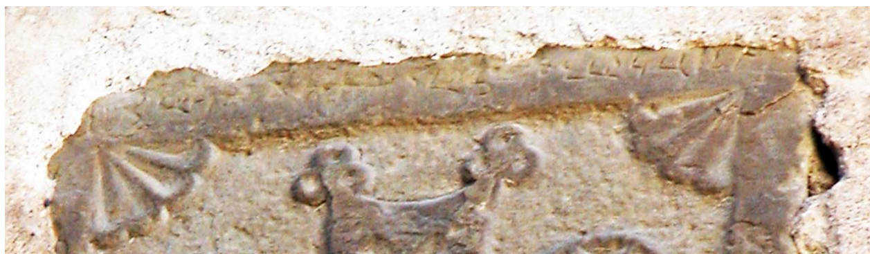
Fig. 21a. Sudak. Tower of Franchi di Pagano (1414). Photo A. Emanov (c. 1990).