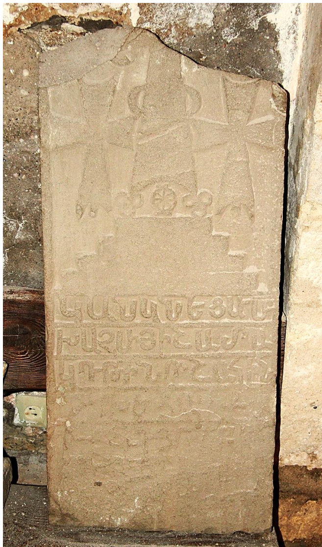
Fig. 20. Sudak. Museum of the fortress. Stela from the tower n° 16.