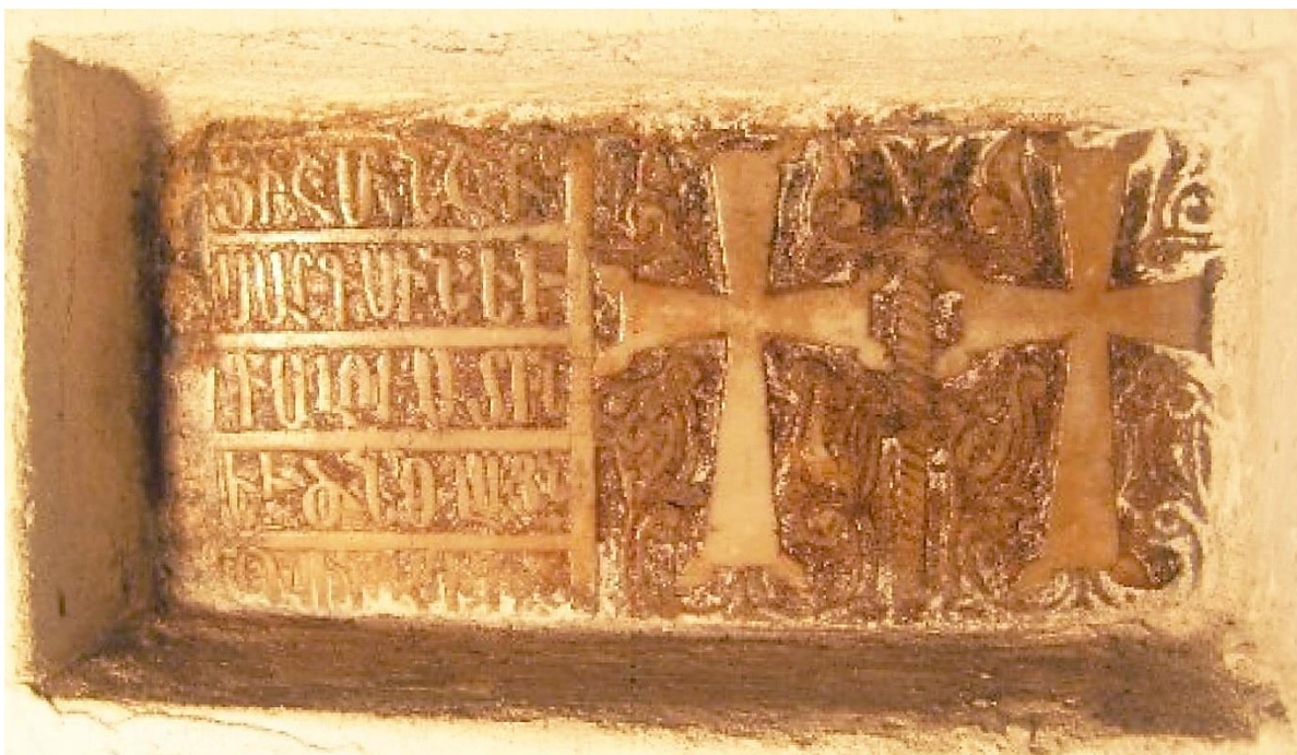
Fig. 37. Akkerman (Belgorod-Dnestrovkii). St. Auxentius. Interior. Plate of 1474 with two crosses. (Marble, 29,5 x 16 cm).