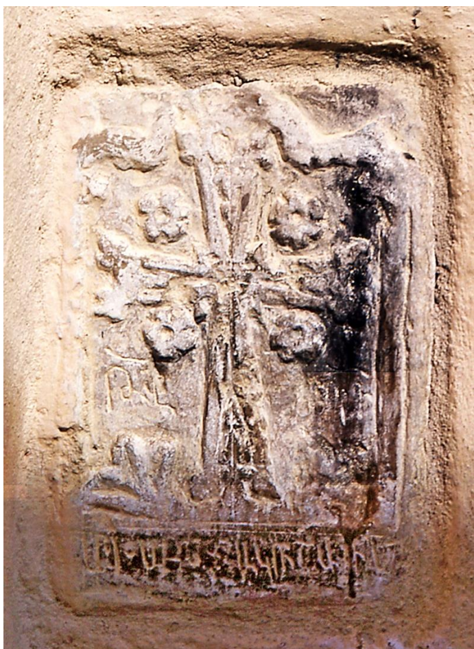
Fig. 34. Kamenets-Podolskii. Chapel of the Annunciation. Plate of 1554 (27 x 19 cm).