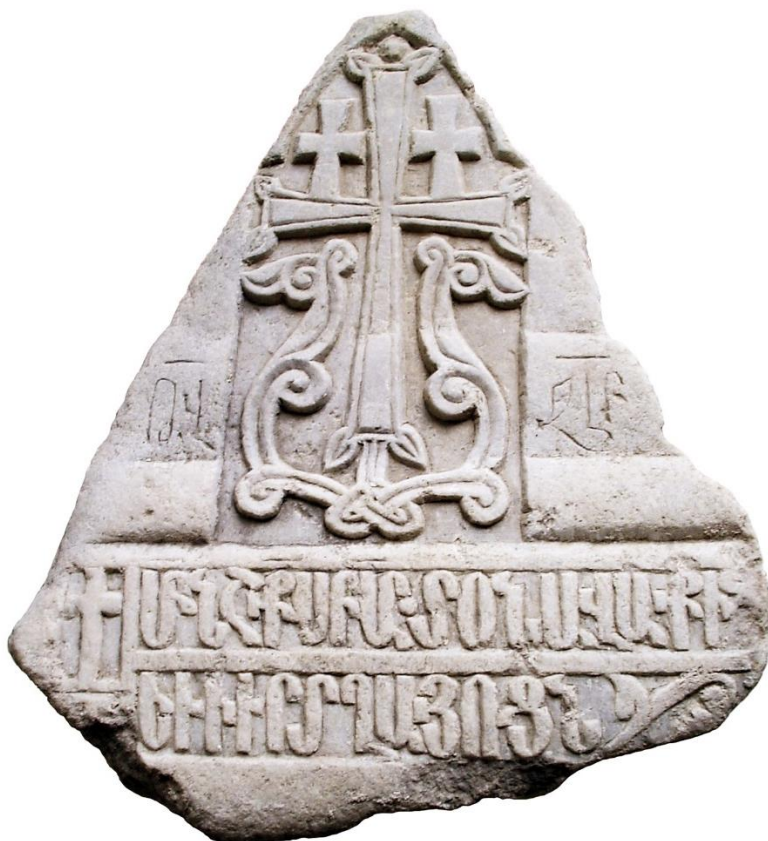
Fig. 13. Sala (Grushovka, Crimea). Plate of 1483 in the school museum. (Marble, 34 x 28,5 x 8 cm).