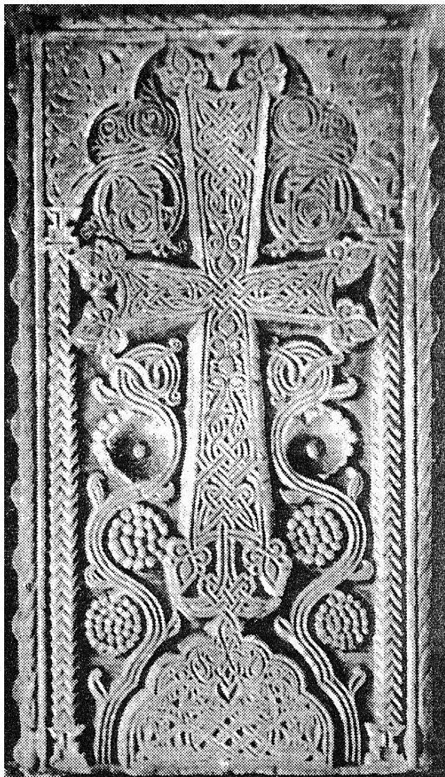
Fig. 3. Caffa. Theodossia Museum. Khachkar (95 x 56 x 24 cm).