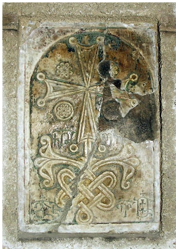
Fig. 26. Lviv. Cathedral. Interior. South-west pillar, north face. Plate of 1441/1449 (20 x 13 cm).