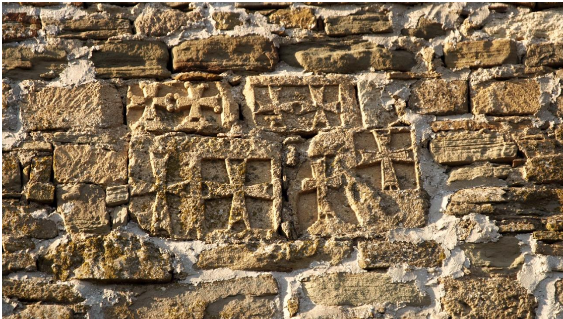
Fig. 19. Sudak. Tower of Federico Astaguera. North façade.