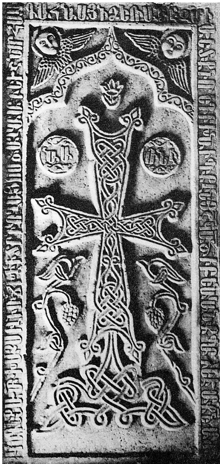
Fig. 5. Caffa. St. Sergius. Interior of the narthex. Plate of 1698, in memory of the miniature painter Nikołos Całkarar (120 x 59 cm). (CIA VII, P. 338, fig. 14).