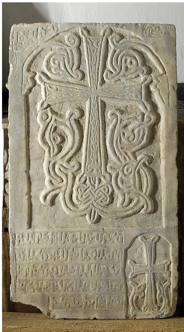
Fig. 9. Kherson Regional Museum. Plate of 1557 (or perhaps 1637) from Caffa (?). (Marble, 52,5 x 30 x 7,5 cm).