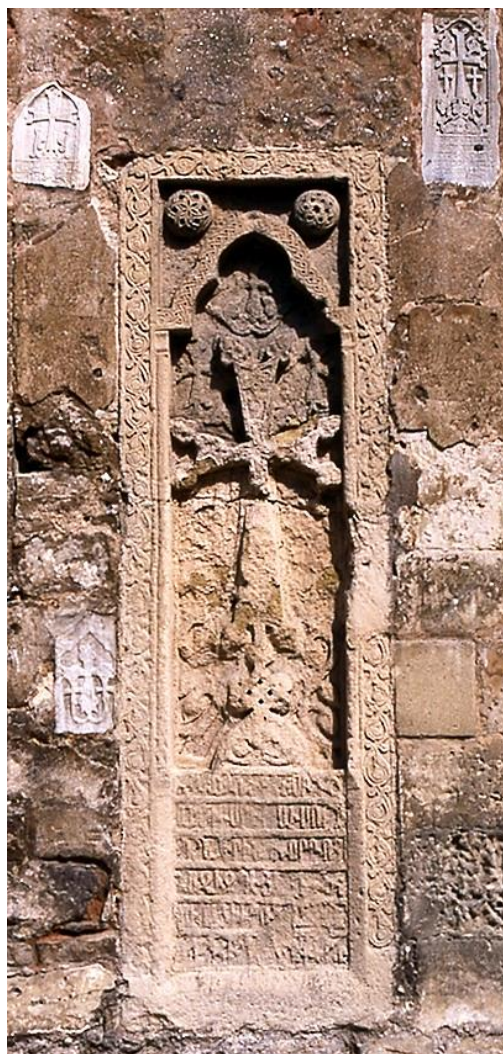
Fig. 2. Caffa. St. Sergius. West façade of the narthex. Khachkar to the left of the door (254 x 78 cm).