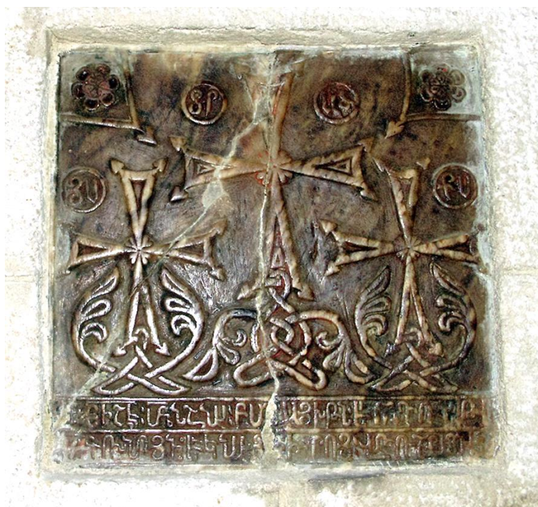
Fig. 29. Lviv. Cathedral. Interior. South-west pillar, north face. Plate of 1461 with three crosses (23 x 23 cm).