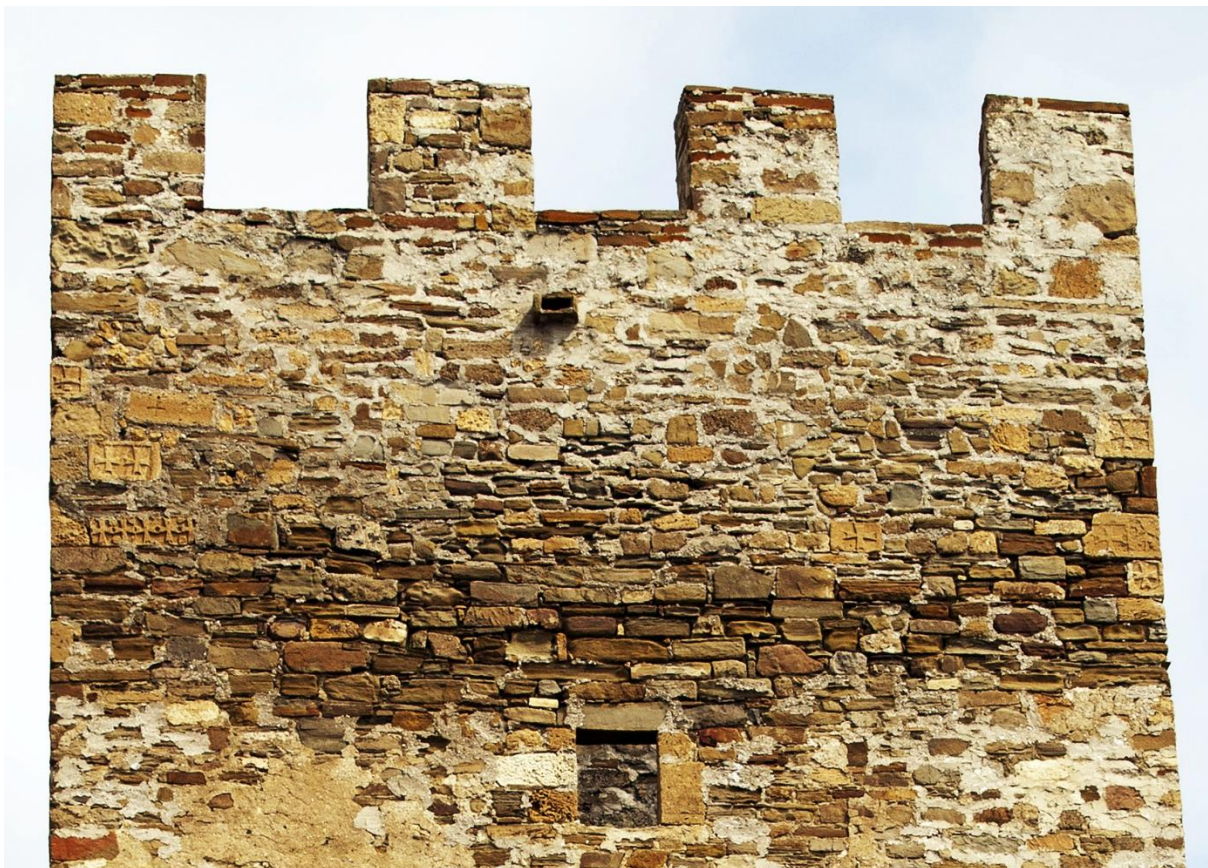
Fig. 17. Sudak (Sugdeïa/Soldaïa, Crimea). Tower of the Genoese consul Federico Astaguera (1386). South façade.