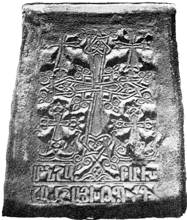
Fig. 6. Caffa. St. Sergius. Narthex. Internal face of the west wall. Plate of 1424. (CIA VII, P. 339, fig. 15).