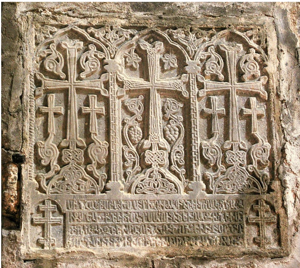
Fig. 10. Caffa. St. Sergius. Interior. Plate of 1451 (marble, 52 x 50 cm).