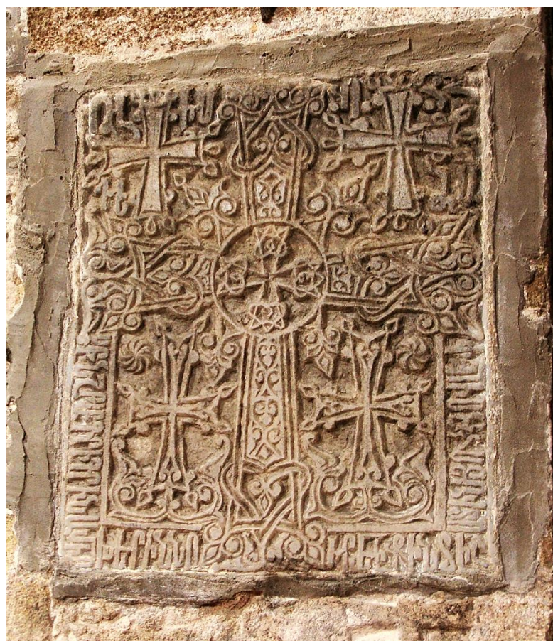
Fig. 7. Caffa. St. Sergius. Interior. Plate of 1427 (61 x 49 cm).