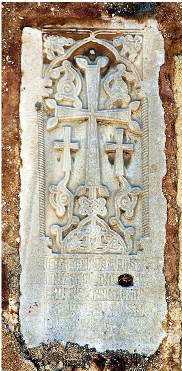
Fig. 8. Caffa. St. Sergius. West façade of the narthex. Plate of 1528, to the left of the door (65 x 23 cm).