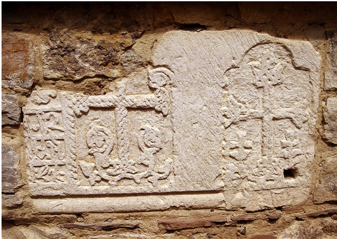
Fig. 33. Kamenets-Podolskii (Podolia). Plate of 1548 near Sts. Peter and Paul cathedral.