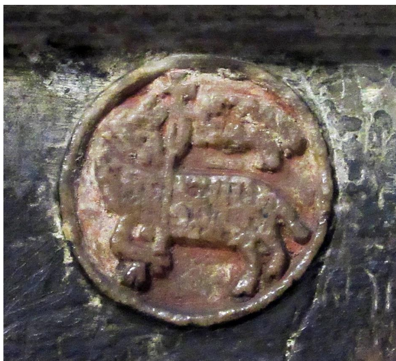
Fig. 31. Lviv. Cathedral. Interior. North-west pillar, south face. Plate in memory of Tēr Grigor. Centre of the upper part. Agnus Dei .