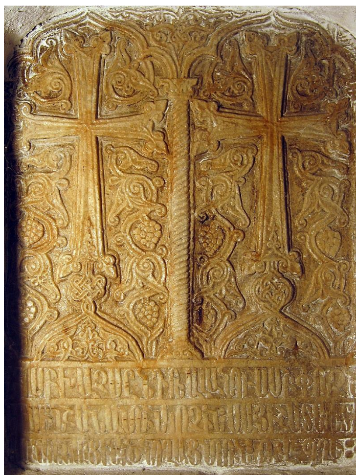
Fig. 36. Akkerman (Belgorod- Dnestrovkiï, Bessarabia). Armenian church of Saint Auxentius. Interior. Plate of 1446 with two crosses. (Marble, 27 x 19 cm).