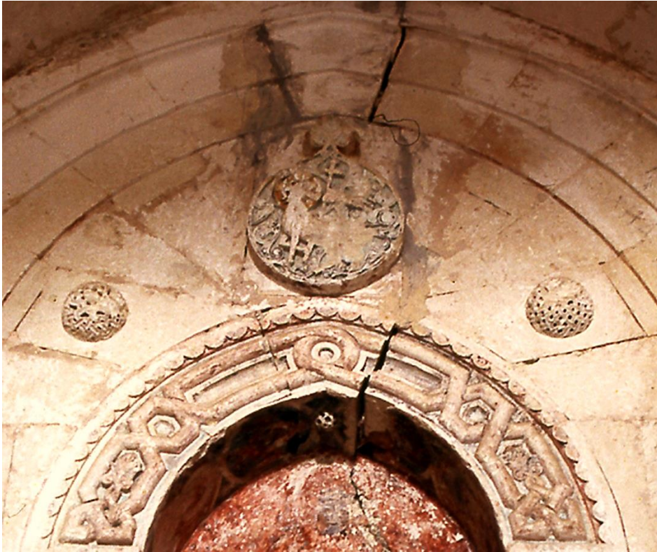
Fig. 32. The Agnus Dei in Armenian Crimea (14 th c.). Examples from the monastery of the Holy Cross (32, 32a), and from the church of the Holy Saviour (32b, 32c).