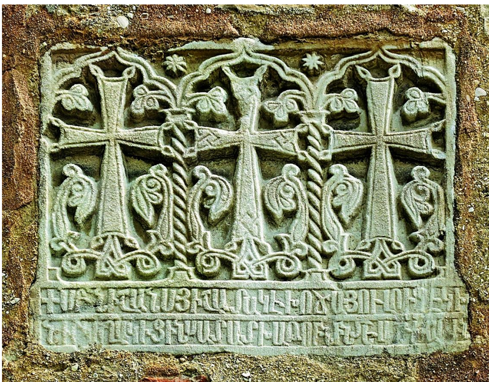
Fig. 11. Caffa. St. Sergius. West façade of the narthex. Plate of 1460 (marble, 45 x 40 cm).