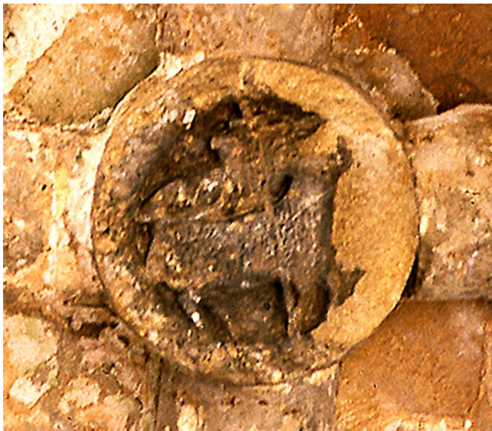
Fig. 32 c