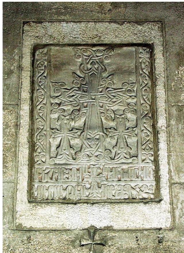
Fig. 25. Lviv. Cathedral. Interior. North-east pillar, south face. Plate of 1427 (45 x 32 cm).