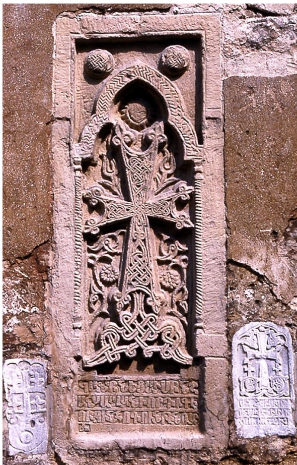
Fig. 1. Caffa (Theodosia, Crimea). St. Sergius (Sb Sargis). West façade of the narthex. Khachkar of 1761 to the right of the door (153 x 62 cm).