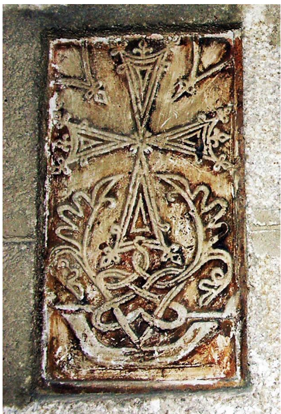
Fig. 27. Lviv. Cathedral. Interior. South-west pillar, north face. Plate (23 x 13 cm).