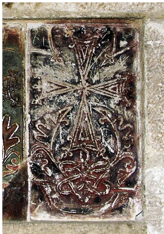
Fig. 28. Lviv. Cathedral. Interior. North-west pillar, south face. Plate (22,5 x 12,5 cm).