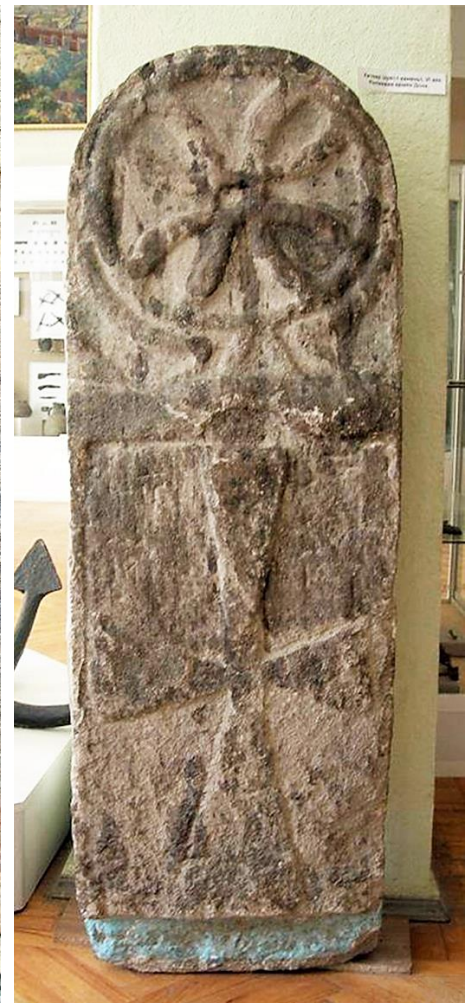
Fig. 16. Nor-Nakhichevan (Rostov-on-Don, South Russia). Stela with two crosses.