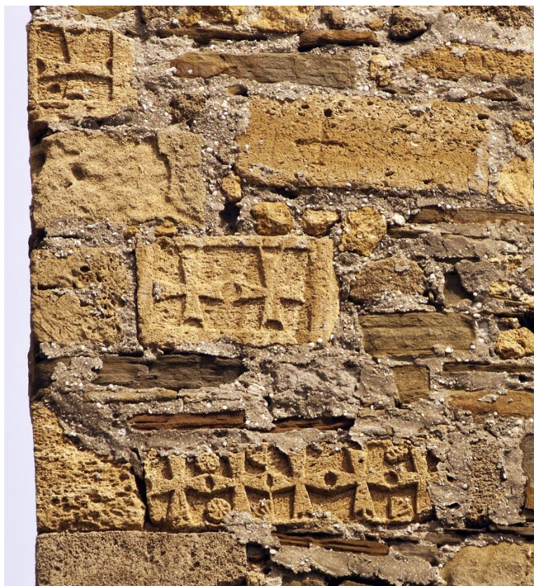
Fig. 18. Sudak. Tower of Federico Astaguera. South façade.