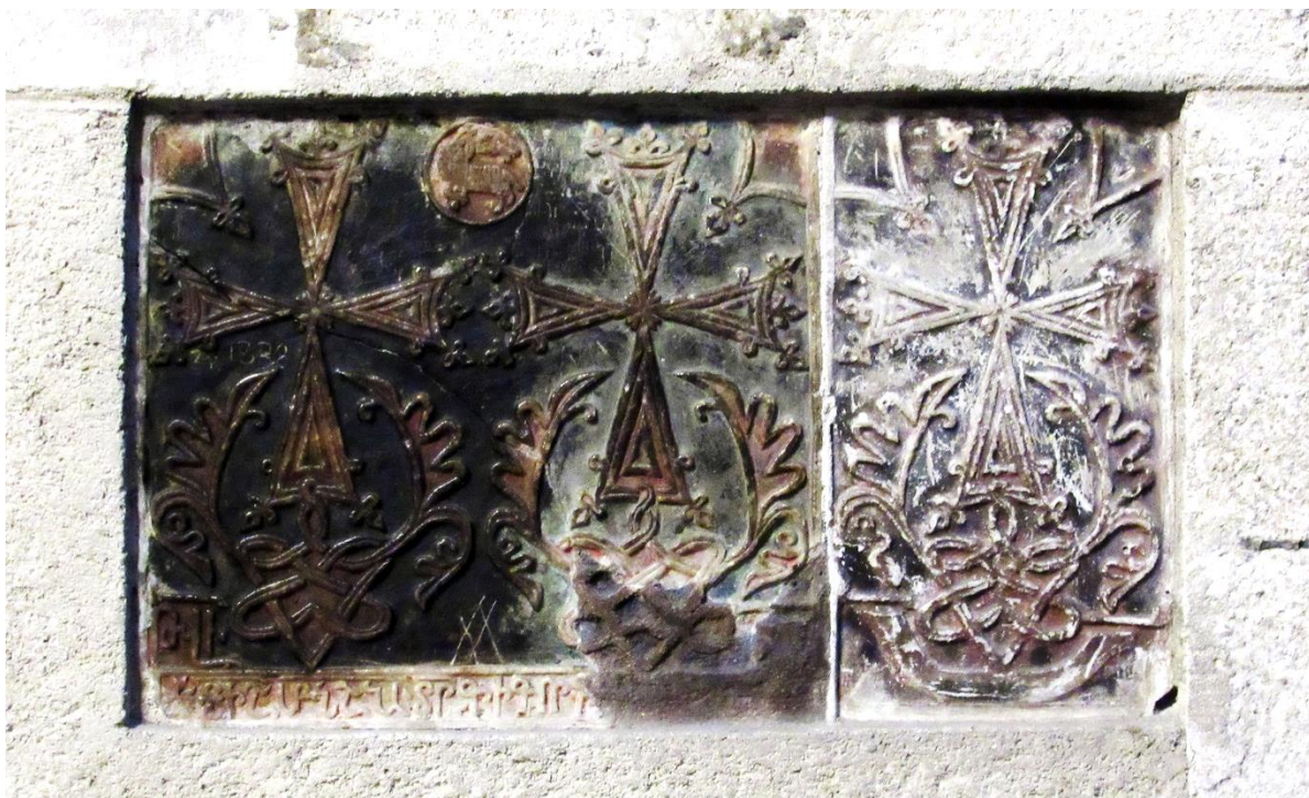
Fig. 23. Lviv. Armenian cathedral. Interior. North-west pillar, south face.