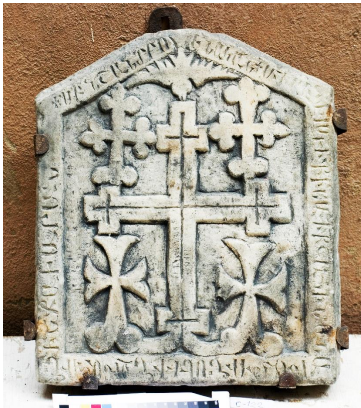
Fig. 35. Lviv History Museum. From Kamenets-Podolskiï (sandstone, 34 x 30 x 5 cm).