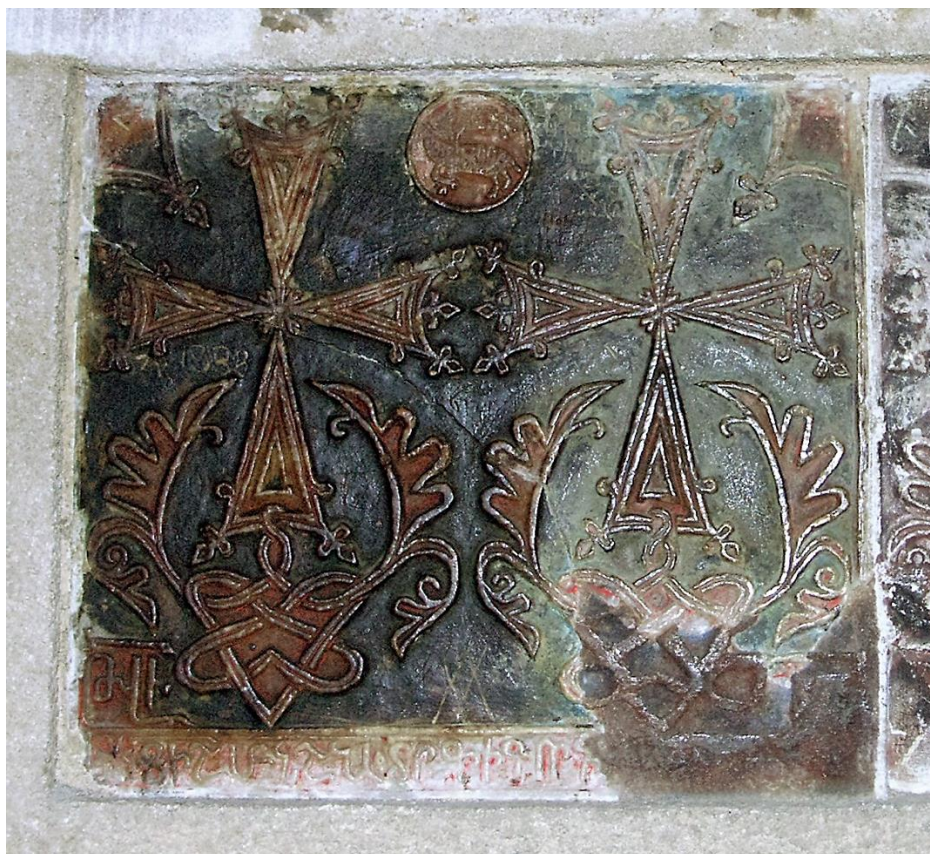
Fig. 30. Lviv. Cathedral. Interior. North-west pillar, south face. Plate with two crosses in memory of Tēr Grigor (25,5 x 22,5 cm).