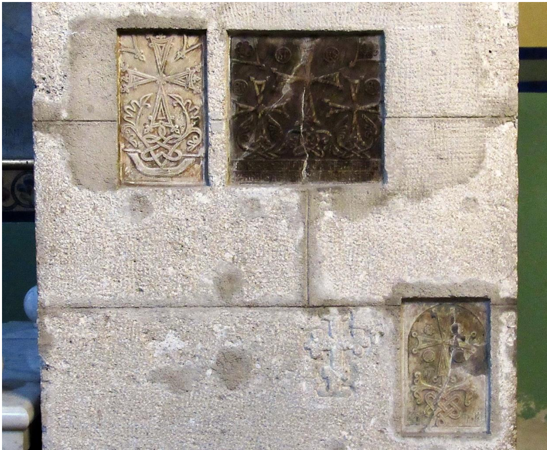
Fig. 22. Lviv (Lvov, Galicia). Armenian cathedral (1363). Interior. South-west pillar, north face.