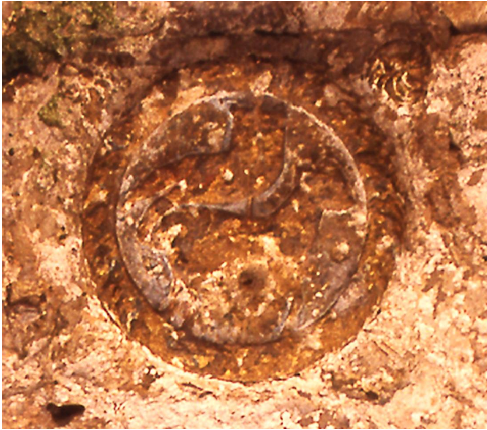
Fig. 32 b