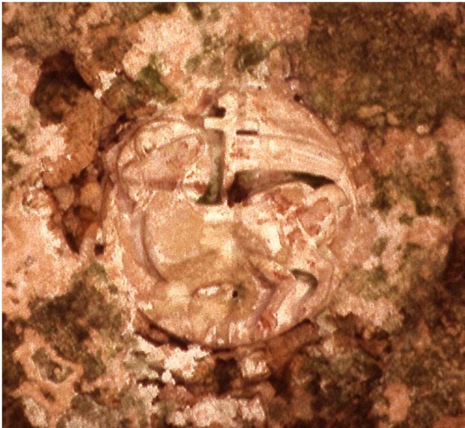
Fig. 32 a.