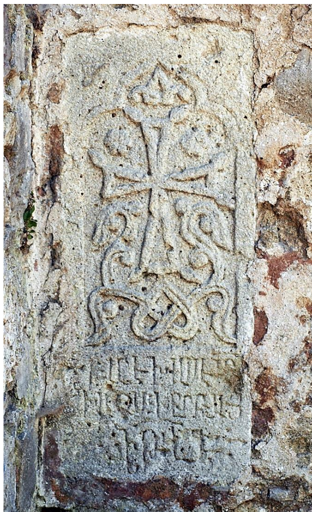
Fig. 4. Caffa. St. Sergius. North wall of the narthex. Plate of 1356 (limestone, 76 x 34 cm).