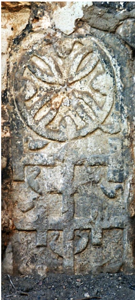
Fig. 14. Topty (Topoliivka, Crimea). Stela with two crosses.