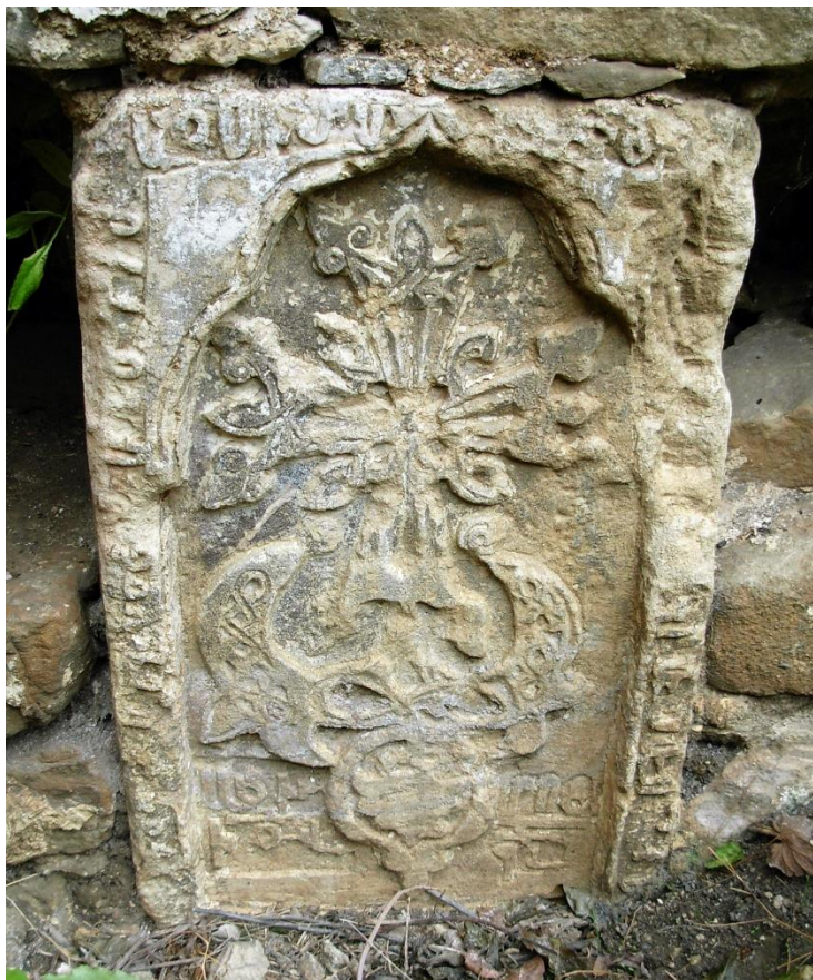
Fig. 12. Topty (Topolyovka, Crimea). Chapel of Friday (Urbat'i, St. Parasceve). Plate of 1381 in memory of Karapet.