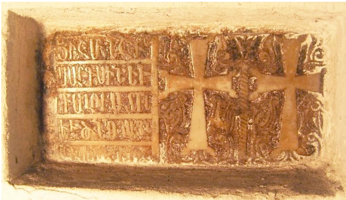
Fig. 37. Akkerman (Belgorod-Dnestrovkii). St. Auxentius. Interior. Plate of 1474 with two crosses. (Marble, 29,5 x 16 cm).