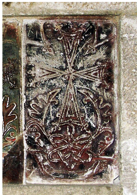
Fig. 28. Lviv. Cathedral. Interior. North-west pillar, south face. Plate (22,5 x 12,5 cm).