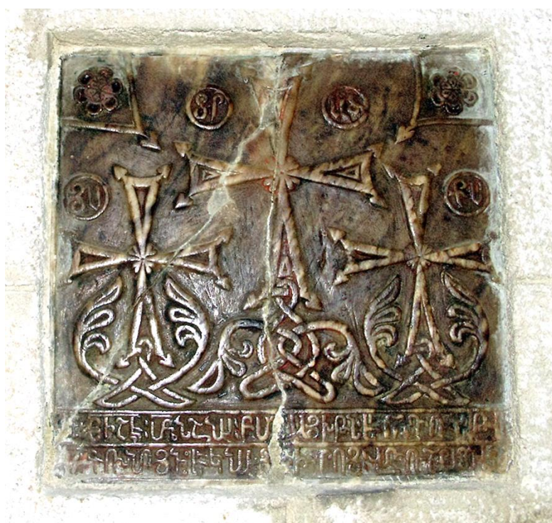
Fig. 29. Lviv. Cathedral. Interior. South-west pillar, north face. Plate of 1461 with three crosses (23 x 23 cm).