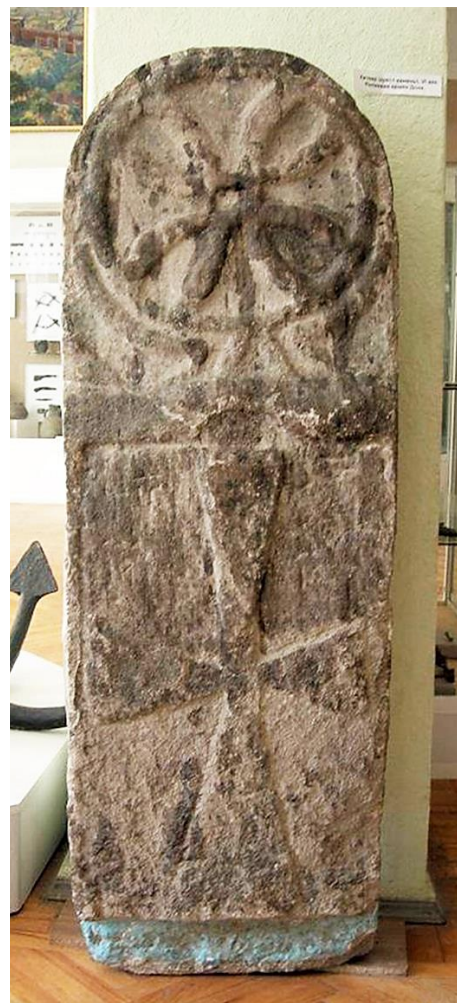
Fig. 16. Nor-Nakhichevan (Rostov-on-Don, South Russia). Stela with two crosses.