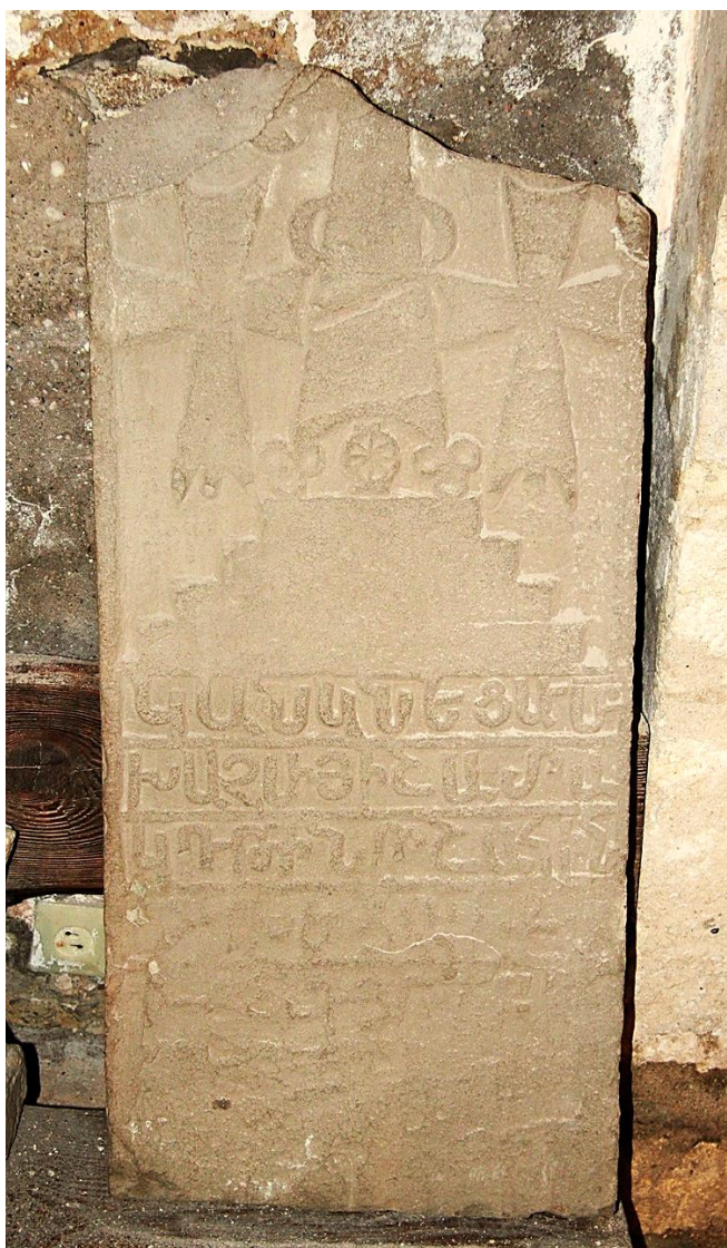
Fig. 20. Sudak. Museum of the fortress. Stela from the tower n° 16.