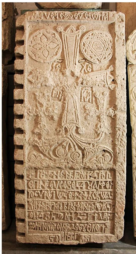
Fig. 38. Kherson Regional Museum. Stela from Akkerman (Belgorod-Dnestrovkii), erected in, or before 1440 (110 x 51 x 20 cm).