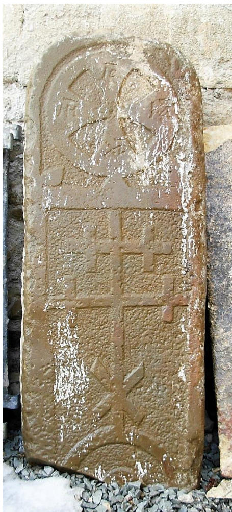
Fig. 15. Sala (Grushovka, Crimea). Stela with two crosses.