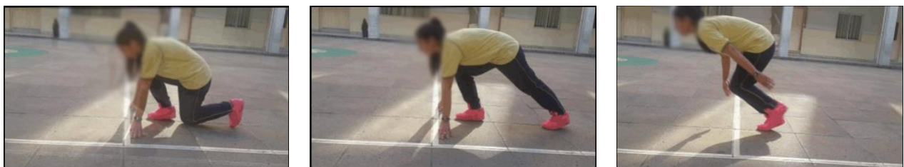
Step 1 : Ready