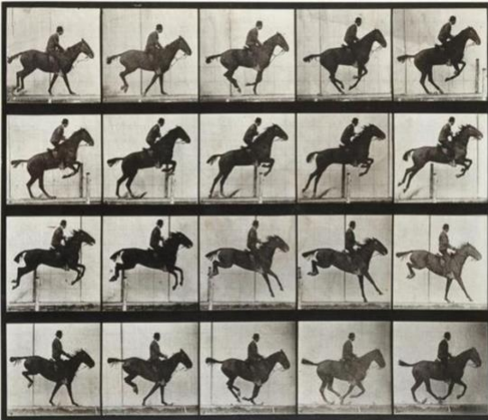
Fig 2. Muybridge Eadweard (1830-1904). Obstacle jump, black horse (1887).