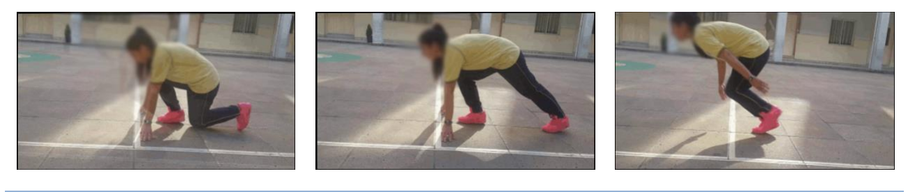
Figure 4. An example of the pictures of the three sprinting start steps that have been used to co-create the GIF animation.

As shown in Figure 4, the GIF images created were animations that showed the body movements during the running race start through three discrete steps. The shots were cut together to produce a short animation, instead of making a one-shot video. Thus, each shot/step appears for a few seconds on screen, with crossfades as transitions.