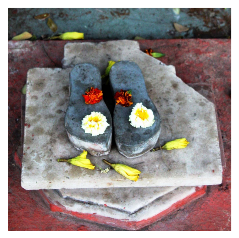
Dattātreya's footwear under a tree represented in stone. Kamala Nehru park, Pune, Maharashtra.