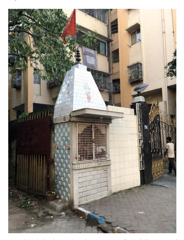
Wayside shrine located at the entrance of a building on a private wall, Kolkata.