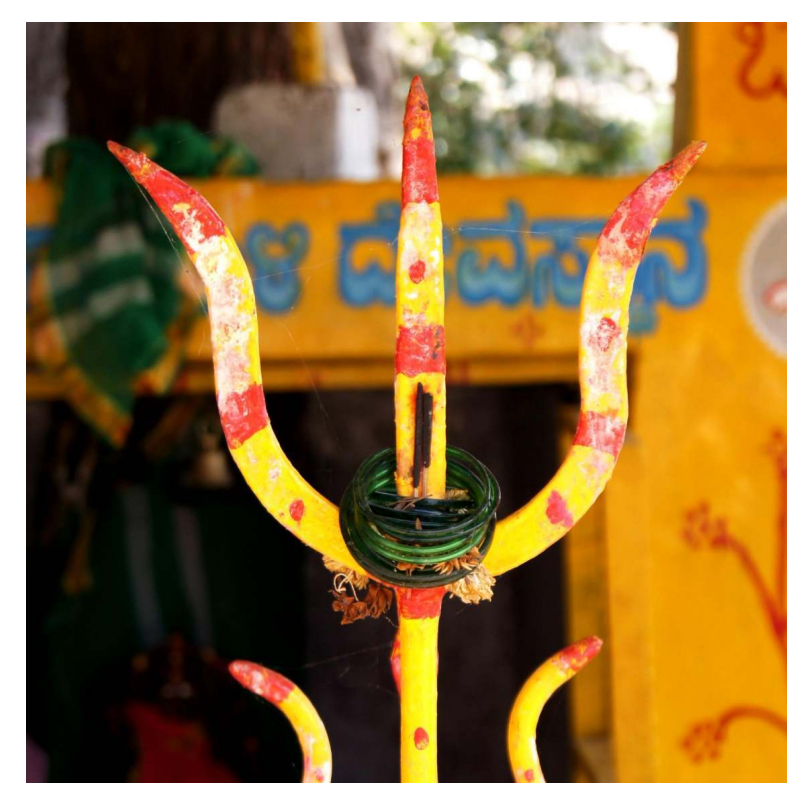
Trident and glass-bangles of the Goddess Durgā. Hampi, Karnataka.