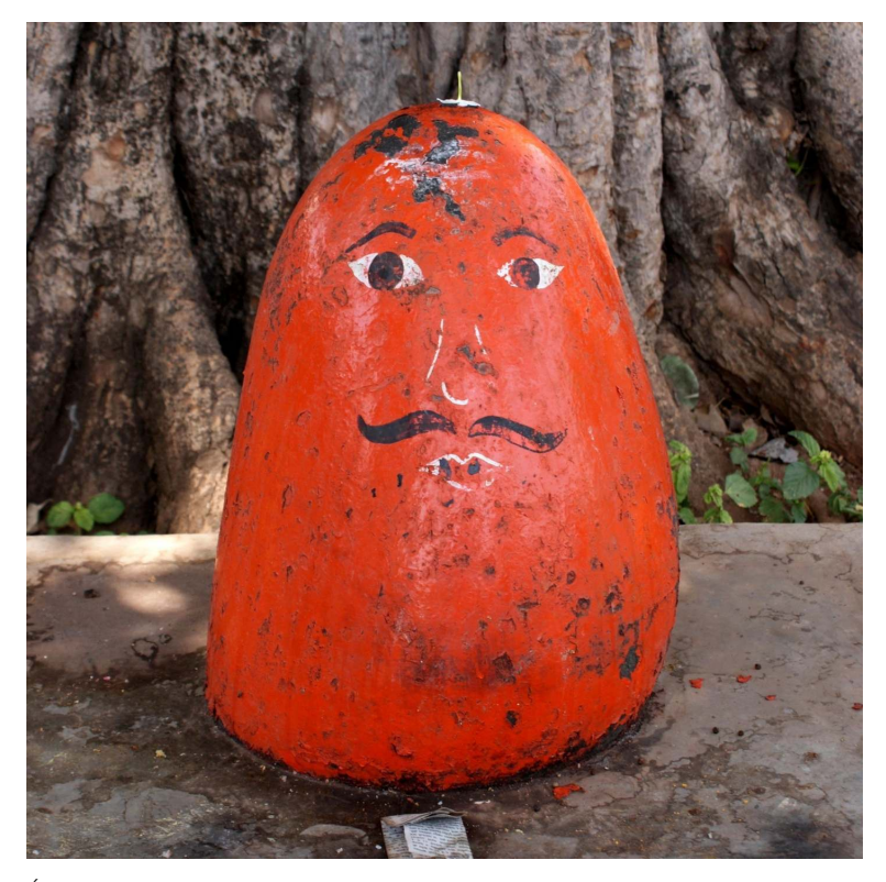
Śivalińga with semi-iconic traces depicting an anthropomorphic face. In Kolhapur, Maharashtra.