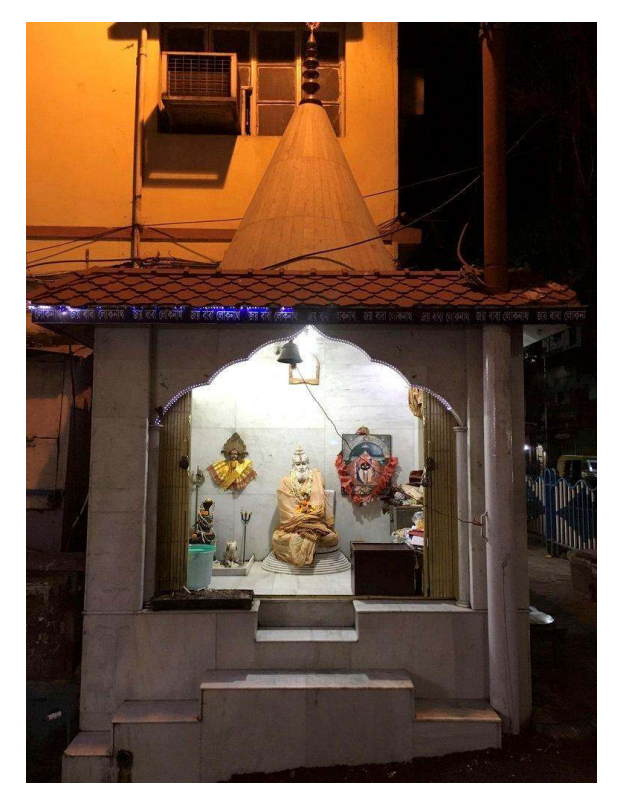
Wayside shrine dedicated to the Bengali saint Lokenāth Brahmacārī, Tollygunge, Kolkata.