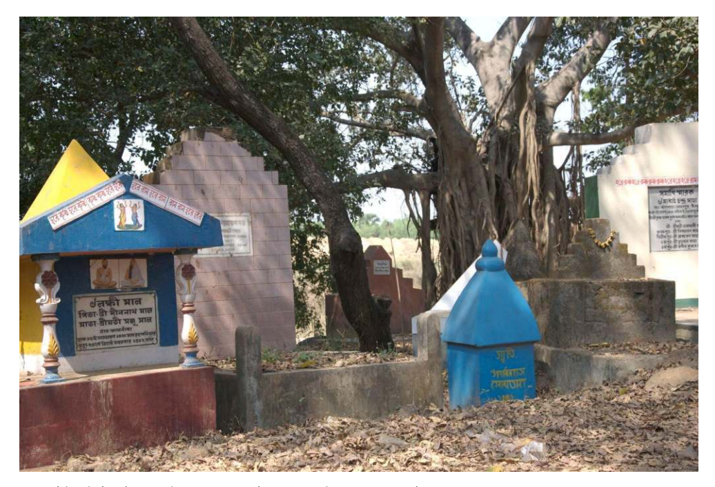
Wayside shrine located on a cremation ground, West Bengal. Photo credits: Raphaël Voix.

Wayside shrine located on private property right next to the footpath and meant to be accessible to any passerby. Photo credits: Raphaël Voix.