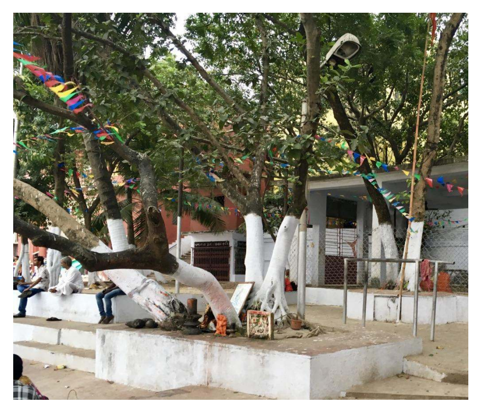
Open-air wayside shrine located on a bathing ghat, Kolkata.