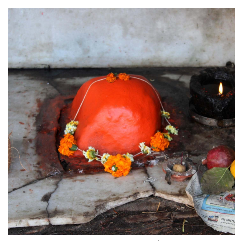
Niche on a wall with an aniconic deity (Mhasoba or Śiva) Shukrawar Peth, Pune, Maharashtra.