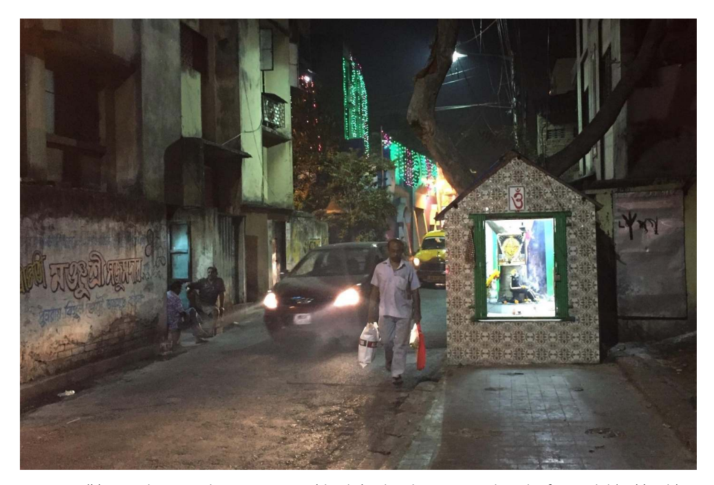
A man walking on the street because a wayside-shrine has been erected on the footpath blocking his way, Kolkata.