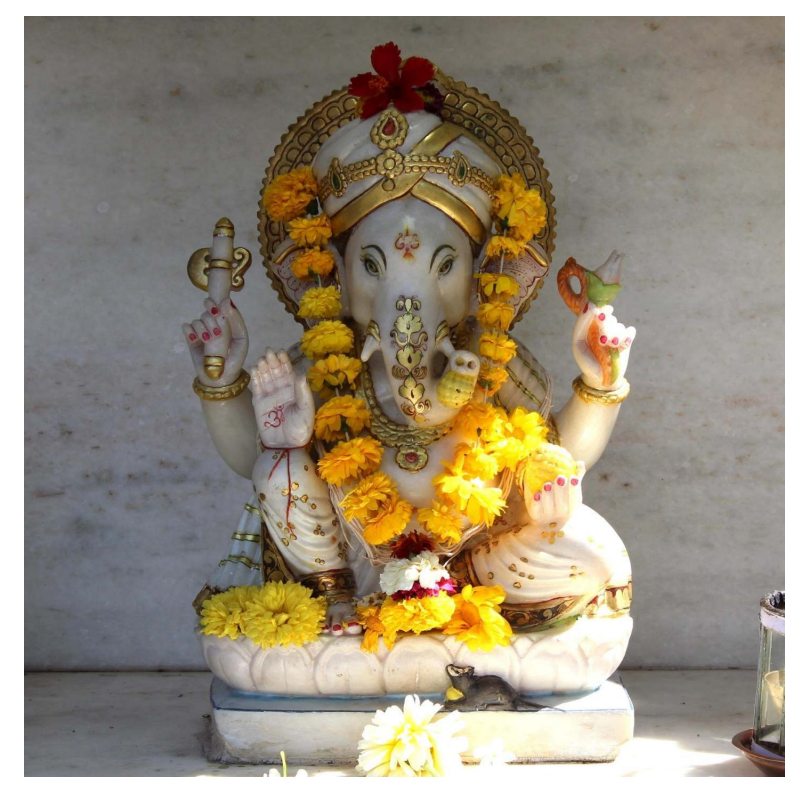
The popular god Ganeśa with a turban. Aundh, Pune, Maharashtra.