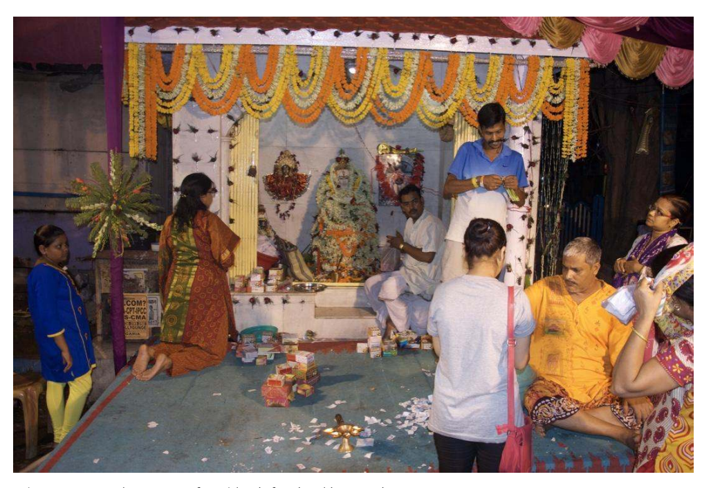
Where two people can comfortably sit for ritual interactions.

<sup>39</sup> We are grateful to all the anonymous reviewers of SAMAJ for their helpful comments on a prior version of this introduction.