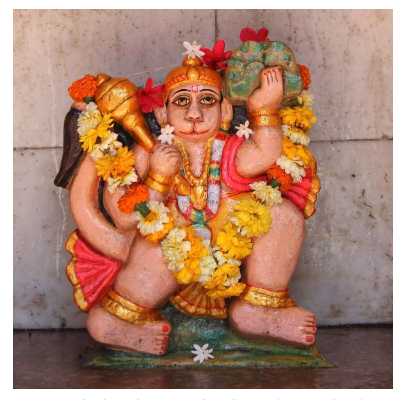
Hanumān carring the Sanjīvanī mountain. Budhwar Peth, Pune, Maharashtra.