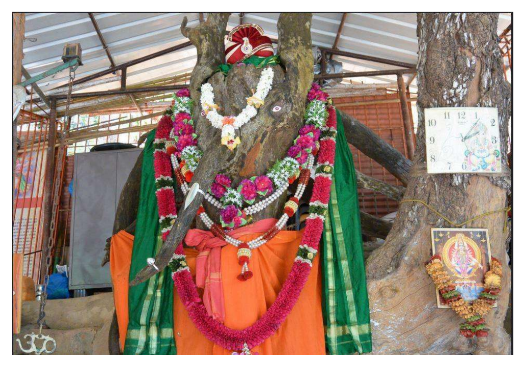
Wayside temple with the form of Ganesa emerging naturally out of a tree on the NH 66, Barcem, Goa. Photo credits: Borayin Larios.

Fully iconic image of Daśabhuja Ganpatī in Budhwar Peth/Shukrawar Peth, Pune, Maharashtra. Photo credits: Borayin Larios.