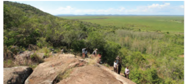
Photography 1: View of Yala Swamp.

Although participation has become a critical component of development projects, especially in rural communities and also in projects with displacement component, this study reveals that community members and project managers have different and sometimes incongruent perceptions and objectives. According to project managers and government officials, participation