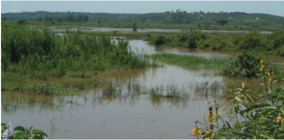
Photography 2: Flooding in the upper part of the swamp.

Although cultivation of vegetables, tubers and fruits is common livelihood strategy among the local community, the dispute between the company and the community members changed this activity from a source of economic income to a resistance tool. Planting banana trees, local vegetables or cabbages near the river was initiated to block the company from expanding