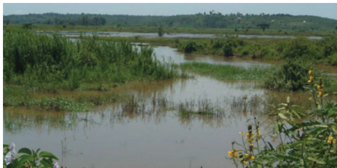
Photography 2: Flooding in the upper part of the swamp.

Although cultivation of vegetables, tubers and fruits is common livelihood strategy among the local community, the dispute between the company and the community members changed this activity from a source of economic income to a resistance tool. Planting banana trees, local vegetables or cabbages near the river was initiated to block the company from expanding