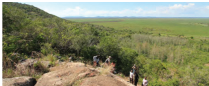
Photography 1: View of Yala Swamp.

Although participation has become a critical component of development projects, especially in rural communities and also in projects with displacement component, this study reveals that community members and project managers have different and sometimes incongruent perceptions and objectives. According to project managers and government officials, participation