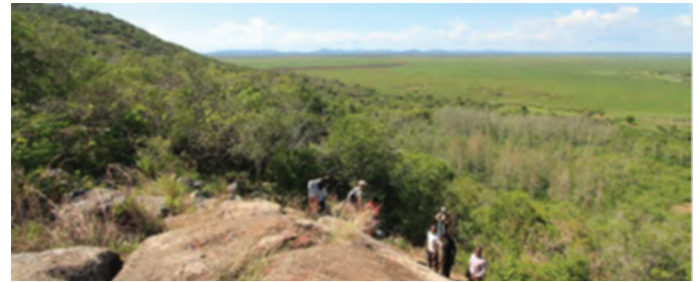
Photography 1: View of Yala Swamp. Source: Anna von Sury, 2015

Although participation has become a critical component of development projects, especially in rural communities and also in projects with displacement component, this study reveals that community members and project managers have different and sometimes incongruent perceptions and objectives. According to project managers and government officials, participation