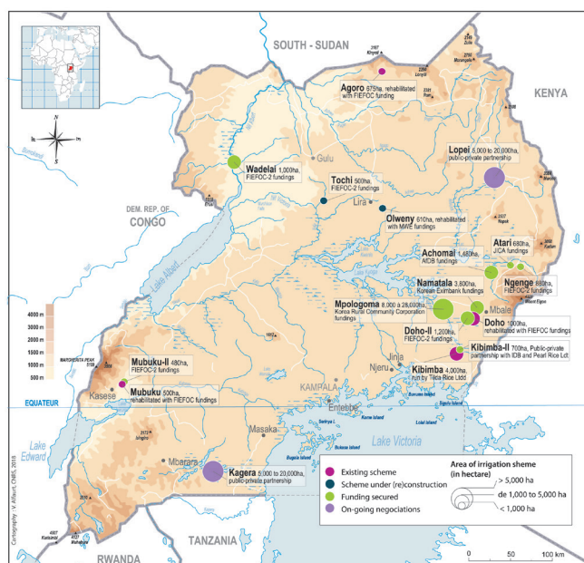
Map showing location of current and forthcoming identified irrigation schemes in Uganda (April, 2018)

Though achievements of the FIEFOC programme were questionable, the MWE remained the executive agency for FIEFOC-2. As the sector developed, intestinal struggles between the MAAIF and the MWE over mandates increased, illustrated by contested bids to control the drafting process of the irrigation policy and the national irrigation master plan. In the absence of an irrigation authority, the Office of the Prime Minister (OPM) is supposedly acting as a referee. However, its interests can also be questioned. Indeed, the choice of consulting and construction companies by the MWE seems to be linked to top-level civil servants of the MWE and to the immediate entourage of Museveni as well – for the latter, a construction company having its ban lifted shortly after unofficially getting, amongst others, a new contract through FIEFOC-2. Meanwhile, another significant private company, encouraged by the President himself during business meeting, is currently under negotiations with the Presidential office to establish private-public partnerships for unprecedented large-scale irrigation schemes close to the Tanzanian border and in the northeastern Karamoja.