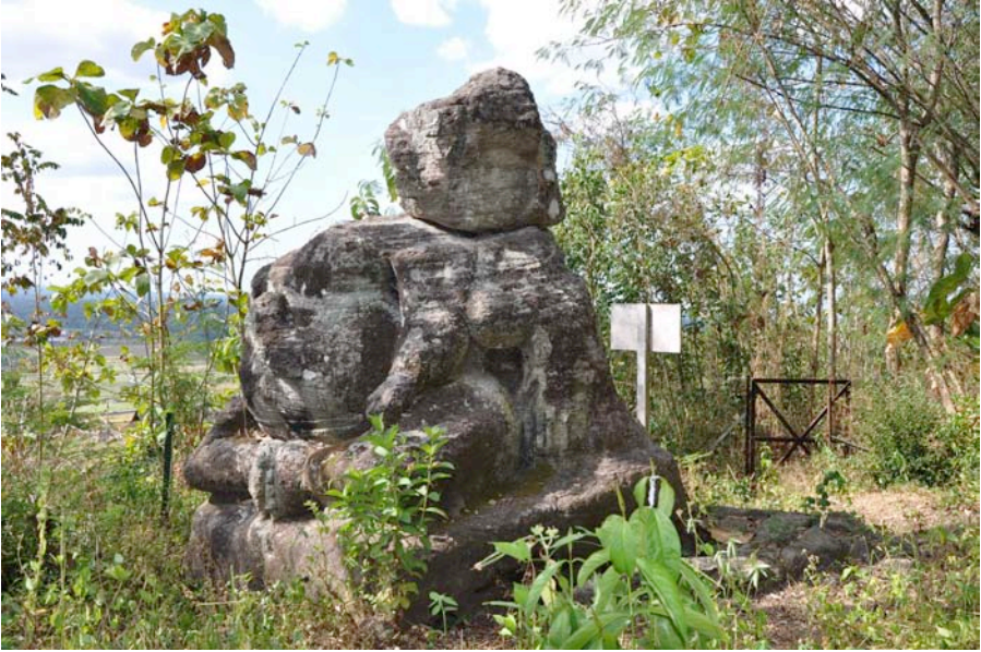
Figure 2a: Arca Ganesa at Sumberwatu (photo Marijke Klokke, July 2009)