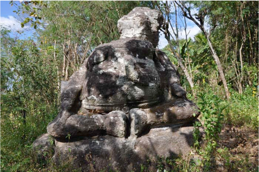
Figure 2b: Arca Ganesa at Sumberwatu