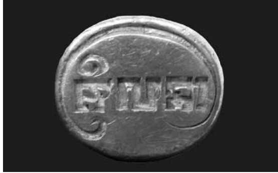
Figure 16. MRS 04.1016. Inscribed signet ring. Photo Arlo Griffiths, inverted horizontally.