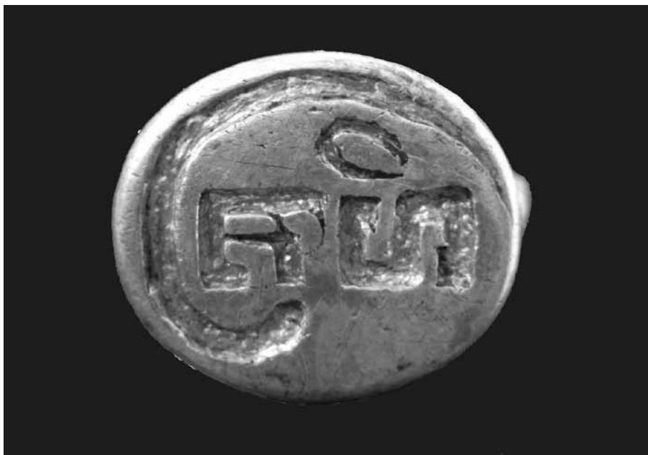
Figure 14. MRS 04.1014. Inscribed signet ring. Photo Arlo Griffiths, inverted horizontally.