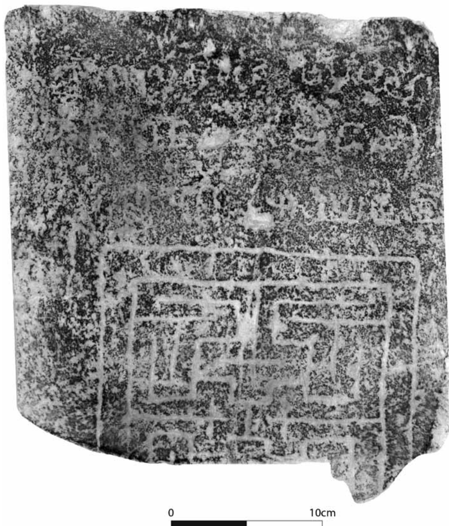
Figure 12. Inscription on stone with geometric decoration. EFEO estampage n. 2037.