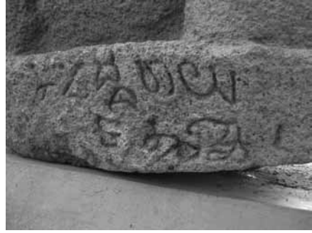
Figure 2. MRS 04.0040. Inscription on the base.