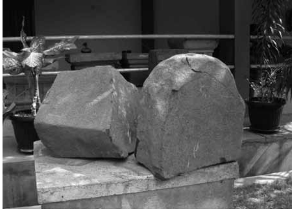
Figure 3. MRS 04.0076. The two fragments of the Balekambang inscription as exhibited in 2011.