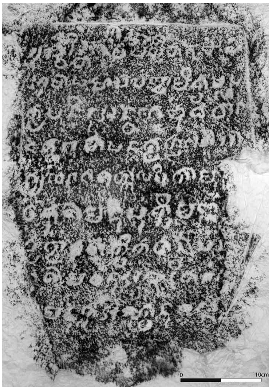
Figure 10. Wangkud inscription. EFEO estampage n. 2038.