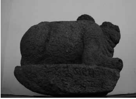
Figure 1. MRS 04.0040. Śiva’s Bull.

The text is not complete. Possibly a part has broken off on this face of the pedestal, or the text may originally have been continued on another face which would have suffered such damage that the continuation of the text is no longer visible there. One expects something like janmaccheda[kāraṇāya] , 6 which would allow translating the whole as ‘Homage to Śiva, Cause of the cessation of rebirth’. I have not found any publication referring to this statue or its inscription.