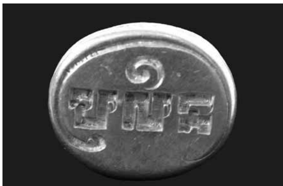
Figure 18. MRS 04.1018. Inscribed signet ring. inverted horizontally.