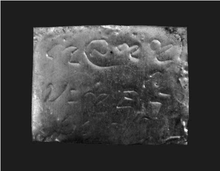
Figure 13. MRS 04.1101. Inscription on gold foil.