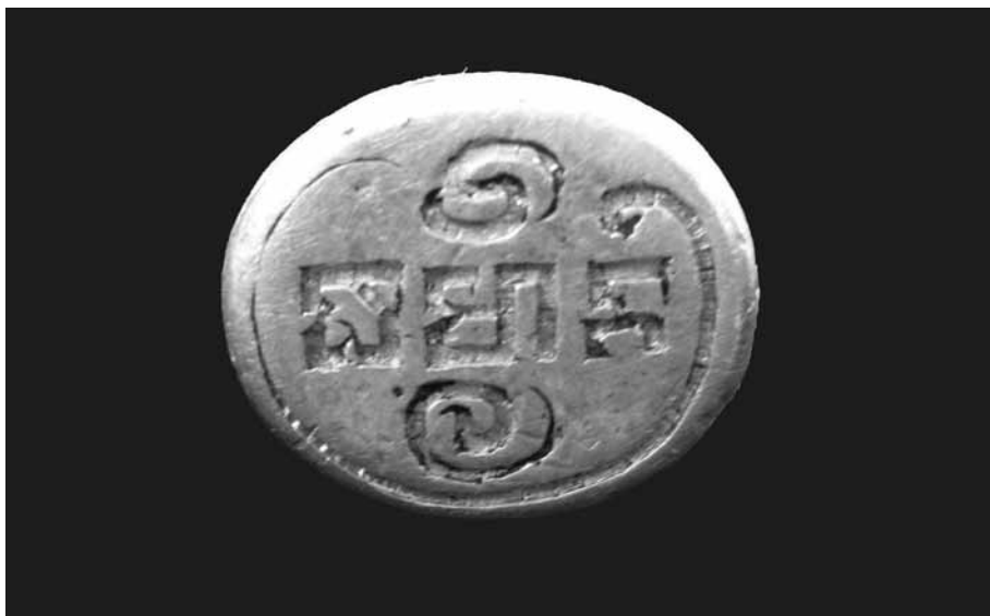
Figure 15. MRS 04.1015. Inscribed signet ring. inverted horizontally.