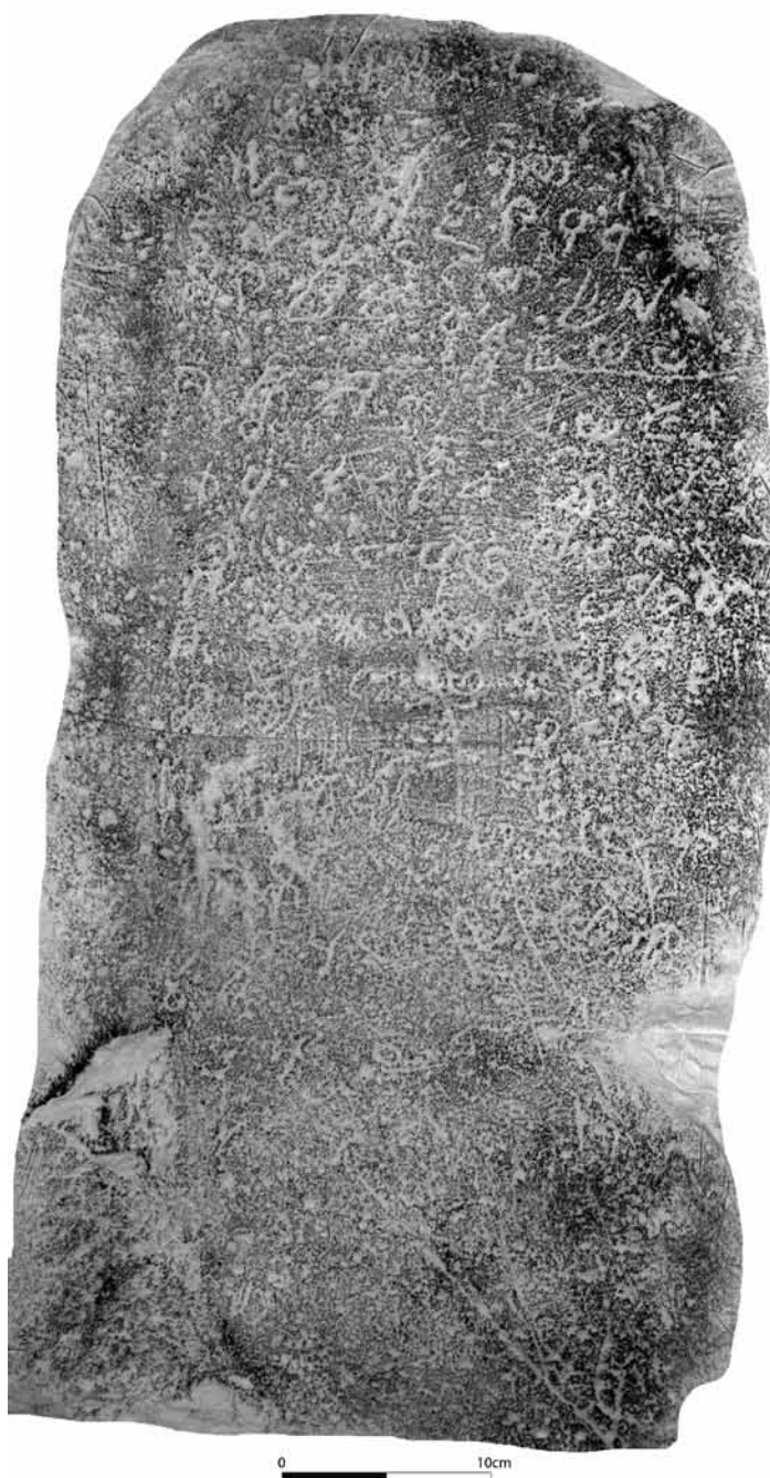
Figure 8. Banjaran inscription. EFEO estampage n. 2034.