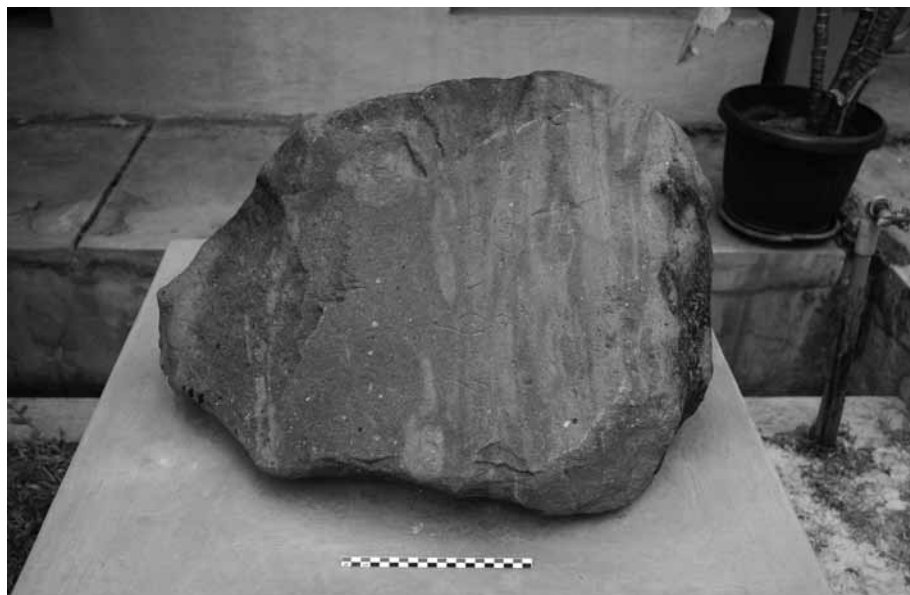
Figure 5. MRS 04.1135. Inscription of 685 Śaka.