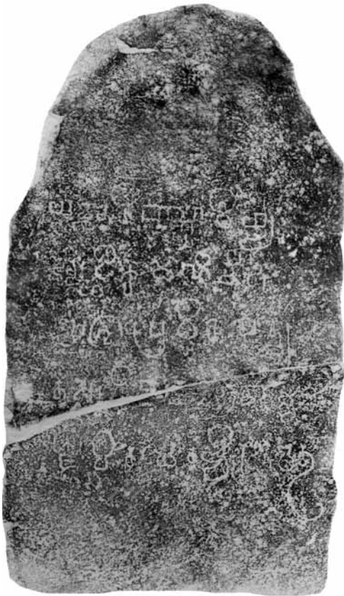
Figure 4. Balekambang inscription. Composition of the two EFEO estampages n. 2040 and n. 2039.