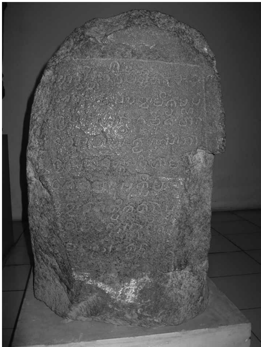
Figure 9. MRS 04.0493. Wangkud inscription.