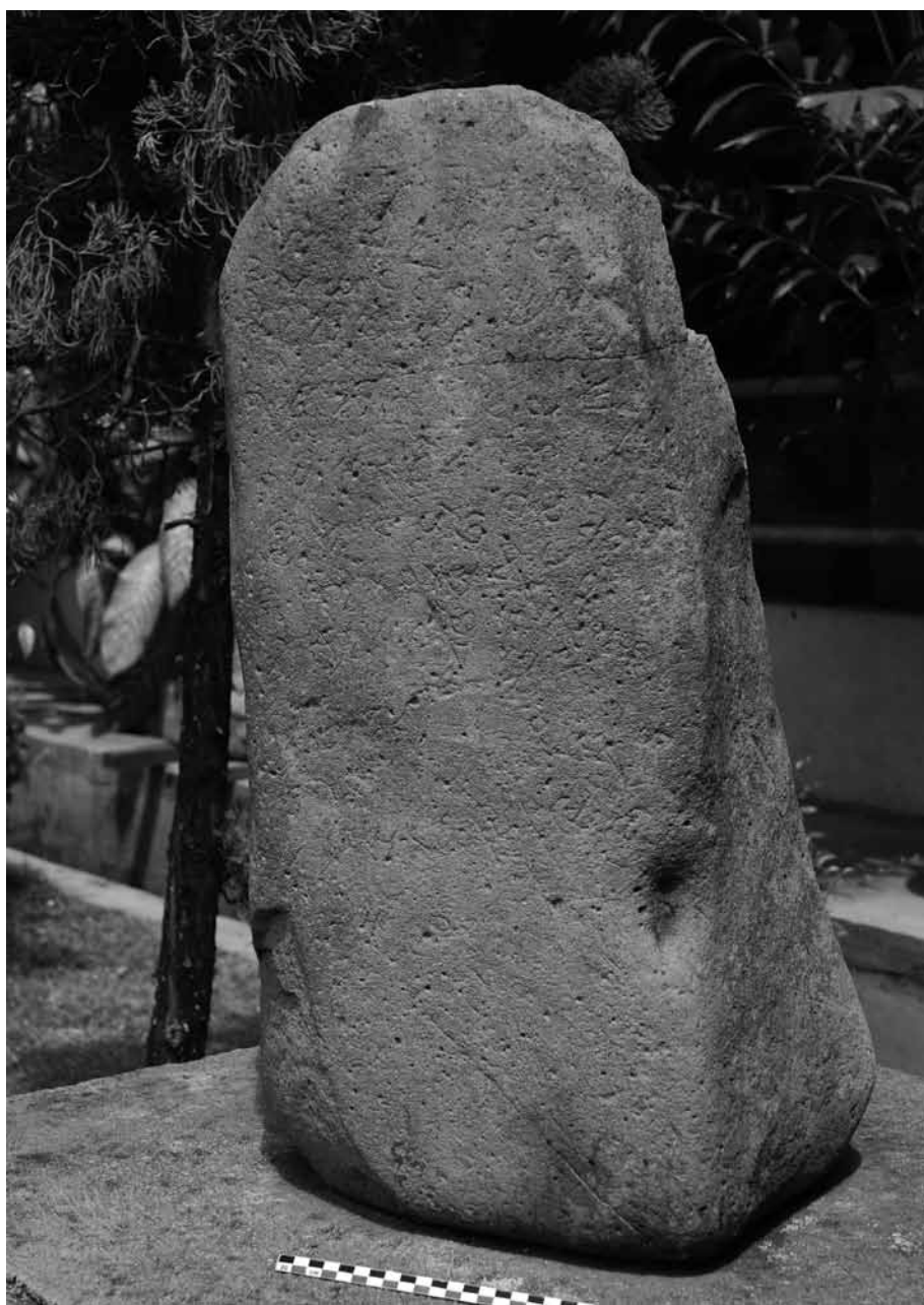
Figure 7. MRS 04.0078. Banjaran inscription. Photo Véronique Degroot.