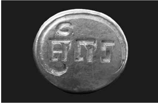
Figure 17. MRS 04.1017. Inscribed signet ring. inverted horizontally.