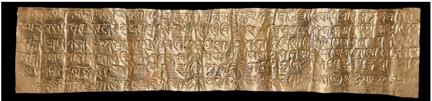
Fig. 40. Gold foil with inscription. Indonesia, ca. 800. Found at Candi Plaosan Lor, Central Java province. H. 2¼ in. (5.8 cm), w. 10 in. (25.5 cm). Balai Pelestarian Cagar Budaya, Prambanan, Indonesia

Indeed, in this phase, not only was the writing system Indian but so were some of the languages used for written expression. By far the most important is the prestige language Sanskrit, but in