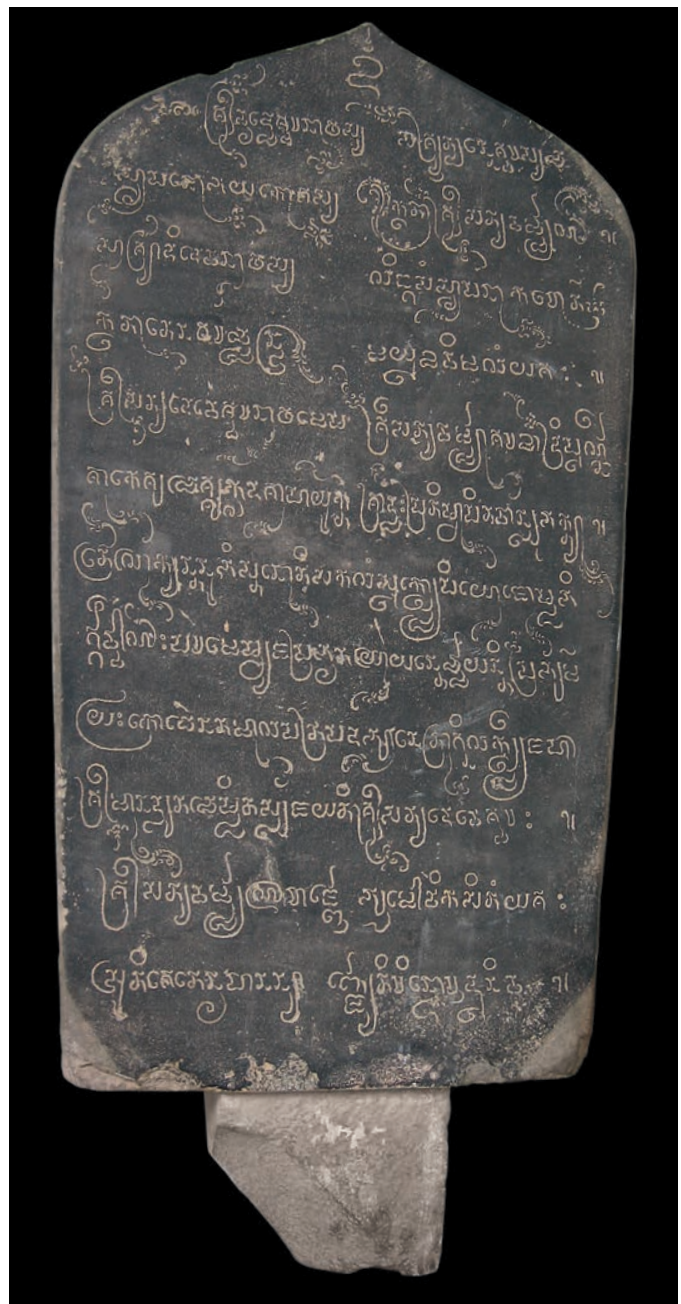
Fig. 41. Stele with foundation inscription (C.217) of Satyadeśvara. Central Vietnam, 783. Found in Phuoc Thien, Ninh Thuan province. Sandstone, 30 \frac{7}{8} x 17 \frac{1}{2} x 4 \frac{3}{4} in. (78.5 x 44.5 x 12 cm). Ninh Thuan Museum, Phan Rang, Vietnam (BTNT 1440/D.13)

Nonarchitectural objects produced in clay or terracotta—pottery, molded “votive” tablets, 22 and sealings—often bear short