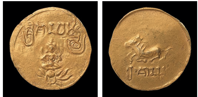
Fig. 45. Gold coin or medallion of Īśānavarman (obverse/reverse). Southern Cambodia, 7th century. Reportedly found in Angkor Borei, Takeo province. National Bank of Cambodia, Phnom Penh