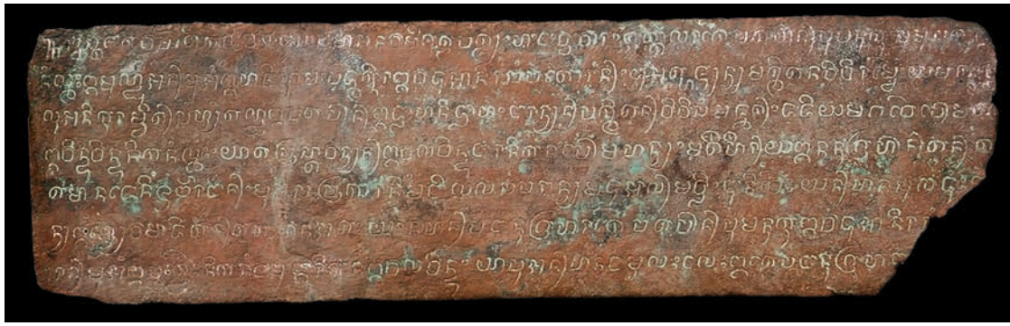
Fig. 39. Muñduan inscription, plate 1, recto. Indonesia, 807. Found in Central Java province. Copper; h. 3¾ in. (9.5 cm), w. 12½ in. (32 cm). Private collection

Śrīvijaya, found on the islands of Bangka and Sumatra, are solidly dated to the end of the seventh century (fig. 24). The inscription on the Cambodian śivapāda , or “footprint of Śiva,” may very tentatively be assigned to about 700 as well (cat. 83). Bearing inventory number K.474, it explains in Sanskrit that the spectator is looking at śivapādadvayāmbhojam —that is, “the pair of lotus feet of Śiva.” 5 With its depiction of footprints, the piece is unique in Cambodian epigraphy. Inscriptions that likewise concern the footprints of Śiva were also produced in early Champa, although none is accompanied by a depiction. 6 The aforementioned inscriptions of Pūrṇavarman, who ruled in western Java, also offer comparable material, but there, it is the footprints of the king and, in one case, those of a royal elephant that are shown.