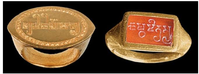
Fig. 43. Gold ring. Southern Vietnam, 5th–6th century. National Museum of Vietnamese History, Hanoi (Lsb 38295 ST 9067). The image is transposed horizontally to render the inscription positive.

Besides their value for reconstructing political, economic, and religious history, inscriptions are of particular importance for art history. For the entire period covered in this volume, they are very helpful in assigning absolute dates to monuments and associated sculptures. Inscriptions may include clear dates that can be converted unequivocally to an equivalent in the Christian (Julian) calendar. 35 And the association of a dated inscription with a monument often yields the date of its construction. Stylistic analysis then allows scholars to establish synchronism between monuments and detached sculptures showing the same ornamental features. 36 An eloquent example of how the discovery of a dated inscription can confirm or refine the understanding of art-historical developments is the foundation stele of the temple of Hoa Lai in Ninh Thuan province, central Vietnam. It fixed not only the dating of this monument (778) but also the art style named after it, which shows connections to both Cambodia and the Malay Peninsula. 37 Although for many periods and areas the chronology is still imprecise and subject to debate, such inscriptional evidence has allowed scholars to determine the general chronological framework of ancient Southeast Asian art and architecture.