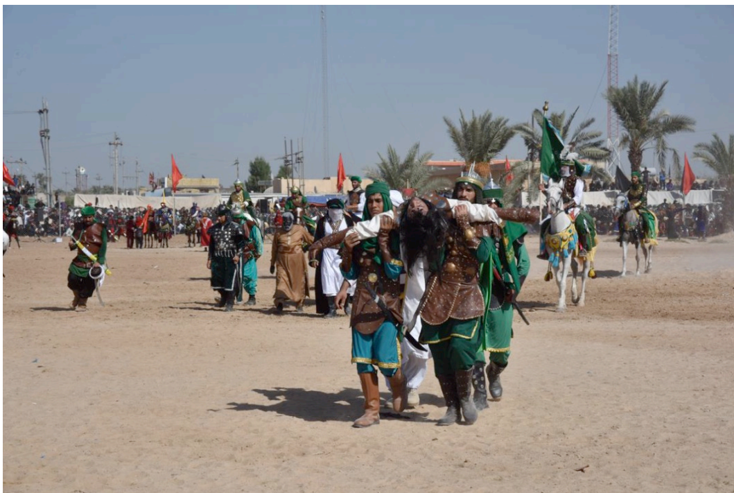
FIG. 3: Death of a companion of Imam Husayn, tashabih in Hira, October 2016.

Another difference from the Iranian ta'zia , which is performed in more confined spaces, 47 is that vocalisation was live, performed by non-professional voice actors sitting in the technical booth on one side of the field. This technique was adopted to bypass financial and technical constraints – namely, the prohibitive cost of a wireless microphone system allowing the actors' voices to be heard across the large, outdoor space. The director and sound engineer created a soundscape combining live dubbing that matched the lines the actors were uttering in classical Arabic; elegies declaimed in dialect by a na'i after the death of each protagonist in Husayn's party; live drums played by a band offstage; and extracts from the original soundtrack of The Message (al-Risala) , the 1976 biopic of the Prophet Muhammad by Syrian–American director Moustapha Akkad. Yet another noteworthy characteristic was that female roles were played and dubbed by women – unlike in Iran, where young men enact female roles. The faces of Husayn and 'Abbas, and those of the women, were entirely veiled with white cloth. 48