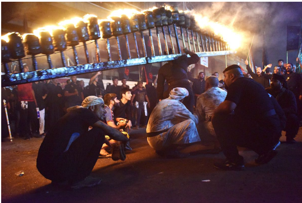
FIG. 2: Young men squat under the circle of fire. Najaf, October 2016.

In 'Amara, most of the rituals are organised by kin groups or tribes ( 'ashira ), with only a few of them gatherings of members of a profession or trade. The most populous processions are preceded by a banner displaying the tribe's name. Participants execute the hosa , a folk song and dance performance associated with the Arab tribes of Iraq (see below). Men brandish sticks and chant poems for Husayn in a southern Iraqi dialect, to the rhythm of cymbals and drums. They surround their champion, who bears the candelabra on behalf of his group. On the crowded street, each torchbearer swirls with his load at regular intervals, while some of the group's young men stand under the circle of fire, squatting to avoid the beam but exposing their bodies to the sparks and burning oil falling from the torches (FIG. 2). In so doing, participants experience the 'burning heat' of the Karbala desert, and of Husayn's family tents set afire by the Umayyad army. 31