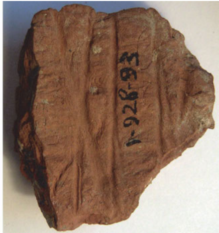
Fig. 4: Bulla Kt 93/k 804. On the recto, the text mentions a shipment to a merchant whose name is broken. There are three seal imprints, two of them bearing the name of their owners, Puzur-Ana, son of Elālī, and Aššur-tāb, son of Ali-ahum. On the verso, there are traces of textiles and strings, suggesting that this bulla was attached to objects (tablets or merchandise) wrapped in a textile.