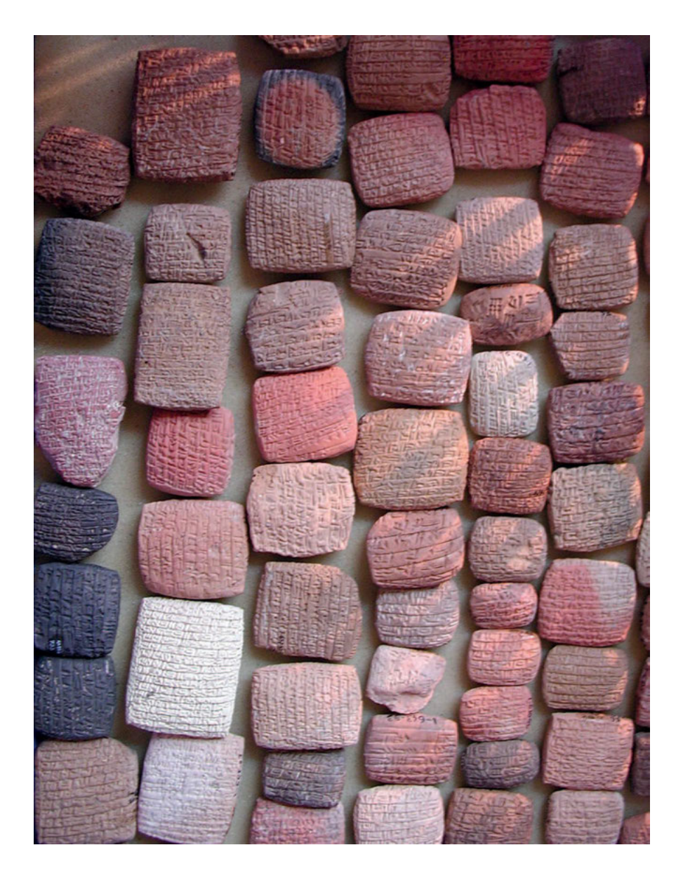
Fig. 3: Tablets belonging to the archives of Ali-ahum and Aššur-taklāku.