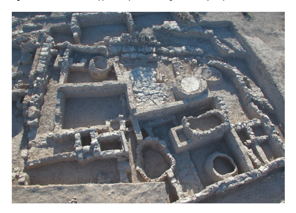
Fig. 2: Houses in the lower town.