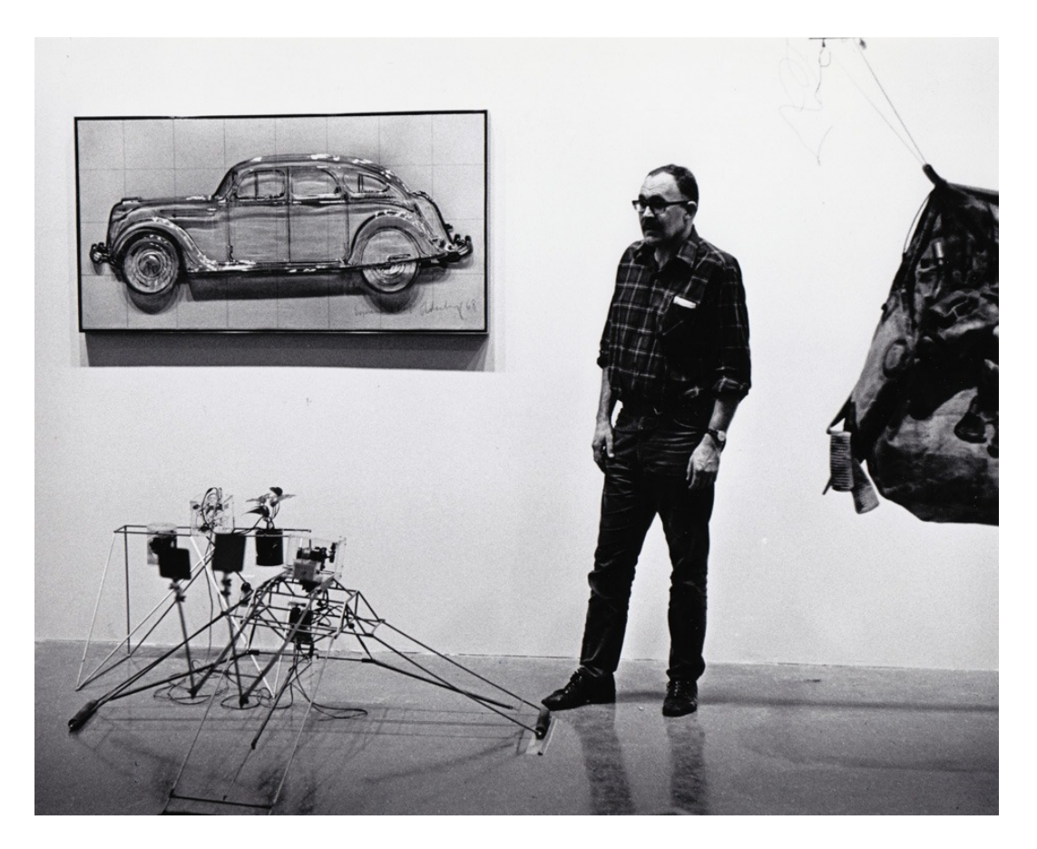
Figure 1. Pontus Hultén during the installation of the exhibition The Machine as Seen at the End of the Mechanical Age , Museum of Modern Art, New York, 1968. Around, works by Claes Oldenburg and Thomas Shannon. Photograph: Shunk-Kender © J. Paul Getty Trust. Getty Research Institute, Los Angeles (2014.R.20).

One of the focal points for an analysis of this theme is New York's Museum of Modern Art during the winter of 1968–1969, in the form of an exhibition that takes place under the revealing name of The Machine as seen at the end of the Mechanical Age , and the catalog for which, with its famous metallized cover, remains an important resource for art historians<sup>5</sup>. Directed by exhibition curator Pontus Hultén (Figure 1), this catalog reviews the history of the relationship of Western artists to the machine, documenting various theoretical axes that are then developed in their relationship to technology, and illustrating many newly established forms of convergence between art and machine.