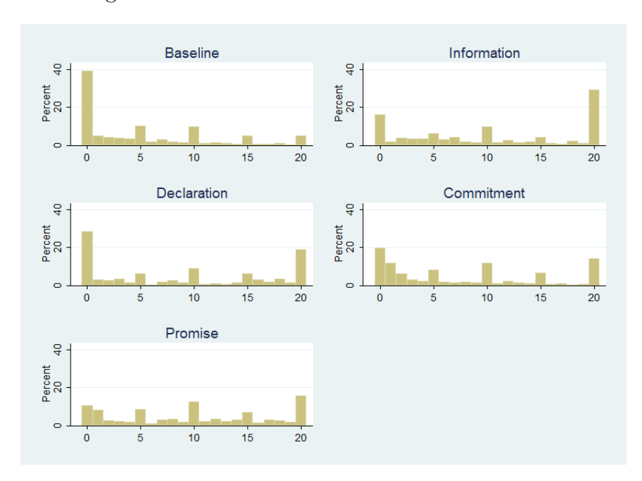
Figure 2: Distribution of individual contributions

Table 6 present Tobit estimations of the determinants of individual contributions<sup>9</sup>. The specification includes control for age, gender and if the subject is a student in economics or management. In addition to treatment variables, we also introduce a period variable as well as the contribution in the preceding period. The reference is the Baseline treatment. The results confirm the strong effect of our four treatments on the individual contribution. Information has