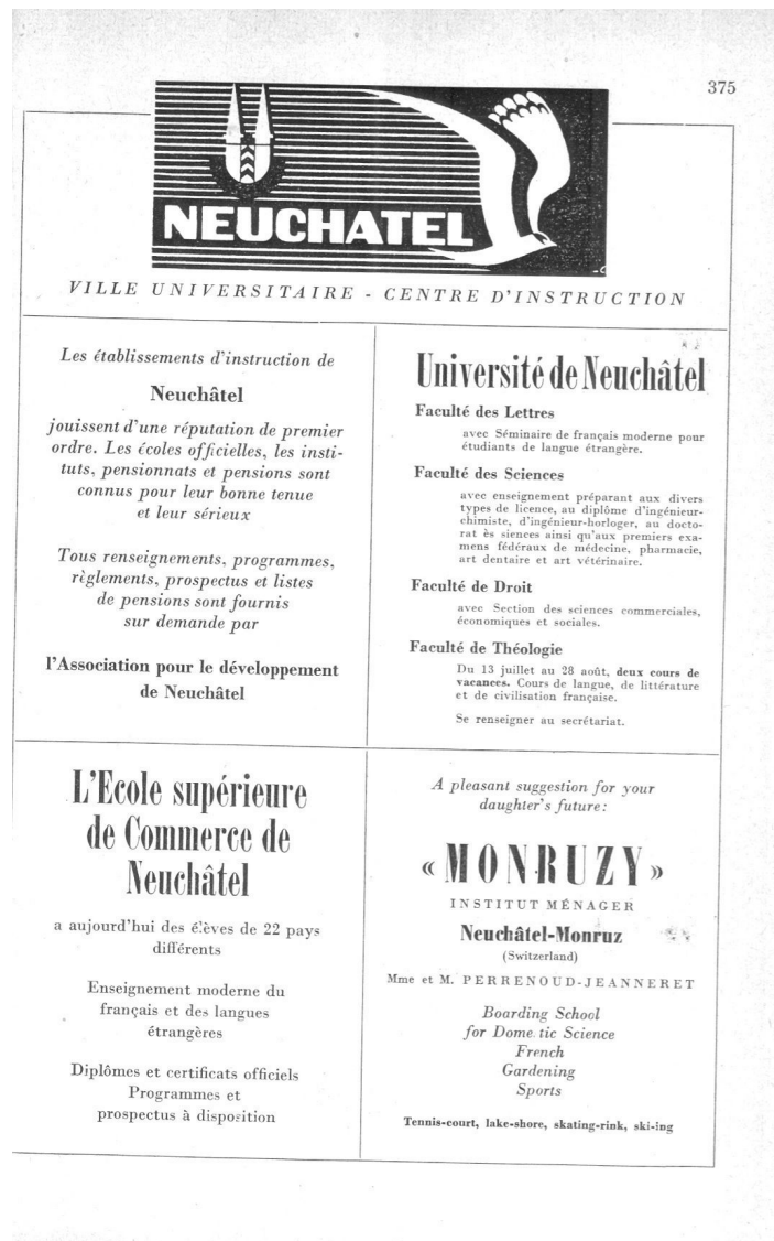
Figure 9.3 Advertisements in the UIA's Yearbook of International Organizations (1948). Source: Annuaire des organisations internationales/ Yearbook of International Organizations (Geneva : Société de l'Annuaire des Organisations Internationales, 1948), 279.

After returning to the UIA, the Yearbook maintained its identity of a practical volume to be sold to 'people in governmental and private positions of responsibility', 'all those in the diplomatic, governmental and intergovernmental services' as well as 'the sociologist, researcher, specialist and officer of international NGOs'. 62 The revamped Union – now conceived as a service centre – marketed the Yearbook as a sober, reliable and easy-to-get product. Editorial statements about international cooperation were left to other UIA publications, while much was made to reach out to potential customers: the 1952 thank-you