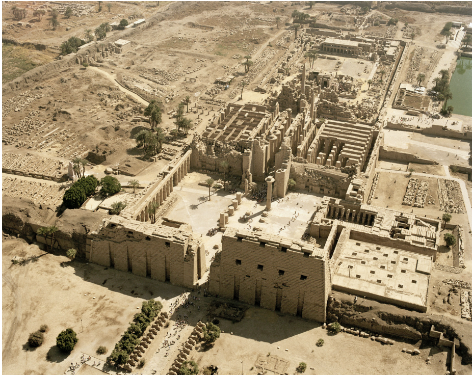
Figure 12.1: Main axis of the temple of Amun-Ra at Karnak

Thanks to the presence of a permanent CNRS team on site, 1 the objective of the Karnak project, initiated in 2013, was primarily to collect this unique amount of epigraphic material. This objective immediately raised the question of the organization of such documentation. How to collect, in an optimal way, these inscriptions that span millennia and use different writing systems, and subsequently, how to disseminate the richness of their contents as widely as possible? Since many of the inscriptions are still known only through hardcopies that are sometimes very old (mid-19 th century), or remain unpublished, how to provide a level of documentation to be used both for the edition of primary sources and for research? Faced with a constantly deteriorating heritage, despite all the attention given to these monuments, what is the best way to sufficiently document, and thereby preserve, the information as it stands today, in the event of a deterioration of these reliefs?