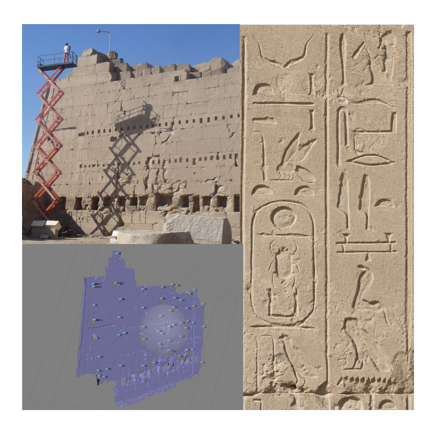
Figure 12.3: Orthophotographic survey, data processing in Photoscan and detail of orthophotography of an inscription several meters high acquired by means of this technique

In order to obtain this coverage, a photographic campaign was established. Photogrammetric techniques are consistently used to produce reliable high-resolution orthophotographs of temple walls and objects in a limited time (Figure 12.3; Tournadre et al., 2017).