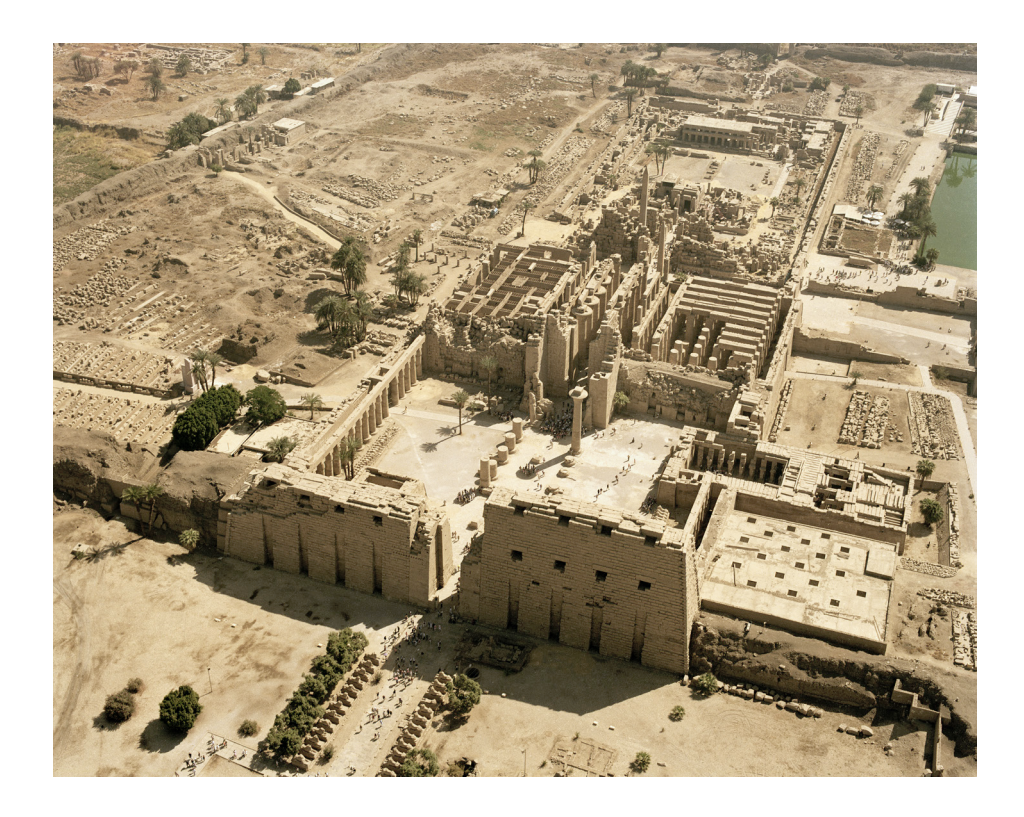
Figure 12.1: Main axis of the temple of Amun-Ra at Karnak

Thanks to the presence of a permanent CNRS team on site, <sup>1</sup> the objective of the Karnak project, initiated in 2013, was primarily to collect this unique amount of epigraphic material. This objective immediately raised the question of the organization of such documentation. How to collect, in an optimal way, these inscriptions that span millennia and use different writing systems, and subsequently, how to disseminate the richness of their contents as widely as possible? Since many of the inscriptions are still known only through hardcopies that are sometimes very old (mid-19<sup>th</sup> century), or remain unpublished, how to provide a level of documentation to be used both for the edition of primary sources and for research? Faced with a constantly deteriorating heritage, despite all the attention given to these monuments, what is the best way to sufficiently document, and thereby preserve, the information as it stands today, in the event of a deterioration of these reliefs?