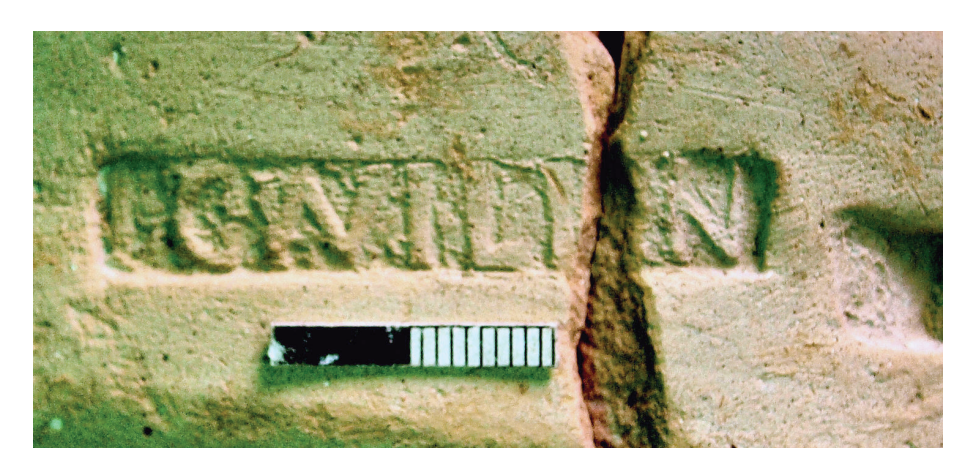
Figure 4. Stamp of the freedman L. Gavius Licinus (Curina, Mongardi 2018; 283).