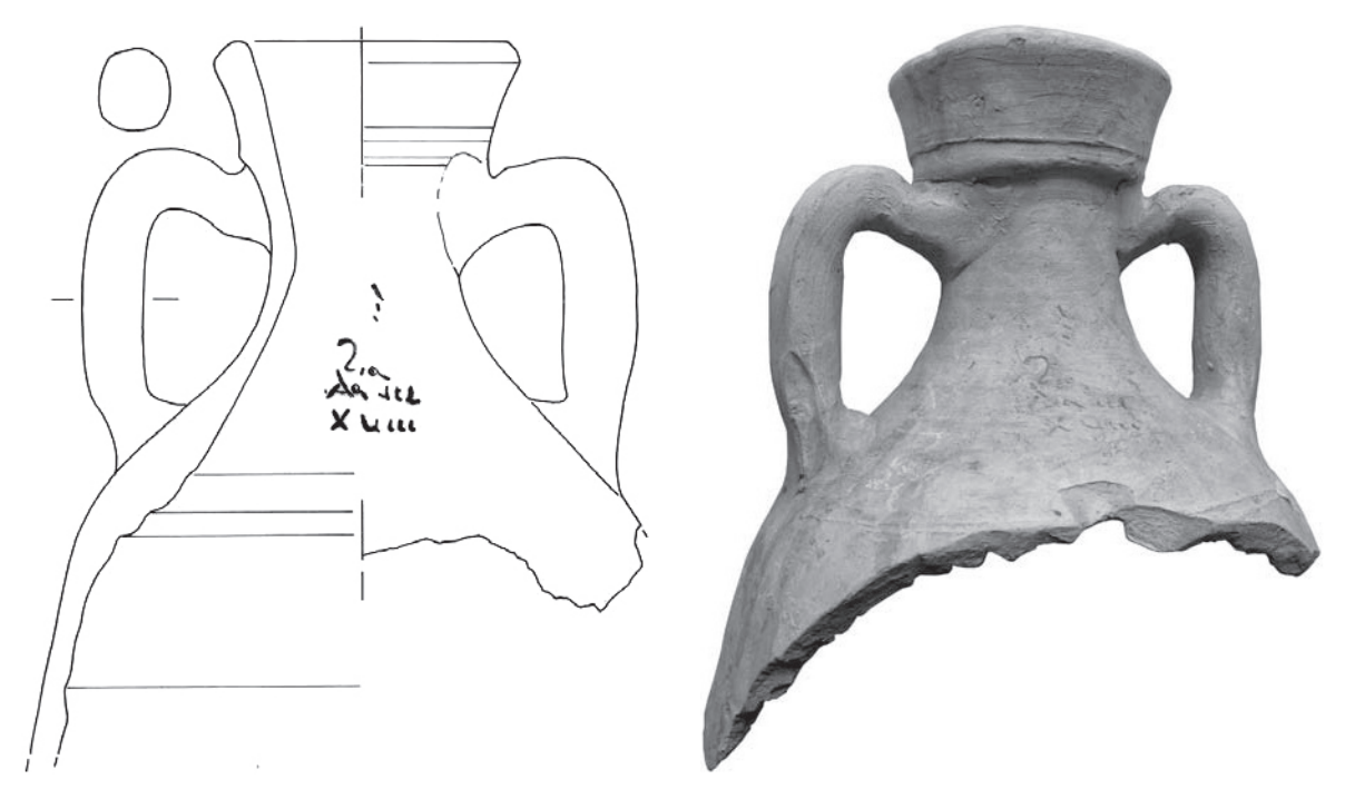
Figure 5. Small fish-sauce Adriatic amphora bearing the painted inscription LIQ(uamen)/ AQVIL(eiense)/ XVIII (Gaddi and Maggi 2017: 323, fig. 105).

and will certainly be enriched in the future by new finds.