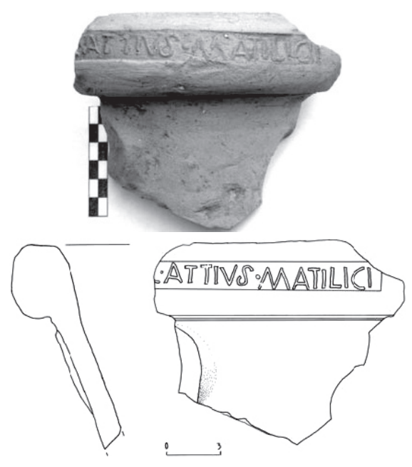
Figure 3. Lamboglia 2 amphora from Matelica (Macerata) (Paci 2016: 541, figs 1-2).

On the problem of production sites, the Locavaz site near Aquileia is to be definitively excluded for