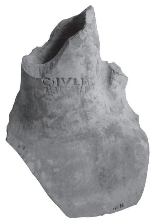
Figure 2. Funnel-shaped rim amphora stamped C.IVLI/MARCELLI (Gaddi and Maggi 2017: 312, fig. 88).

distribution, chronology (from beginning/mid 1st century to mid 3rd century AD) and area of origin (mid-Adriatic area, Cisalpine, Picenum), we now have a very complete picture (Mazzocchin 2009). They are common within the Canale Anfora materials (Gaddi and Maggi 2017: 308-313), where one example obliged us to rethink the problem of their contents: an amphora stamped C.IVLI MARCELLI, which is the only one with funnel-shaped rim from this context to bare traces of resin on the inner surfaces. As the same stamp appears on flat-bottomed wine amphorae, this evidence might support the possibility that within the same workshops different shapes were manufactured for different kinds of wine, or that a shape usually used for oil had been used for wine (for the stamp see Cipriano and Mazzocchin 2016: 218-220) (Figure 2).