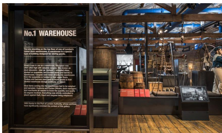
Figure 1 N° 1 warehouse

From a multimodal perspective, there are a number of ways that labels can be written to accommodate the visitor. The placing of the label, the various fonts and sizes all play a role. Bitgood, Benefield and Patterson (1990) underline that “placing a label on a railing in front of an object viewed is more effective than on the side of the exhibit”, while “larger point size and label background increase the attention-getting power” (Bitgood and Patterson 1993). In recent years, there has been greater use of the entry panel which serves to guide the visitor when they enter a gallery. This is illustrated by the panel in Figure 1, which is to be found in the introductory gallery at the Museum of London, Docklands: