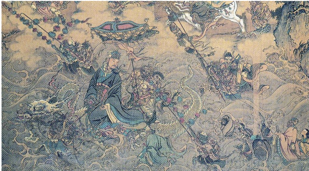
The Water Officer, shuiguan 水官