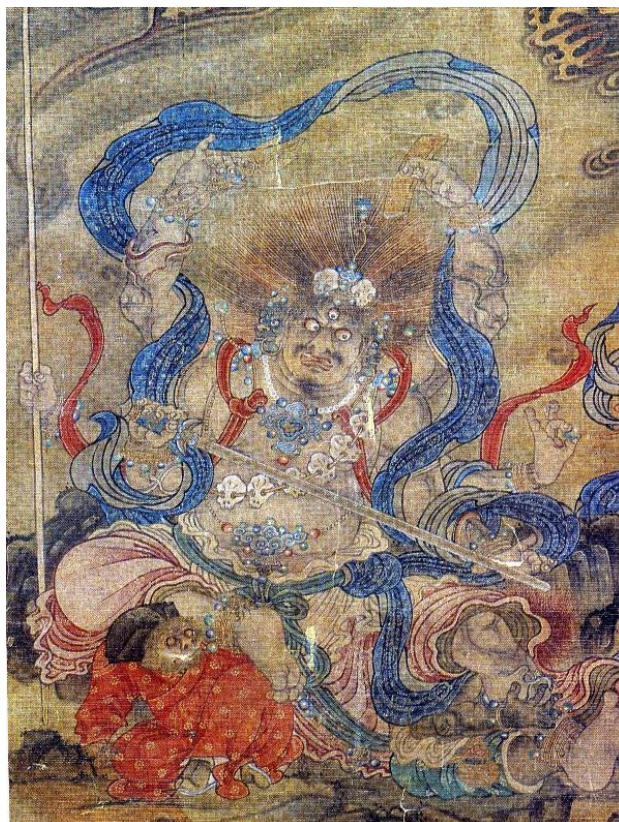
Ming painting of a 'Bright King' mingwang 明王 (Baoning si, 寶寧寺)

In the same way, the brutal appearance of the “red-faced dhuta ” in the erotic dream of Zhong Shoujing, following the more conventional transmission of a