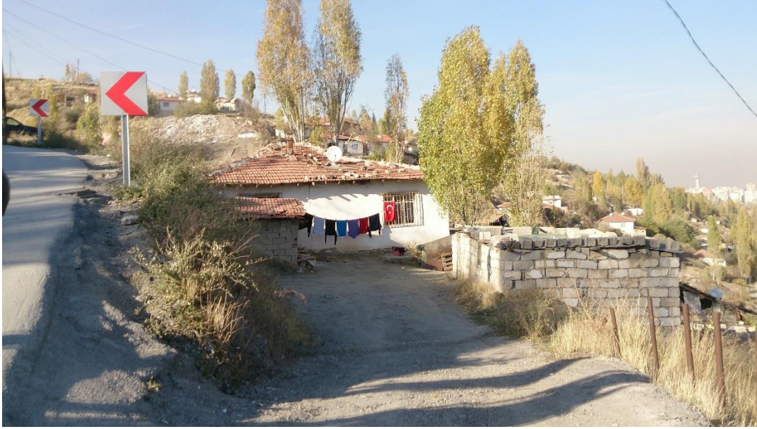
Gecekondus in Dikmen Valley before the project in 2015