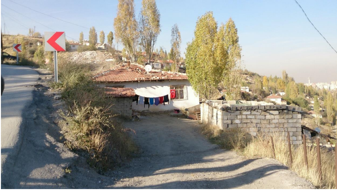
Photo: Gecekondu in Dikmen Valley before the project in 2015