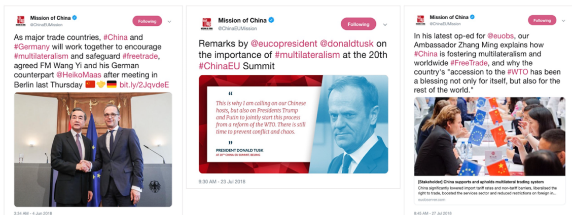
Figure 3. Tweets about China–foreign economic and social cooperation.