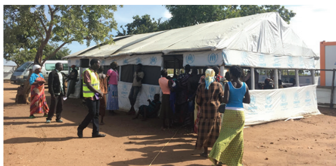
Refugees lining up to be registered in Bidibidi, November 2017

Uganda's open settlement policy upholds certain refugee rights, such as freedom of movement, but requires the monitoring of who enters and exits the settlement for security purposes. To ensure physical protection of refugees within the settlement, the OPM coordinated with external institutions operating under the central government to identify and address potential external security threats to the settlement. This involved information flow between the resident district commissioners (RDC), Local Community Councils (LCC), of which the RWC structure is modeled off, and sub-county officers. The RDC is appointed to oversee matters of security, property, and daily activities of government programs in the district, and also to oversee the Local Community Councils (LCC). These LCCs provide on the ground information reported to the RDC when there is an issue in the community. There are also sub-counties that have a 'giso', the gongora – local word for 'sub-county' internal security officers. These external actors report any suspicious activity to the Deputy Settlement Commandant of the OPM who is in charge of security matters. This information flow is designed to allow for the detection and regulation of security matters.