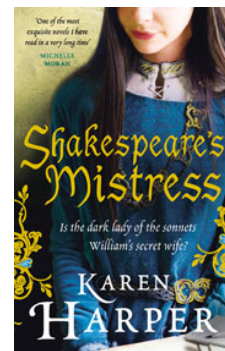
Cover image of the UK edition

The sentimental and sensational component of Mistress Shakespeare is announced in the cover images of both the US and UK edition, the former showing The Soul of the Rose (1910), a famously lavish painting by John William Waterhouse, the latter presenting a young lady in a Tudor costume and introducing the tantalizing question: “Is the dark lady of the sonnets William’s secret wife?”. Her face is only visible from the nose down; eyes and forehead are cut off from the picture, alluding to the mysterious identity of Shakespeare’s beloved mistress.