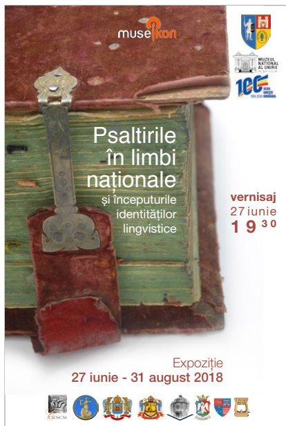
▲ Fig. 3. Poster of the Psalter exhibition organized by the Museikon section of the National Museum of the Union in Alba Iulia. June 27 th -August 31 st 2018.