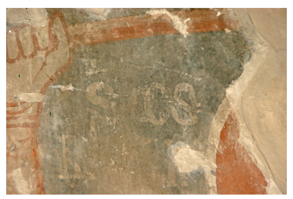
Figure 15. Detail of the inscription accompanying the Holy Kings of Hungary, Criscior church murals.

attention to the fact that argumentation relies in all cases on the arbitrary choice of the researcher.