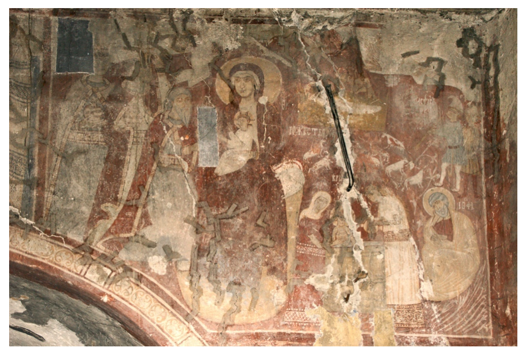
Figure 13. Murals from the church in Ribita.

Moreover, although there are some similarities indeed between medieval stone churches and modern wooden ones in the area, it cannot be ruled out that the medieval buildings could have influenced the modern ones in a reverse relationship.<sup>31</sup> Furthermore, recent research has proven that it is impossible to identify a Romanian Orthodox type of architecture, liberated from the influence of the Catholic churches of Transylvania (Rusu 1999: 282-283). Research tends to ignore the well documented presence of Catholic Romanians in the Middle Ages (Barbu) and the two categories are defined at the discretion of the researcher. The success of this theory in the National-Communist period (pre-1989) was facilitated by its Protochronist nature as well as by ab auctoritate and ex cathedra arguments.