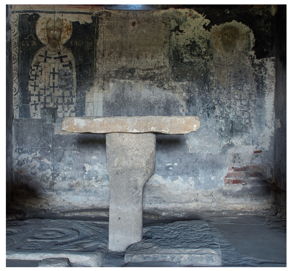
Figure 18. The murals of Master Theophilus in the Streisângeorgiu church.

Transylvanian case. We should look for cultural ones, according to the "inner history" of what cultural acts may show they have in common.