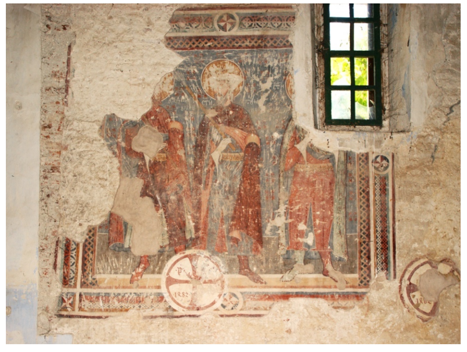
Figure 7. The Holy Kings of Hungary in the murals of the Chimindia church.

Let us re-evaluate the problem: The interpretation relaunched by Prioteasa offers many advantages, but it also has shortcomings that give rise to interpretation problems. First of all, the details are treated superficially in favor of general issues. Second, everything has been reduced to a common denominator. This choice led Prioteasa to interpret the murals in the church of Chimindia – where the names of the Hungarian Kings have been written in Cyrillic letters – as being of an Orthodox nature only to fit into the scheme, even if the author herself observes that the three Kings of Hungary represented there do not fall in the same category as the ones painted in Ribita or Criscior (Prioteasa: 44).<sup>18</sup> Moreover, there is absolutely no evidence as to the presence of any Orthodox parishioners in Chimindia (Burnichioiu: 347). Last but not least, Prioteasa's inventory and comparison with the other Transylvanian murals depicting the Holy Kings of Hungary tries to explain the part according to the whole, and not the other way round (Prioteasa 2009: 48), a choice which leads to ignoring the differences between the representations (Figure 7).