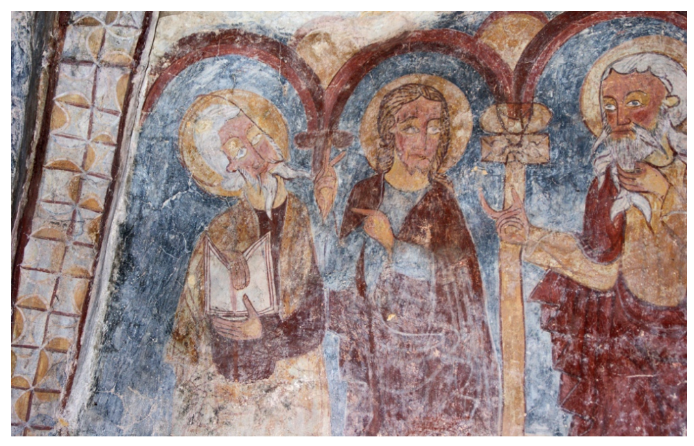
Figure 17. The murals of master Grozie in the Strei church.

network that was once traced at the ethnic level (Romanian vernacular art or architecture), social (the so-called aristocracy of the knezes), political (the three Holy Kings of Hungary), or economic (the imported models or even the conditioning of art to the existence of a social class of specialized craftsmen) need to be quickly reassessed. Only afterwards should they be recuperated in order to assemble a complex network, on many levels, according to many secondary factors, independent from the knots of our cultural Transylvanian cobweb. Cultural networks may be trans-social and trans-ethnic, they do not depend directly on economic and political factors, but on constantly changing formae mentis . Some of these medieval formae mentis must have been Romanian, Hungarian, and Saxon at the same time.