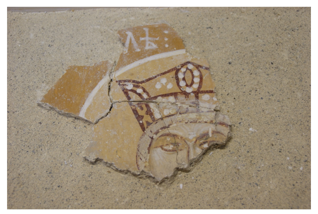
Figure 3. One of the Răchitova mural fragments, preserved at the Art Museum of Cluj.

the community. Research should not avenge a class struggle whose traces have not been found. The churches may be Orthodox, Catholic, cathedrals, metropolitan, chapels, and so on, because these are the natural attributes of a church. They may never be deemed as courtly churches, even if they were built next to somebody's court.