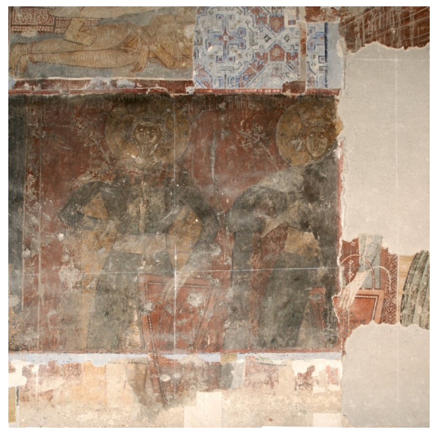
Figure 5. The Holy Kings of Hungary in the murals of the Ribita church.

Mohács disaster (1526).<sup>13</sup> Nonetheless, the only argument is that the two voivodes were recalled in an act of judgment of 1445, an accidental confirmation of their social status. This has nothing to do with any church, be it wooden or made of stone. Thus, no connection can be drawn between the two voivodes' existence and the supposed edification of the churches.