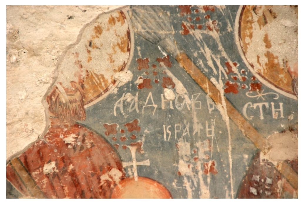
Figure 16. Detail of the inscription accompanying the Holy Kings of Hungary in the Chimindia church murals.

three Holy Kings in Ribița and Crișcior – accompanied in the last case by Latin letters inserted among Cyrillic Slavonic inscriptions<sup>35</sup> – cannot be explained in this way. They are manifestations of unique cultural acts, subject to the subjectivity of each creative individual. As far as linguistics go, language is not necessarily linked to the ethnic or confessional factors.