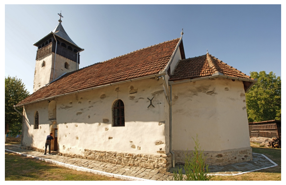
Figure 1. Crişcior church. Exterior view.