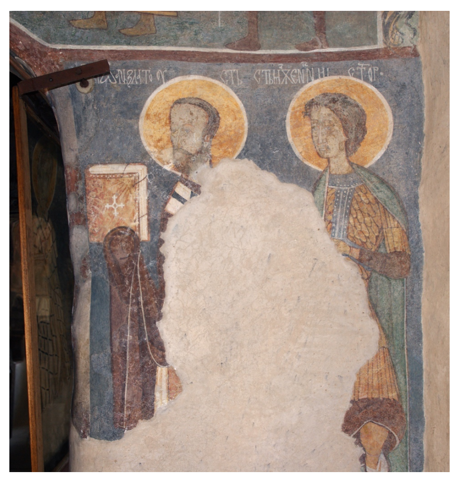
Figure 11. The murals of master Mihu from the Râmeț monastery church.

in the Balkans.<sup>23</sup> When one becomes aware of the unequal and partial state of the documentation, one does not pick up the earliest knot in the analyzed cultural network and invest it with the role of an archetype or prototype. One should be more interested by the very existence of the network. Such a network proves that the many contradictions between economic and ethnic factors are in fact the result of a poorly chosen methodology.