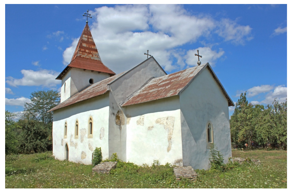
Figure 2. Hălmagiu church. Exterior view.

I do not intend to insist on this idea, but I cannot help mentioning that one may also find among these courtly churches the "voivodal" church from Hălmagiu (Figure 2).<sup>10</sup> This voivodal church is an inflated courtly one. It had to be bigger, for its founder was a voivode – in this case, the voivode Moga. But Moga was not Mircea the Elder of Wallachia, a voivodeprince who may have founded "princely" churches. Moga was a local nobleman who had gathered a certain amount of wealth and ruled over several villages. The church he built (an unconfirmed deduction, actually) is greater only because Moga had money. However, it is not very different from those in Ribița or Crișcior, nor from the one in Zlatna, much larger and yet "un-voivodal" to the researcher's eyes. The theoretical premises are wrong, for the attribute only makes sense of the social factor. One would better give up this terminology and simply talk about the local church of Hălmagiu.<sup>11</sup>