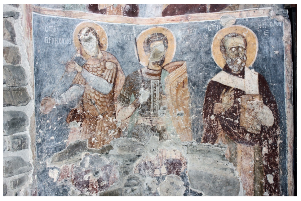
Figure 12. The murals of master Stephen from the Densus church.

is the case of the painter Mihu from White Criş, who painted the church of the Râmeț monastery, whose talent could not have existed – as modern research put it – in the absence of a "school" (Figure 11).<sup>24</sup> In fact, when the notion of "school" is invoked (many of these schools have only one or two representatives), there is a Marxist theoretical line behind it. Because everything is defined in terms of progress, this line dictates that progress can only intervene as a result of economic or social evolution. Marxism evaluates cultural changes as effects of economic processes that connect human communities and force individuals to act in a certain way. Starting from such a premise, it is considered that the identification of formal similarities between the various manners of painting of medieval painters provide arguments in favor of identifying some painting schools to which the master painters must have belonged.<sup>25</sup> This abasement of the cultural act reduces the activity of these schools to an economic caricature. The painters painted for money; consequently, stabilizing their activity in a precise social and economic segment allows for the creation of a "class" of painters who gain their existence exclusively from this activity, without having any other social function.