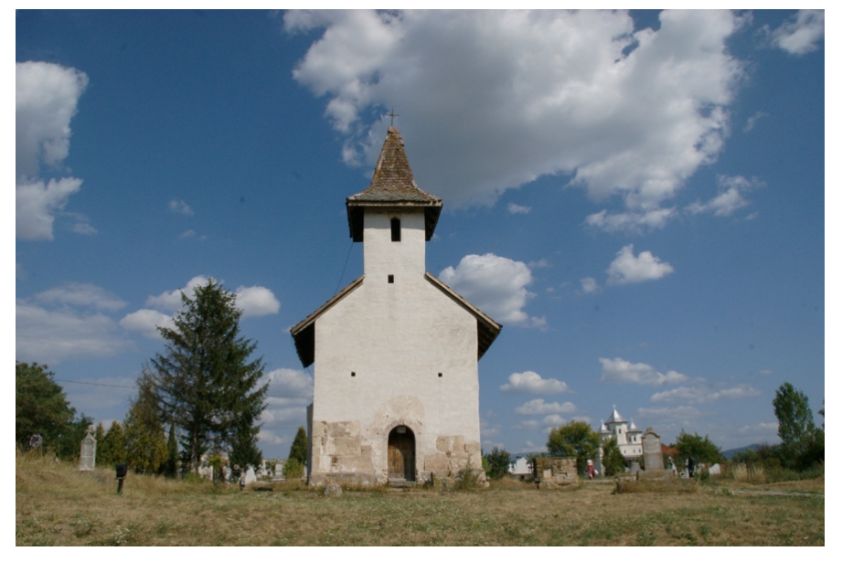
Figure 10. Streisângeorgiu church. Exterior view.

funds to sustain a continuous campaign of building churches. As such, the craftsmen had to be foreigners. That is why the origins of Transylvanian architecture and painting had to be sought someplace else. In this line of argument, for example, it was stated that the rectangular pattern of the apses in most churches of Hateg or Apuseni was first put into practice at the church in Sântămărie Orlea (Figure 9), an edifice that would have influenced other constructions with a similar architectural style, of which the most important should have been the one in Strei (Drăguț 1968: 11; R. Popa 1988: 232). This scenario operates only on economic criteria. It required, for instance, the visit of master craftsmen from the West. Once they arrived in Transylvania, they were supposed to participate in the building of Cistercian churches – Gothic, but still preserving Romanesque features. There is nothing to deny until this point of demonstration. The building of the abbey in Cârța could not be done without these foreign craftsmen. The problem is that the Sântămărie Orlea church has absolutely nothing in common with the so-called Cistercian architecture. It resembles a lot of other foundations in the Kingdom of Hungary, and what is more, Sântămărie Orlea was not the first rectangular apse church in the land of Hateg.