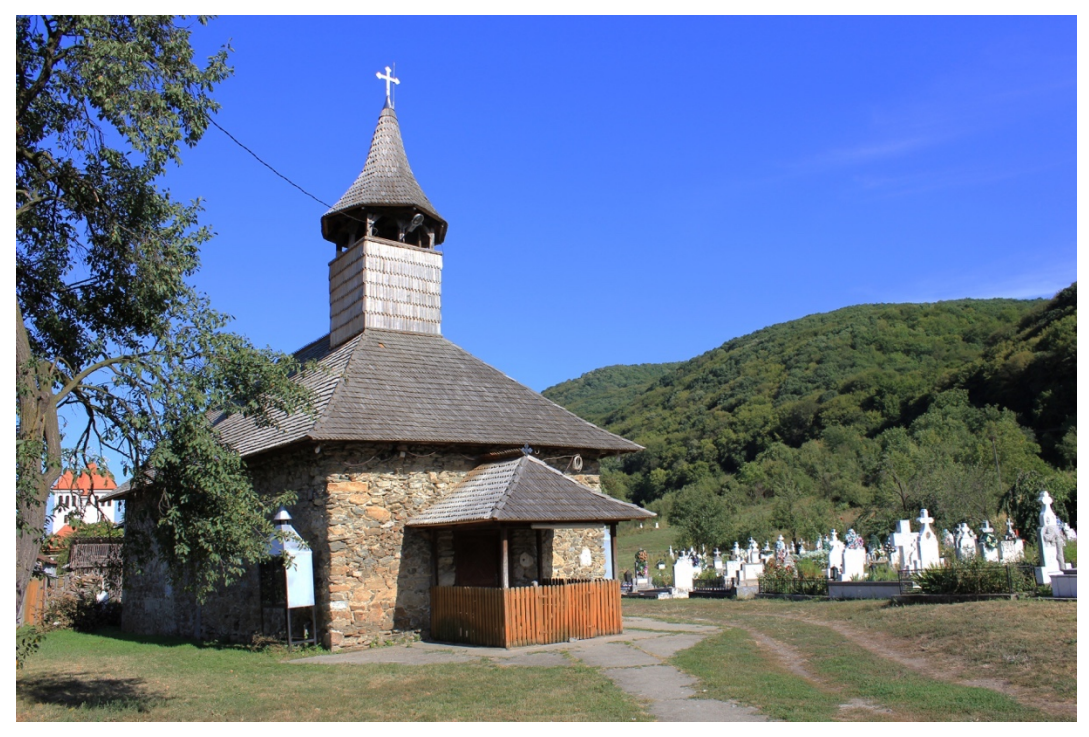
Figure 4. Leşnic church. Exterior view.

These types of analyses cannot be reproduced in the more well-documented cases of the West. To give an example, Lorenzo Veneziano's works cannot be studied according to the relationships his commissioners had. His polyptics tell very little about these patrons, and only in an indirect manner. That one of the commissioners may have learned of the painter's skill or fame from a previous patron is not to be ignored. But the painted altar of Lorenzo Veneziano forms a cohesive artistic corpus whose history is rather one of the ways in which the painter blended extra-Italic influences and Po Valley models. The relationship with the sponsor or patron was secondary, since it may help understand the artist's personal life (Guarnieri). Similarly, in Transylvania, medieval artists traveled and painted for various patrons. The latter would have known each other, but this had no effect on the style or themes used by the painters. One should not sacrifice art history research for the sake of a hypothesis that does not explain art, but only the family ties in a vicious circle.