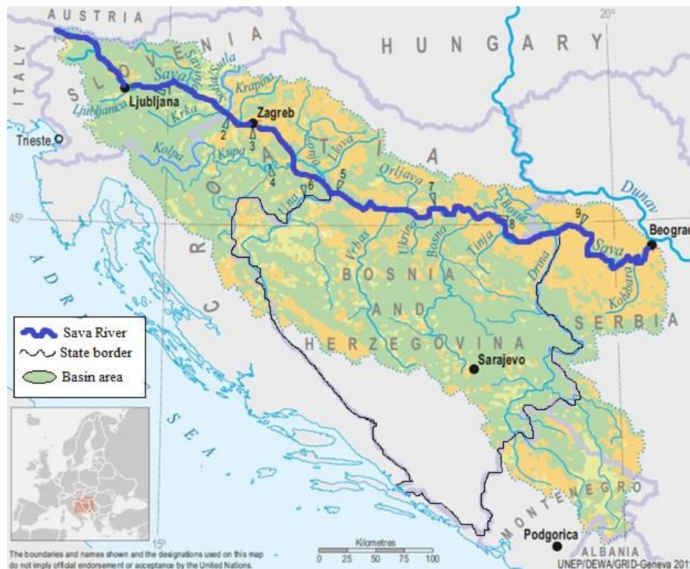
Figure 1. Sava River basin and its area on the territory of Bosnia and Herzegovina

Other than being main agricultural area for the country, the Sava River basin also represents an important source of water for settlements (the biggest regional centers directly or indirectly depend on Sava River or one of its tributaries), industry, energy and all the ecosystems. Due to all the reasons mentioned, Sava River basin is an integral part of the development and support for each and every of the sectors mentioned, and thus, a valuable target for a nexus assessment.