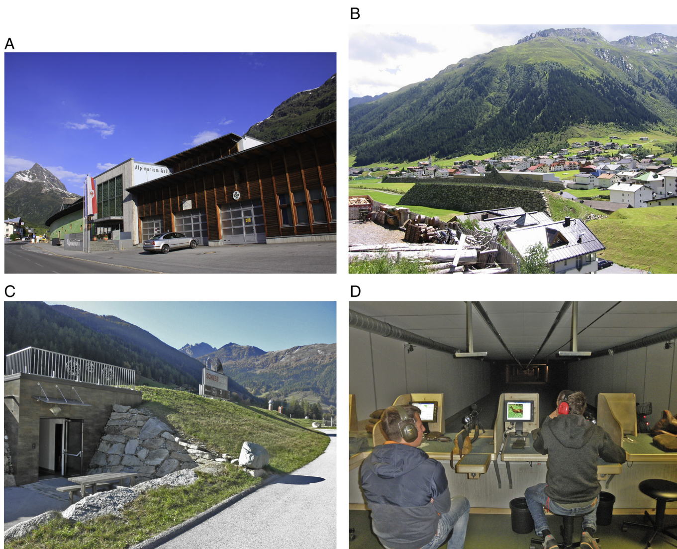
Fig. 1. Examples of multi-functional protection schemes in Galtür and Großkirchheim, Austria. a) Picture of Alpinarium. Credits: M. Keiler; b) Galtür avalanche dam. Credits: S. Fuchs. c) Entrance shooting range in Großkirchheim; Credits: A. Rieger; d) Insight picture of shooting range in Großkirchheim. Credits: A. Rieger.

Further, transformation at a local level may provide a mechanism for such processes to be upscaled to a regional level. Drivers for such upscaling processes vary greatly. Nevertheless, an important external driver is a so-called window of opportunity (or policy window), e.g. in the aftermath of natural disasters such as the 1999 Marmara earthquake, which created a political change in Turkey (Pelling and Dill 2010; Westley et al. 2013; Few et al. 2017; Fuchs and Thaler 2017). Extreme events often create such policy windows, providing a tipping point to initiate large-scale adaptation efforts, which may lead to transformative change (Kates et al. 2012). The transition from one adaptive cycle into another can consequently lead to a new system and, in this way, allows a transformation of the current system status (Gunderson and Holling 2002; Walker et al. 2004; Folke et al. 2010). Nevertheless, Walker et al. (2004) argue that the outcome is not necessarily positive. When change is desired, deliberate transformation takes place, whereby the system is analysed in its current state versus an alternative and perhaps undesired state (Walker et al. 2004; Westley et al. 2013). Thus, transformation is also considered at different scales in which thresholds are exceeded in order to form new system states (Folke et al. 2010). Nevertheless, the outcome of transformation does not always foresee negative results (Von Wirth et al. 2016; Clarke et al. 2018).